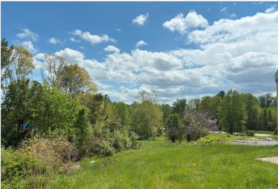
View of open space and existing vegetation at the rear of the subject property