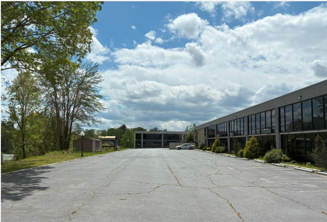
View of frontage of east parking lot and east face of main building and the north face of the annex building