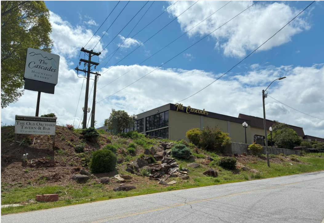
View of corner of the site from Sugarloaf Rd