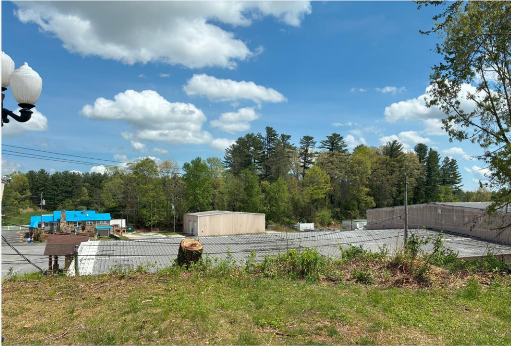
View of neighboring properties to the east from subject property