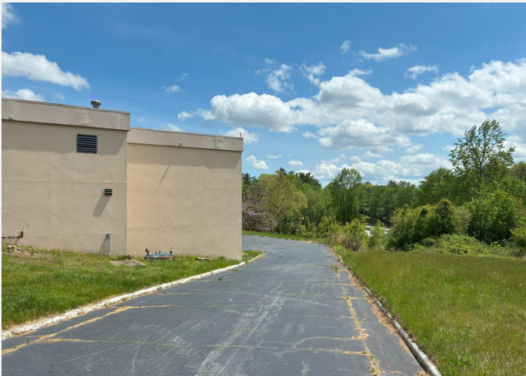
View of access to rear of annex building. I-26 in background.