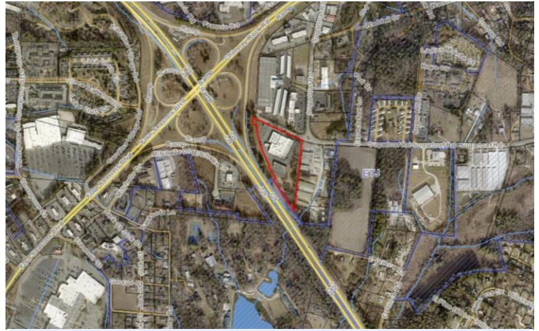
SITE VICINITY MAP

The City of Hendersonville is in receipt of a Conditional Zoning District application from Jacob Glover of Pace Living, LLC for 201 Sugarloaf Rd (PIN 9579-56-1085) totaling 6.72 Acres located along the access road at the bend in Sugarloaf Rd and also fronting Interstate 26.