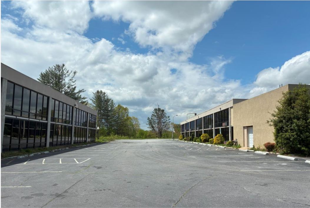
View of rear parking and rear of main building (right) and north face of annex building (left)