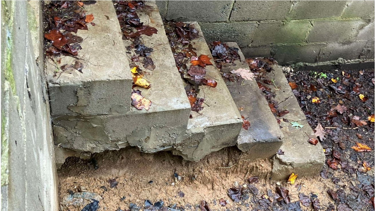
Figure 11 - Erosion Underneath Exterior Concrete Stairs