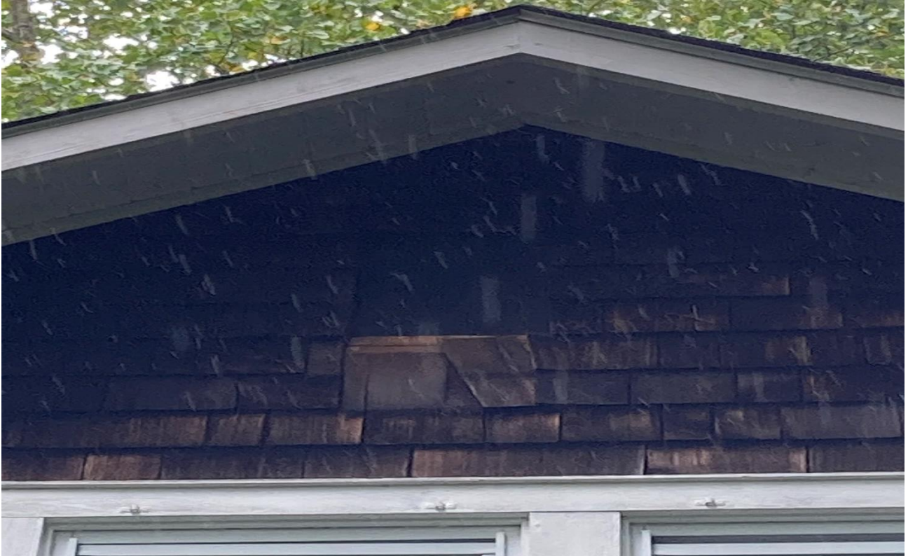
Figure 16 - Damaged Shingle