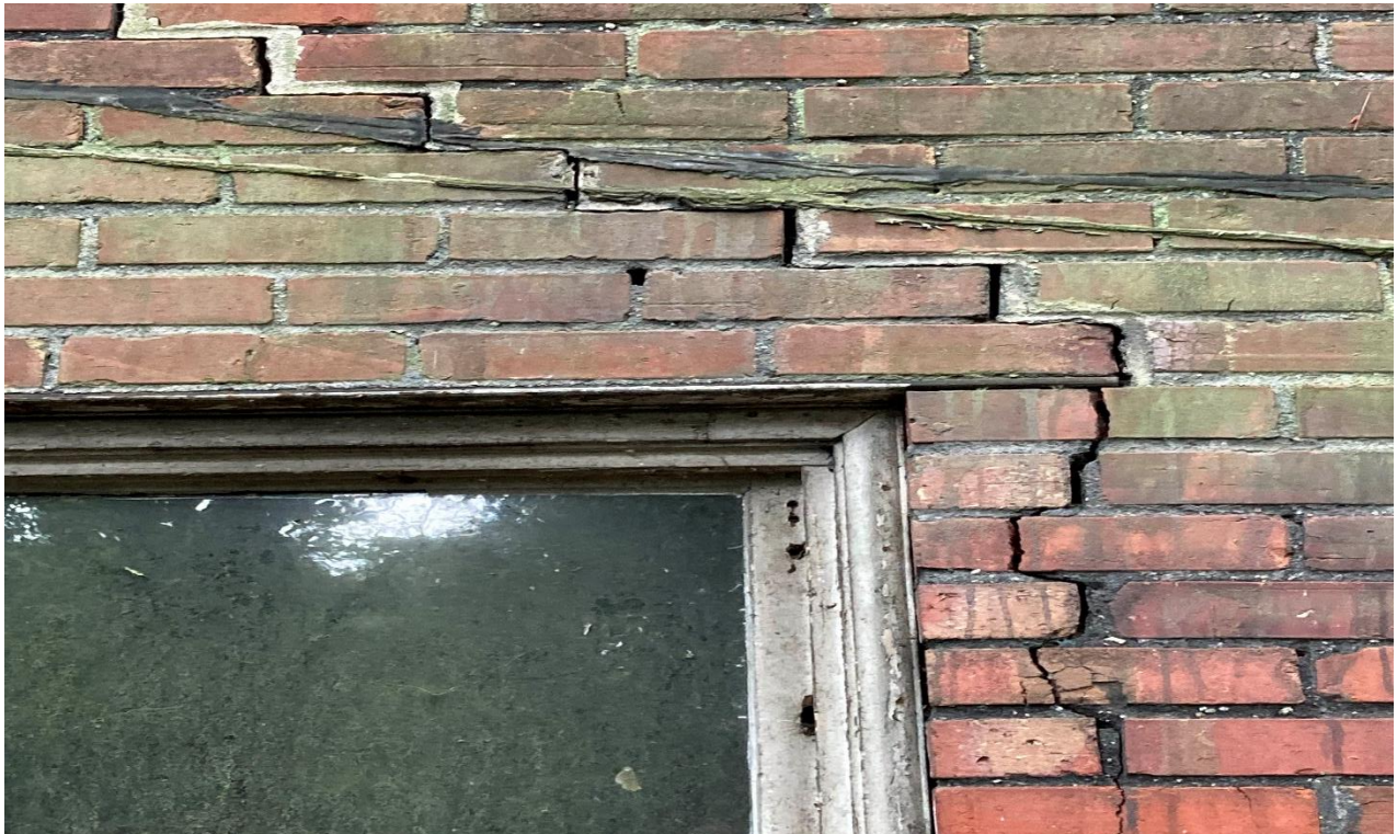
Figure 6 - Missing mortar and crack above window; rotting window frame