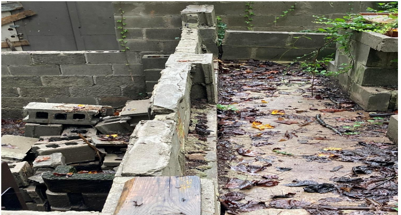
Figure 12 – Leaning Foundation/Wall for Former Boiler Room /Greenhouse