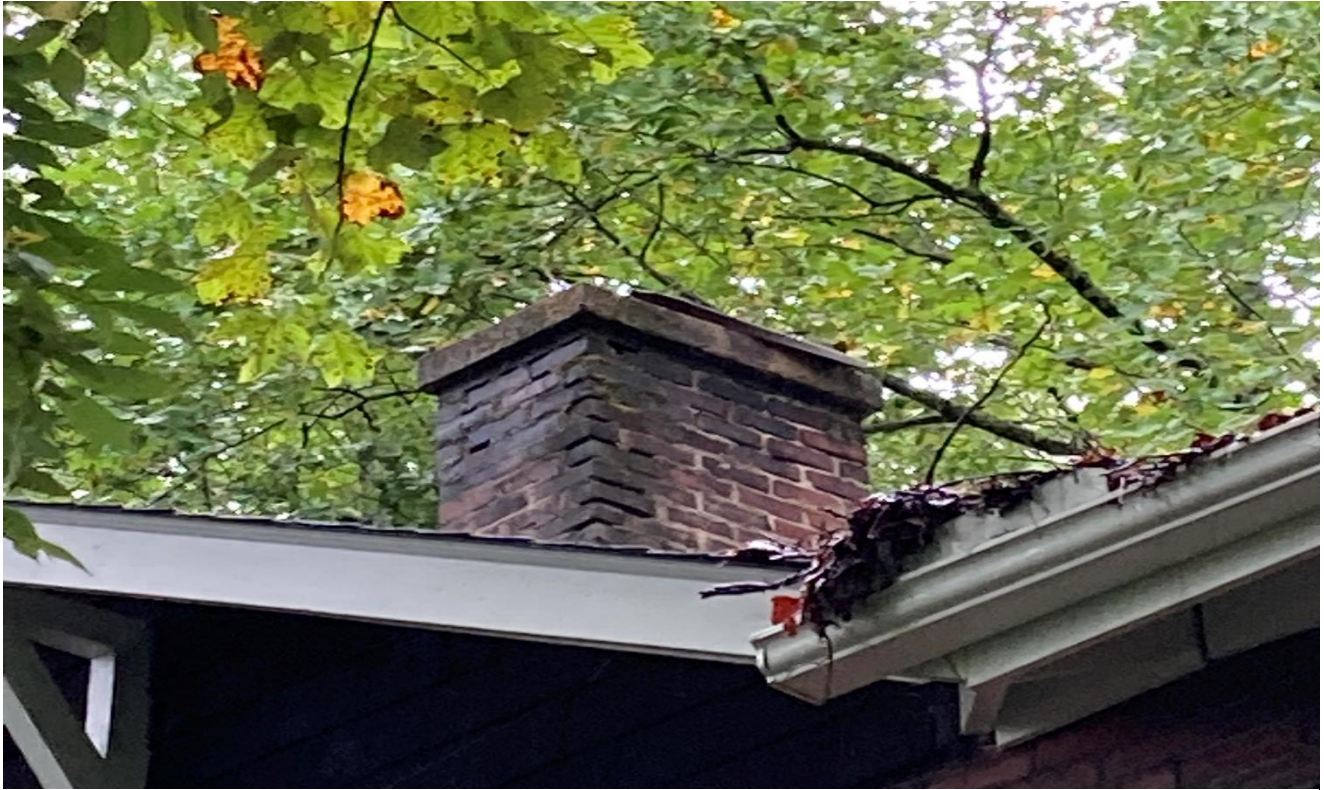
Figure 18 - Missing Mortar on Chimney