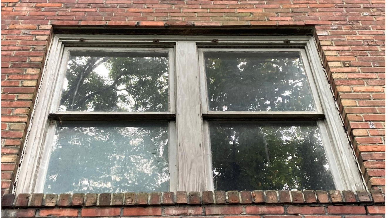
Figure 9 - Exposed/Unpainted Wood Window Trim