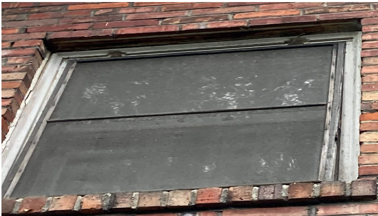
Figure 14 - Rotting Wood Window Frame