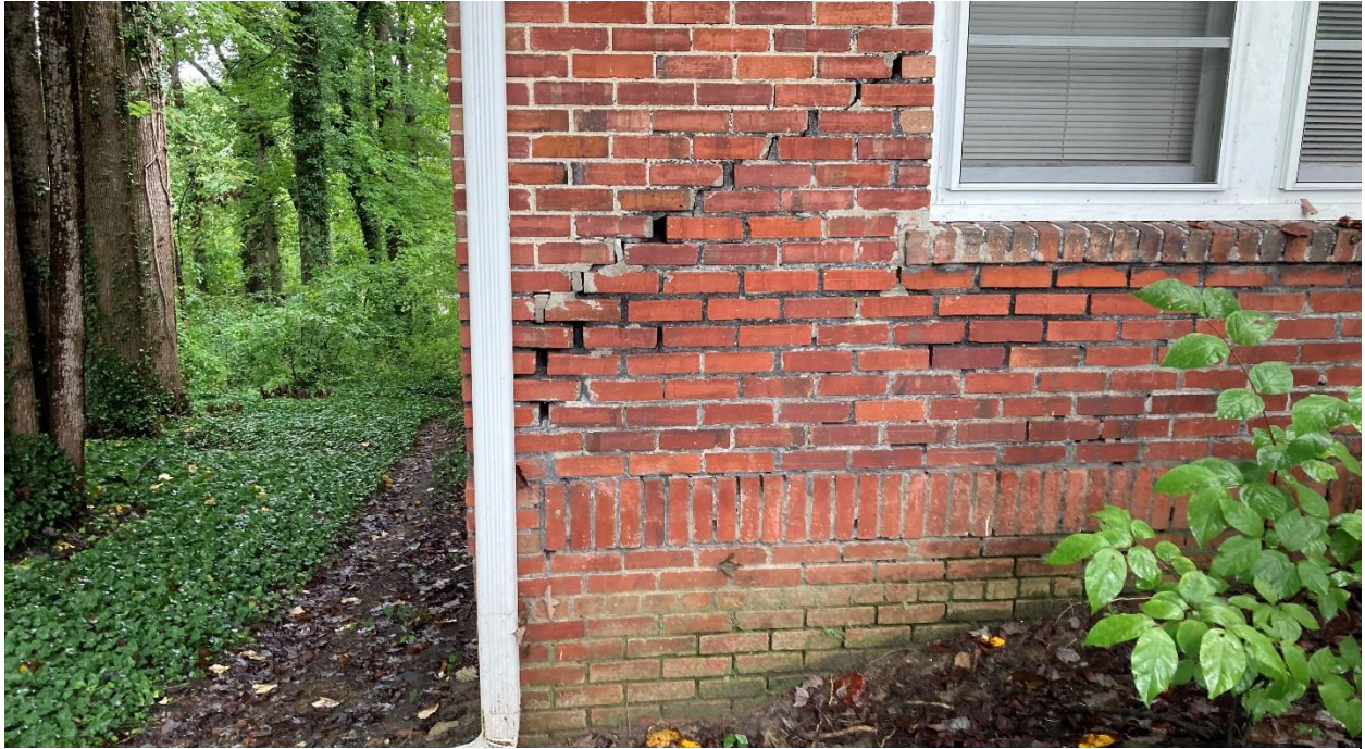
Figure 3 - Missing/Damaged Mortar