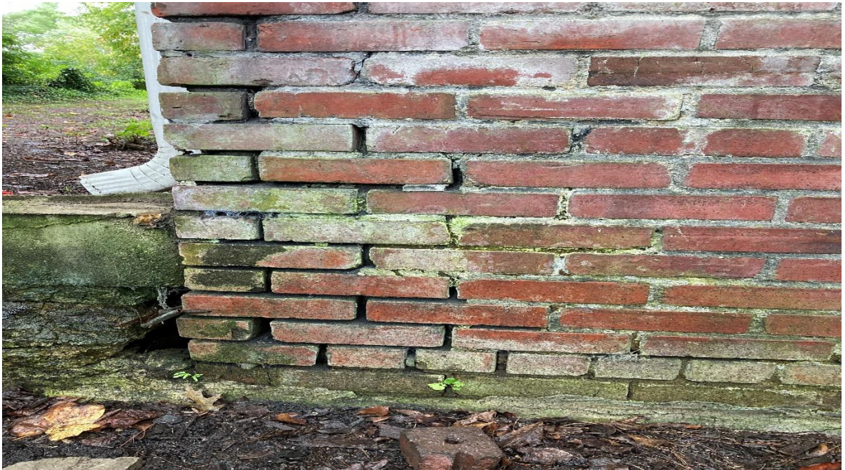
Figure 1 - Missing Mortar