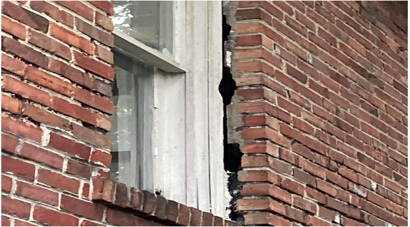
Figure 7 - Gaps between window and frame