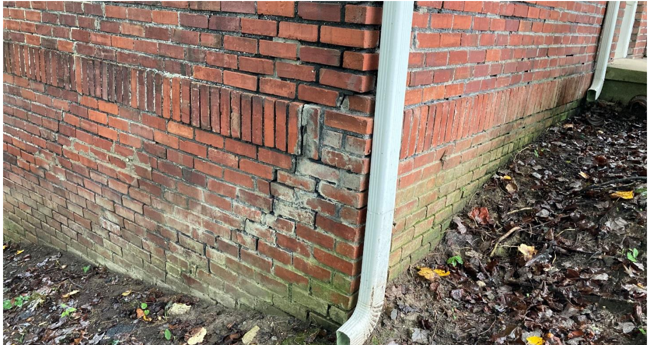
Figure 5 - Cracks in Foundation Masonry