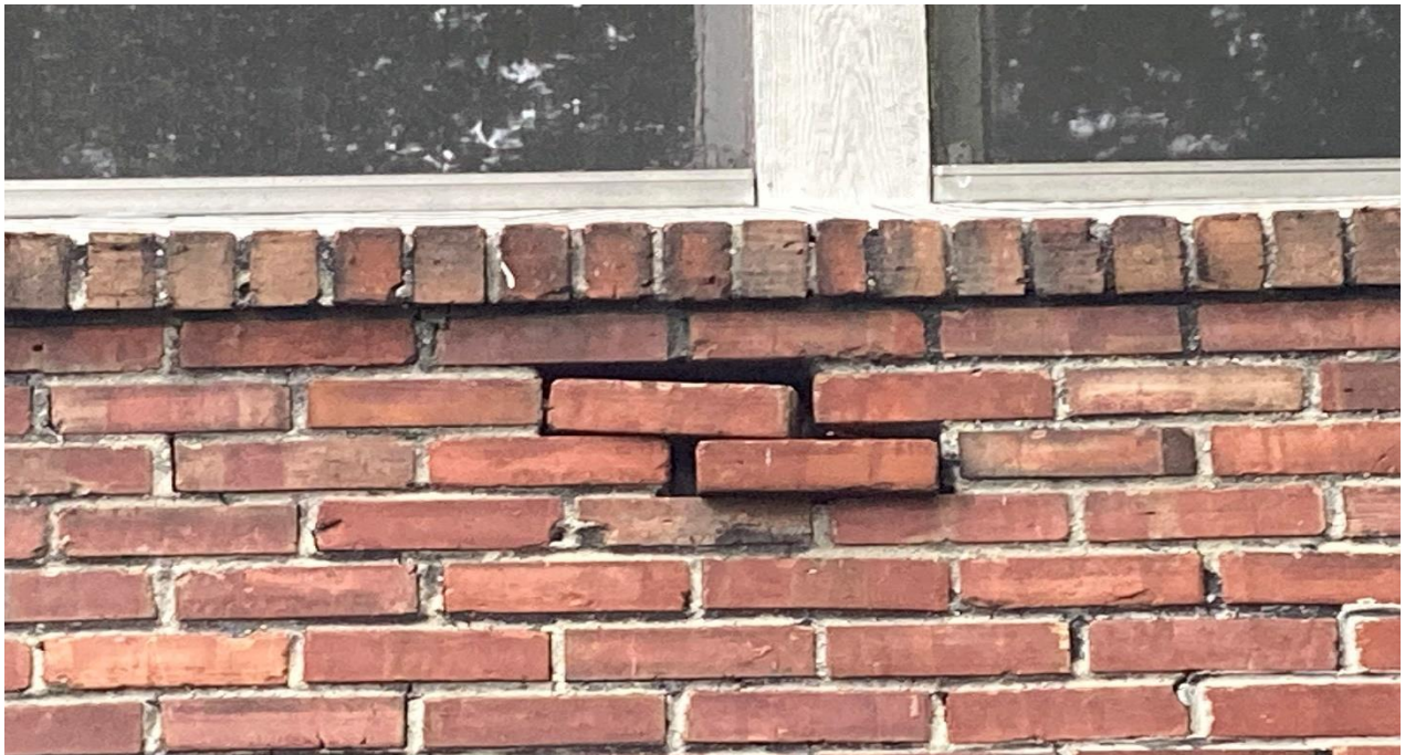
Figure 4 - Missing Mortar/Loose Brick