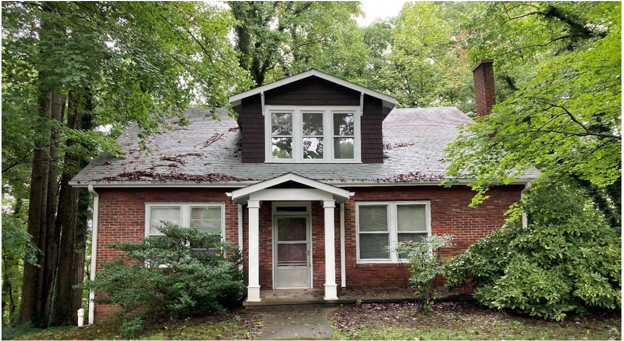
Figure 2 - 1420 Ridgecrest Drive