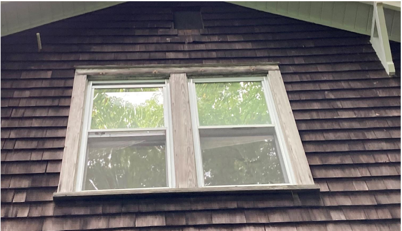
Figure 10 - Exposed/Unpainted Wood Window Trim