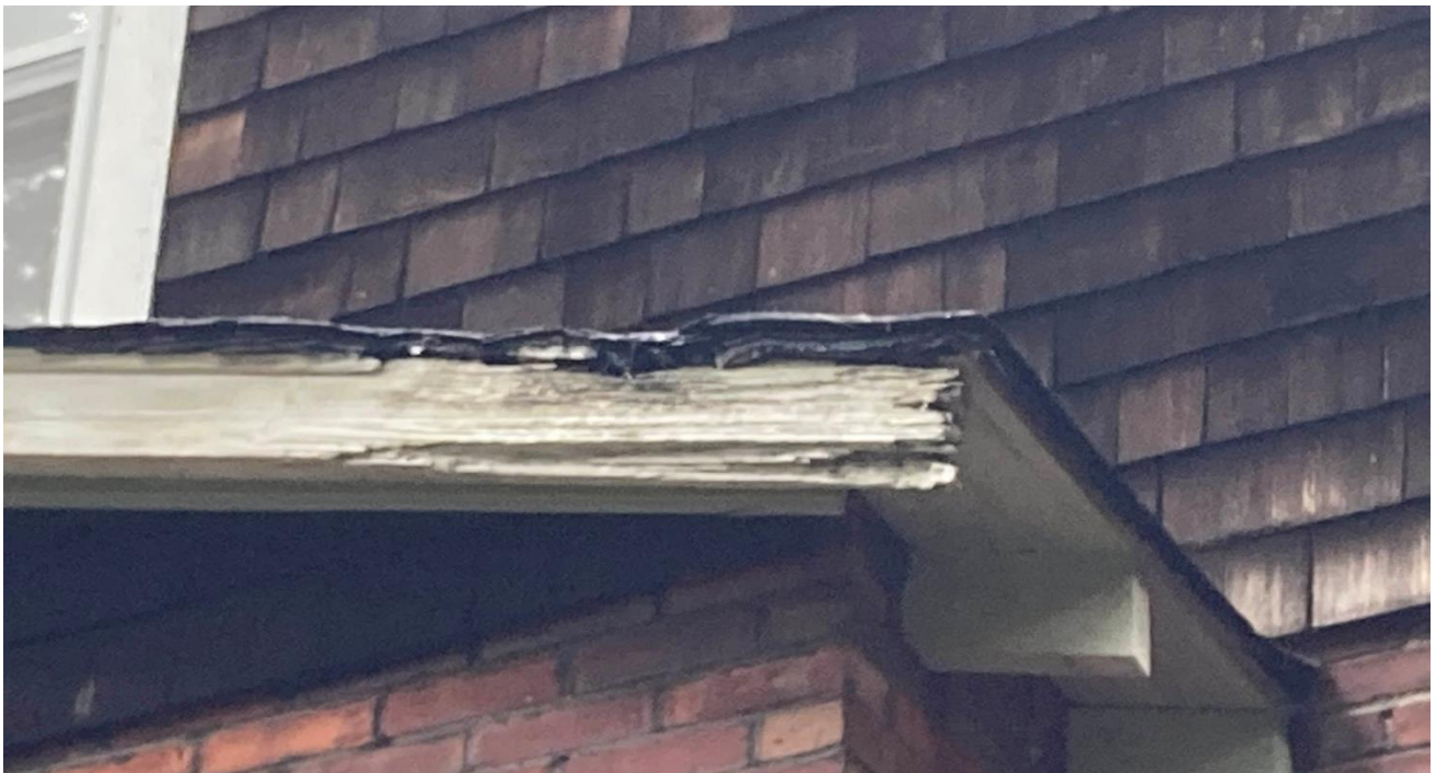
Figure 17 - Damaged/Rotten Eaves and Shingles