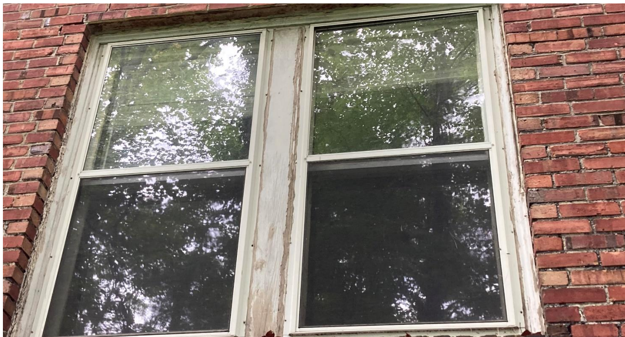
Figure 13 – Rotting/Exposed/Unpainted Wood Window Frame