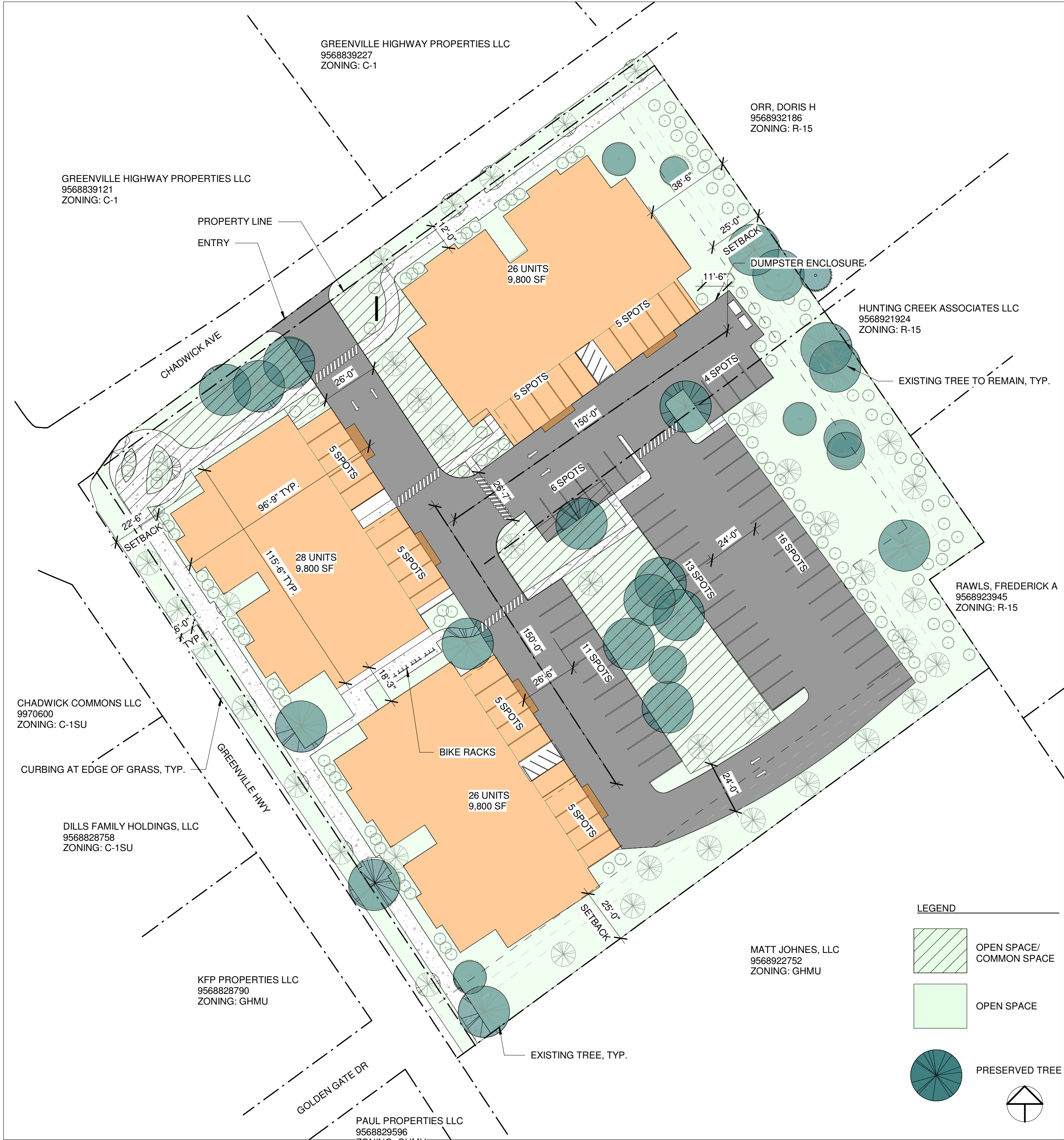
1 Site Plan 1/32" = 1'-0"

SITE: 904 GREENVILLE HWY, HENDERSONVILLE NC 28792-6224 PIN: 9568921924 ALL CALCULATIONS APPLY TO THE AREA OF THE SITE AFFECTED