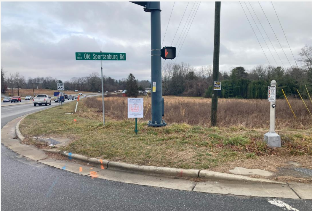
View facing east along subject property frontage at corner of Upward Rd. & Old Spartanburg Rd