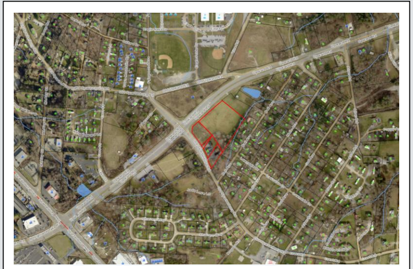
SITE VICINITY MAP

The City of Hendersonville received an Annexation application from the Spinx Company, LLC (owners) for 5 parcels totaling 4.58 Acres located along Upward Road at the southeast corner of the intersection with Old Spartanburg Rd (across from Dairi-O). The applicant has not requested zoning, therefore the City is initiating zoning for these parcels from County CC, Community Commercial to CHMU, Commercial Highway Mixed Use.