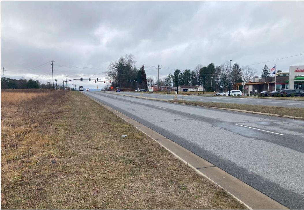
View facing west along subject property frontage on Upward Rd.