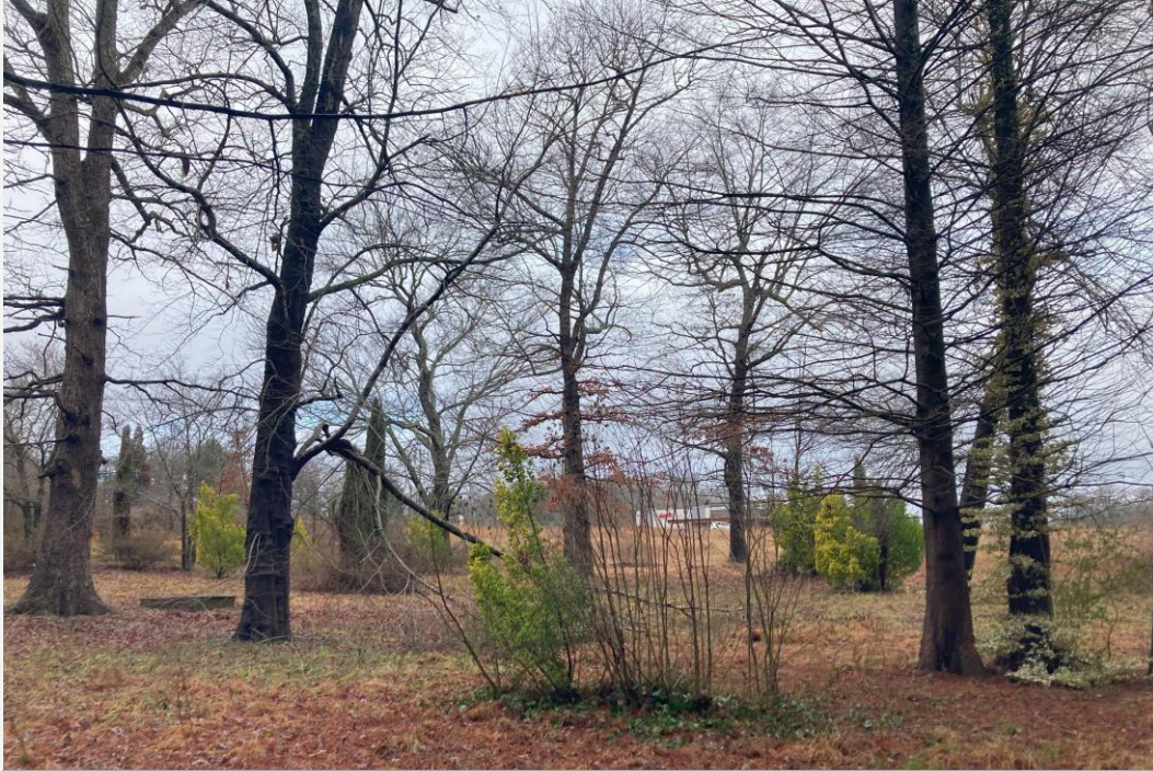
View of tree grove in south/southwest area of the site (behind existing single-family home). Remainder of the site is field.