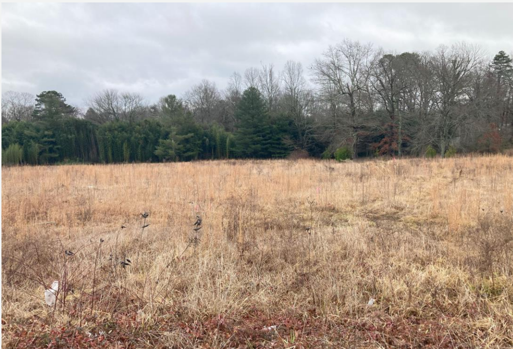
Typical view of site from Upward Rd. Dense bamboo lines entire rear boundary of site. Site of tree grove on right side of photo.