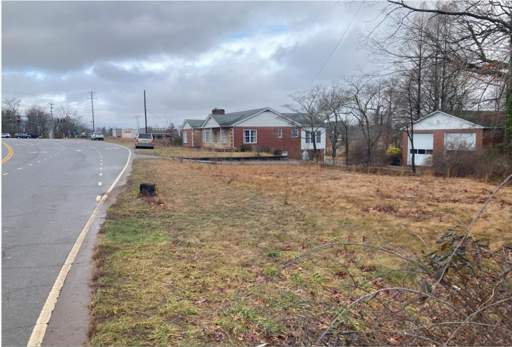
View facing north along subject property frontage on Old Spartanburg Rd. Single-family home is part of subject property