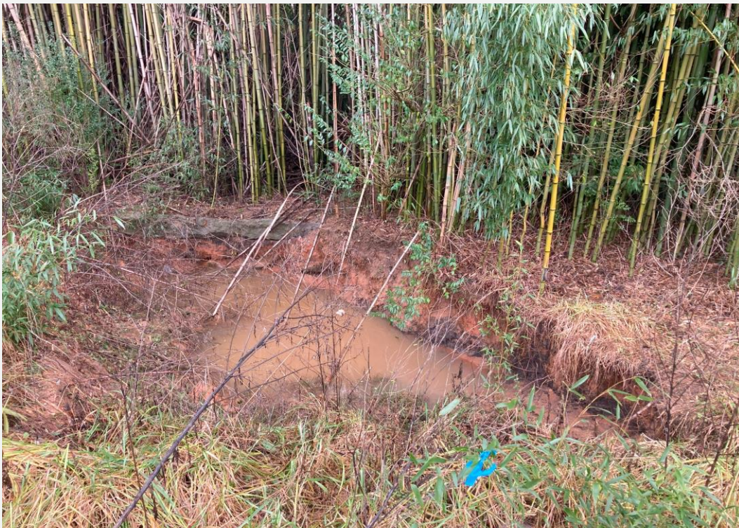
View of sinkhole or drainage basin at rear edge of subject property