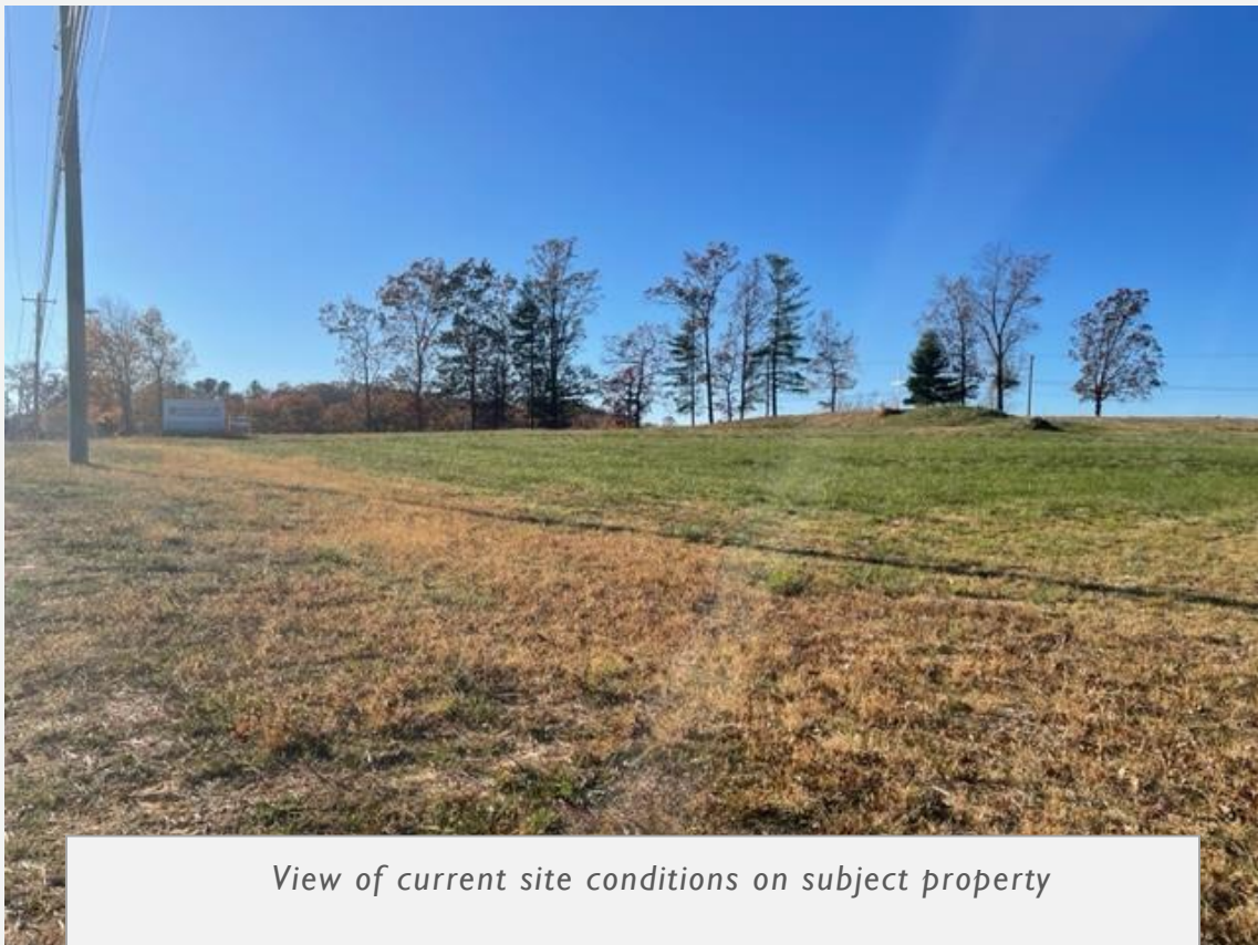
View of current site conditions on subject property