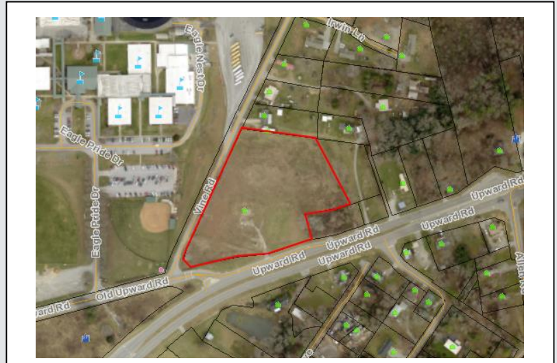
SITE VICINITY MAP

The City of Hendersonville received an Annexation application from Living Savior Evangelical Lutheran Church (owners) for a parcel totaling 4.38 Acres that is located between Upward Road and Vine Road near East Henderson High School. The applicant has not requested zoning, therefore the City is initiating zoning for this parcel from County CC, Community Commercial to CHMU, Commercial Highway Mixed Use.