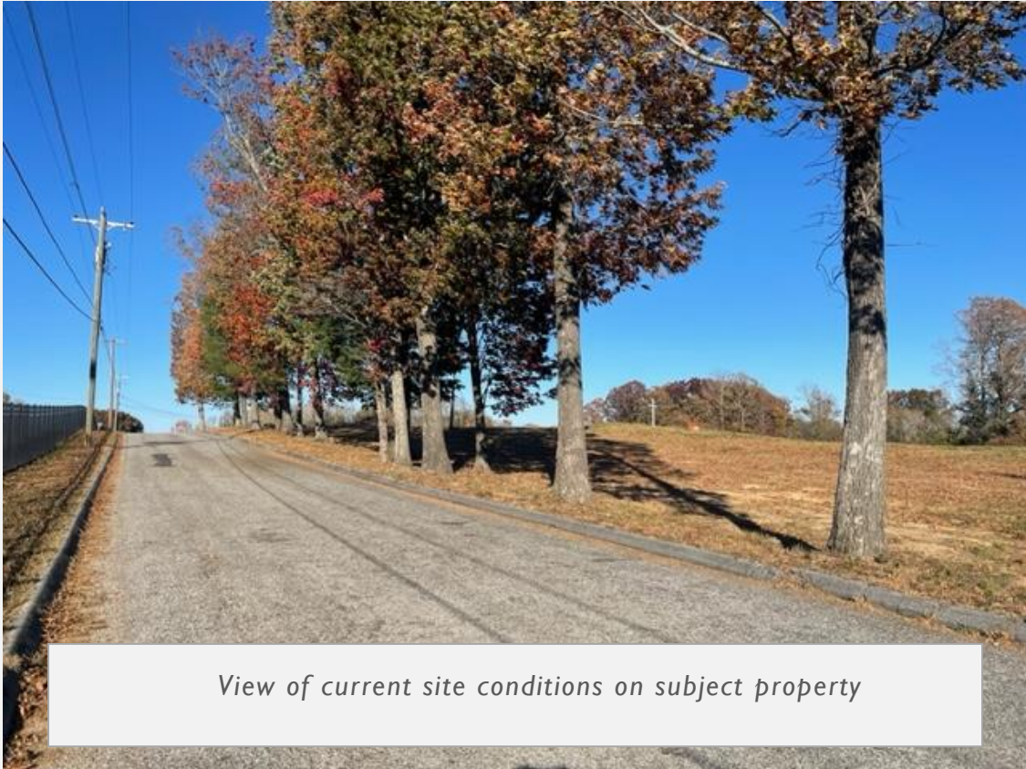
View of current site conditions on subject property