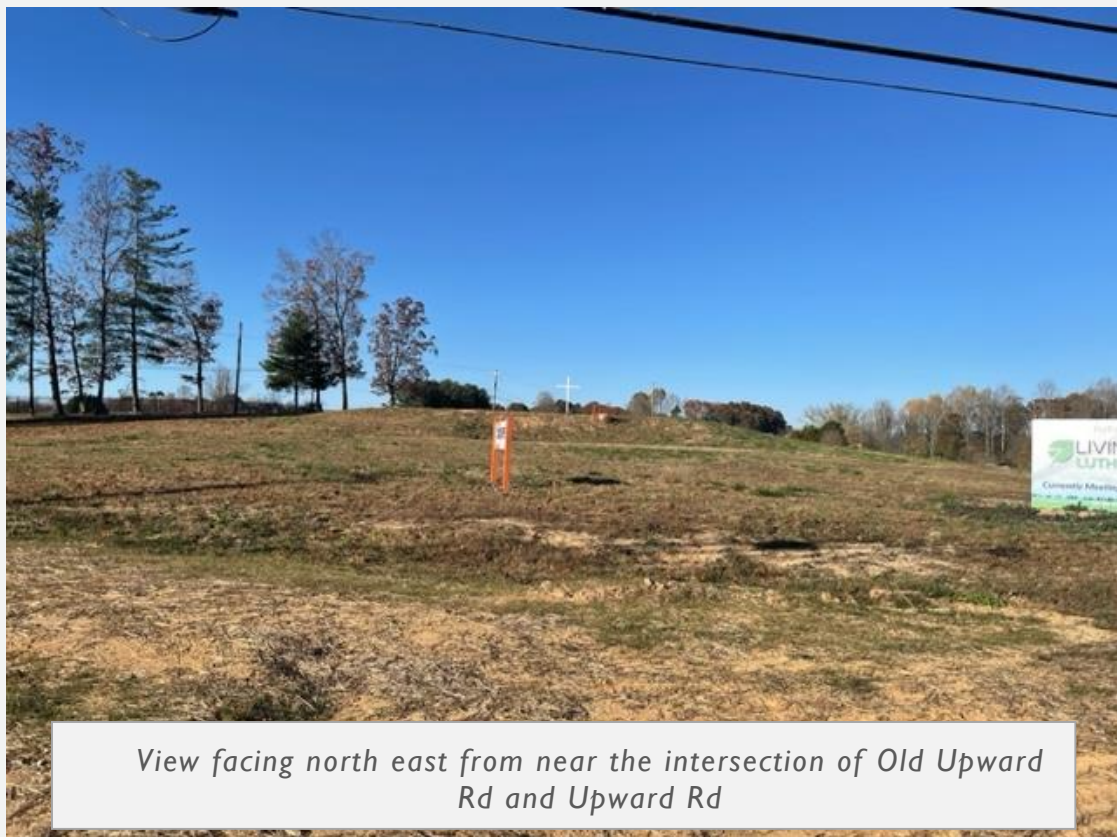
View facing north east from near the intersection of Old Upward Rd and Upward Rd