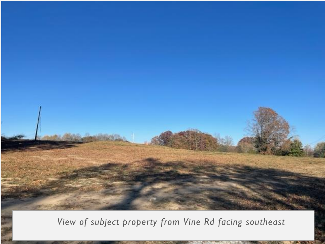
View of subject property from Vine Rd facing southeast