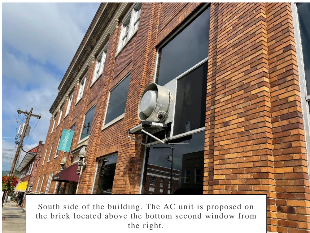
South side of the building. The AC unit is proposed on the brick located above the bottom second window from the right.