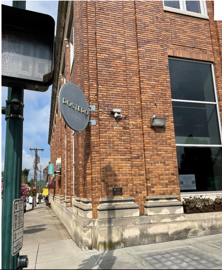
View of the front corner of Postero. The AC unit will be installed on the left side of the building.