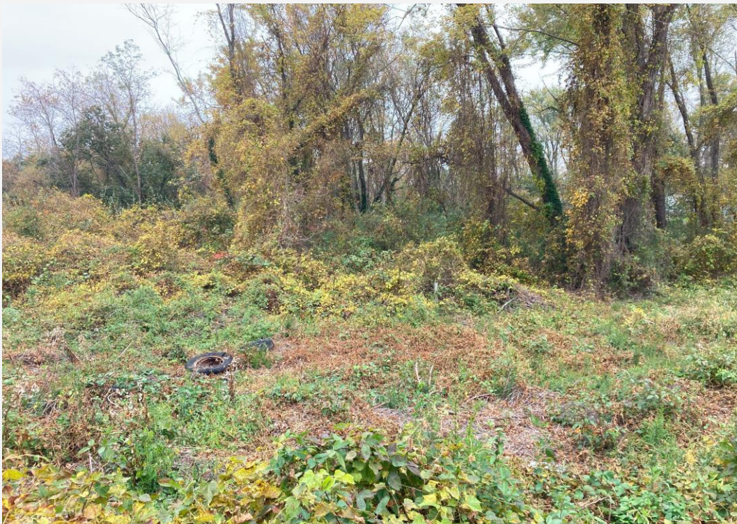
View of adjacent property to the rear of subject property