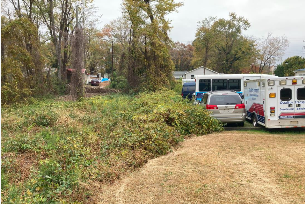
View of the rear of the subject property