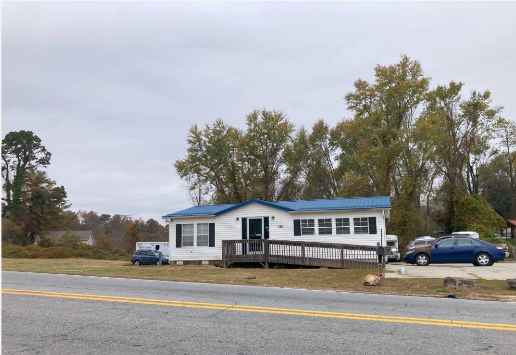
View of current structure on subject property