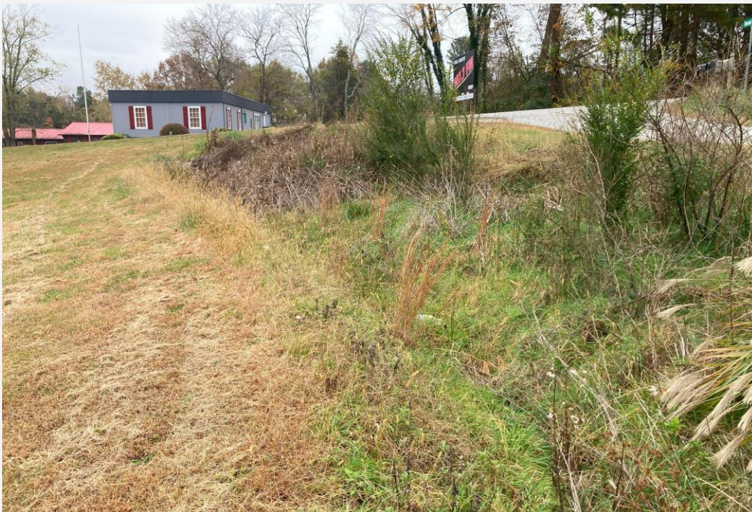
Swale along western edge of property located in unopened right-of-way