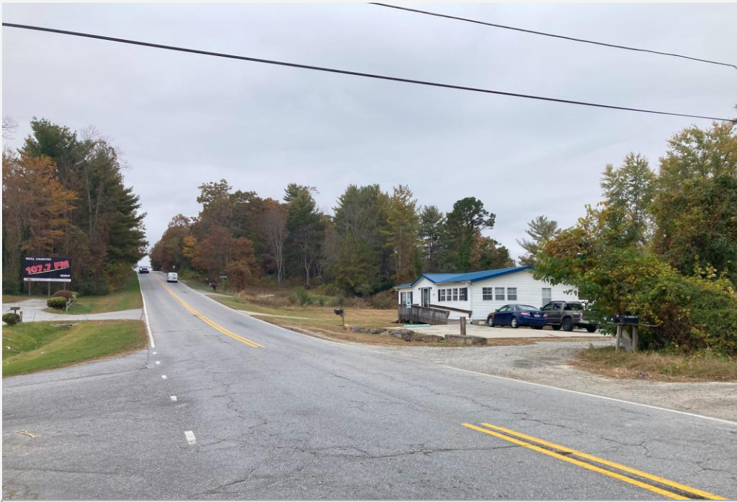
View along Signal Hill Rd facing west. Linda Vista Dr on left. Subject Property on right.