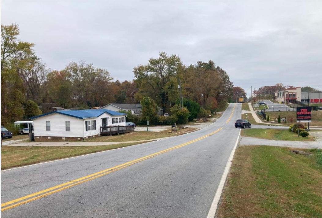
View along Signal Hill Rd facing east. WHKP property and Signal Hill Storage on right. Subject Property on left.