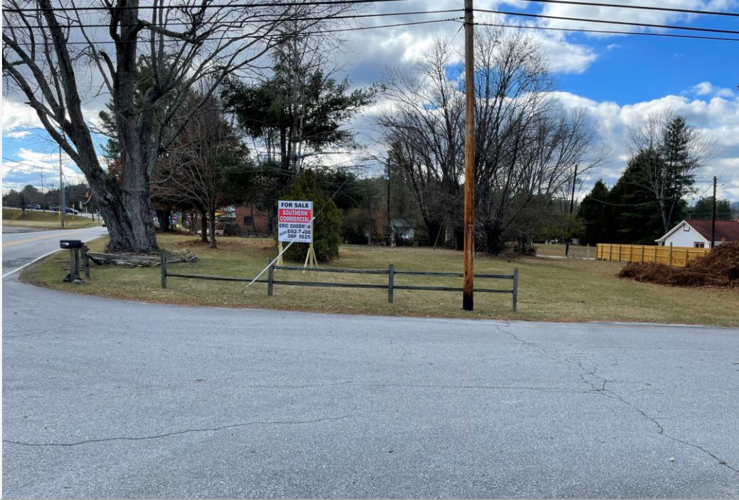
View of the subject property from the “City View Center” plaza.