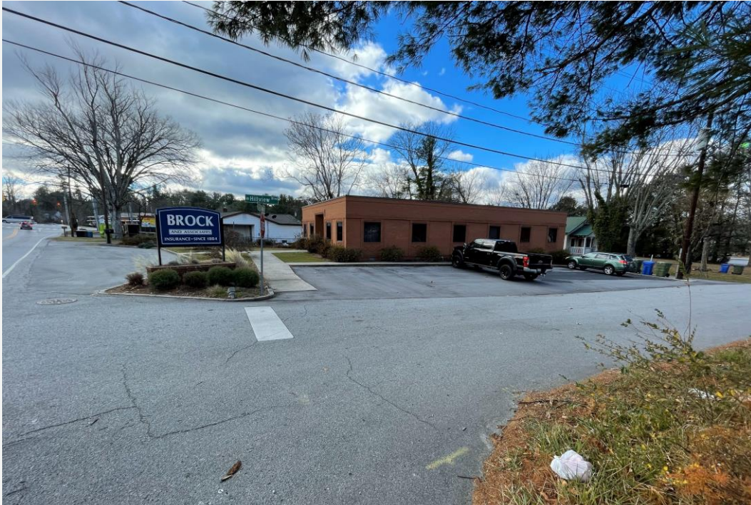
View of Brock & Associates which is located across Hillview Blvd. from the subject property.