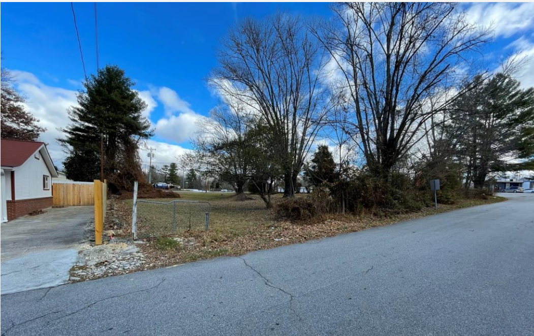
View from Hillview Boulevard to the subject property.