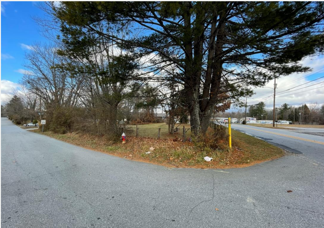
View of the subject property from the intersection of S. Grove Street and Hillview Boulevard.