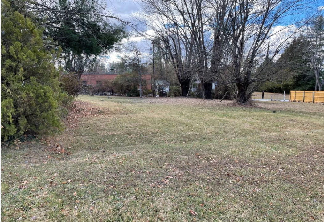
Typical view within the subject property.