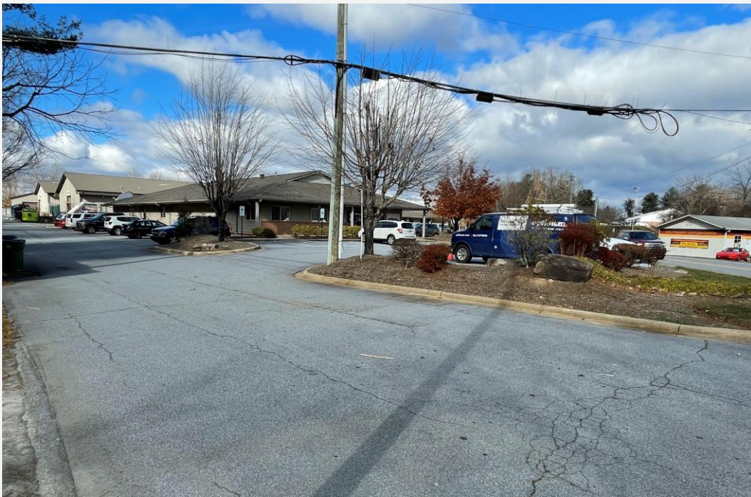
View of City View Center which is adjacent to the subject property.