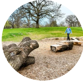
NATURAL INTERACTIVE PLAY EXAMPLES