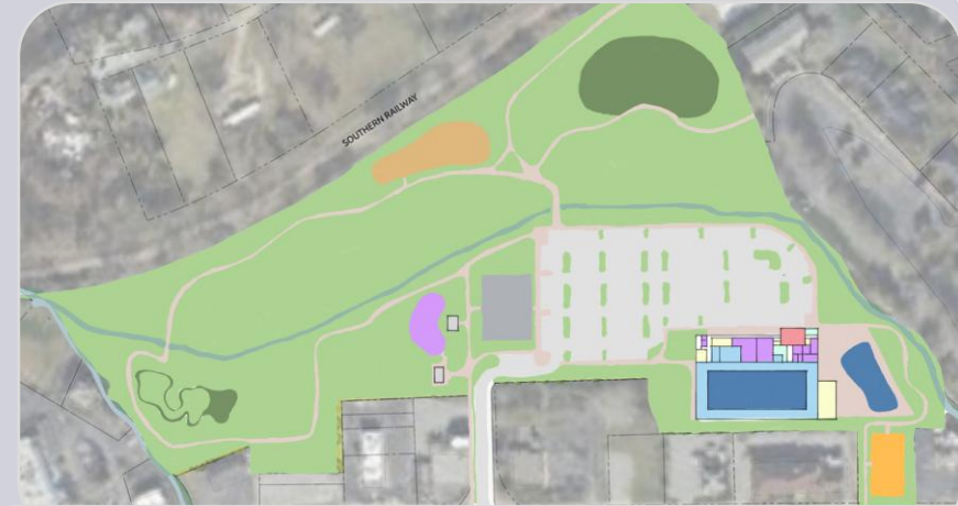
Whitmire & Toms Park

50 M Indoor Pool Outdoor Aquatics with Zero Entry Outdoor Pool Restrooms / Admin Skate Park / Pump Track Flex Lawn Playground Pickleball Courts Basketball Courts Bioretention Area Constructed Wetlands Slough Social Swales Trail Restrooms Picnic Shelter