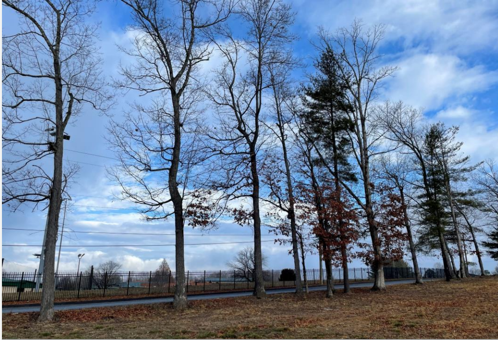
View of the mature trees along Vine Road. 24 Trees were identified along this property line. 13 Retained, 11 removed.