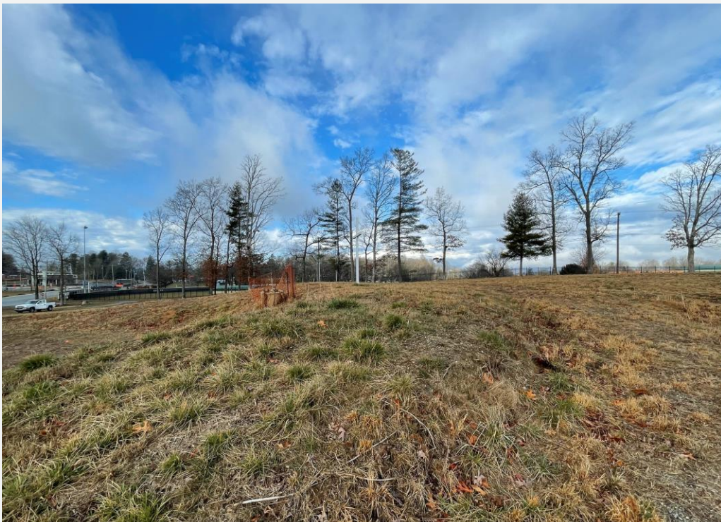
View of site facing west towards East Henderson High School.