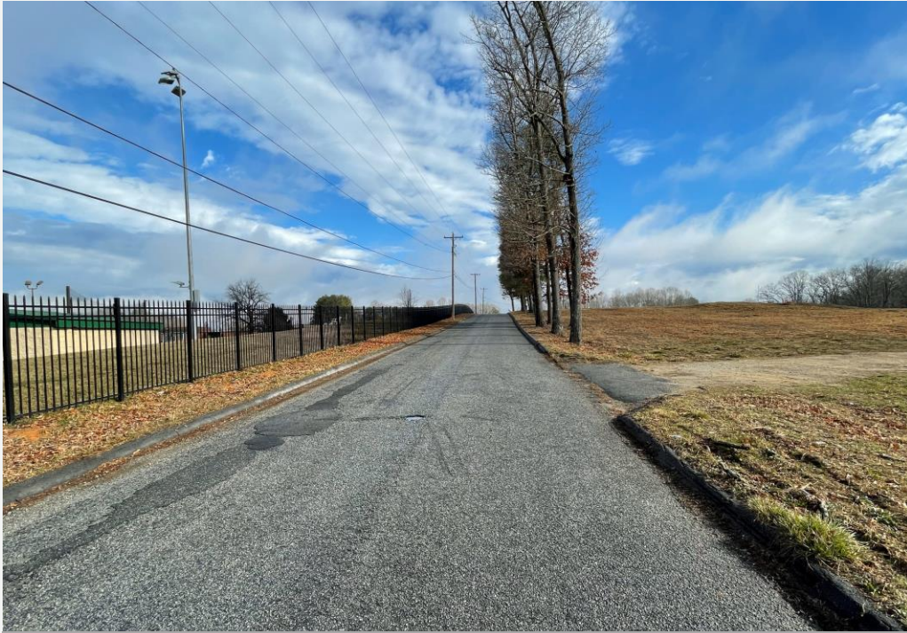
View of Vine Road. Both access points will be off of Vine Road.