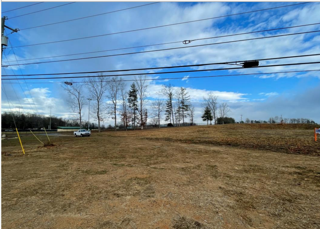
Typical view of the subject property looking northward.