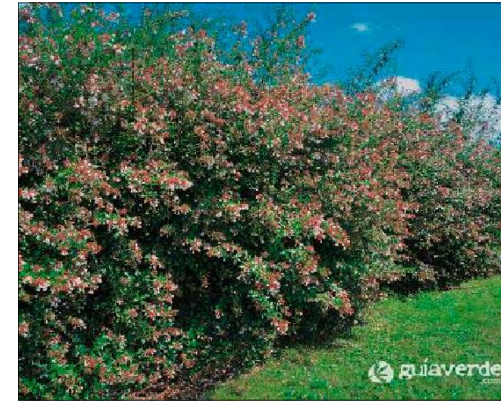
AG - Glossy Abelia