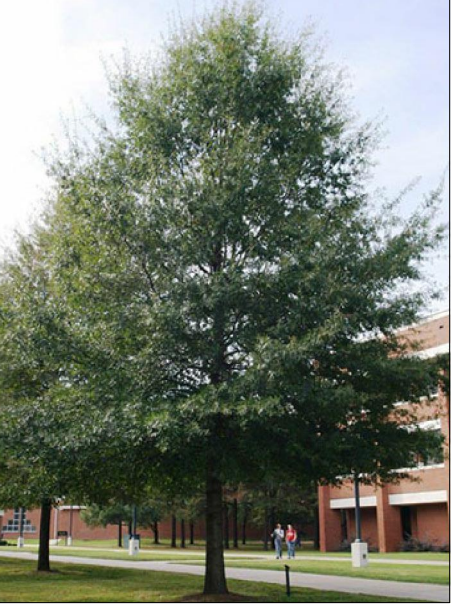
QP - Willow Oak