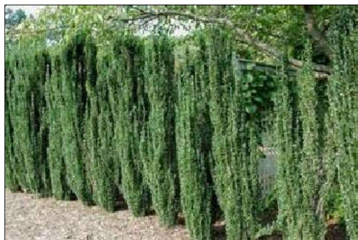
Sky - Sky Pencil Holly