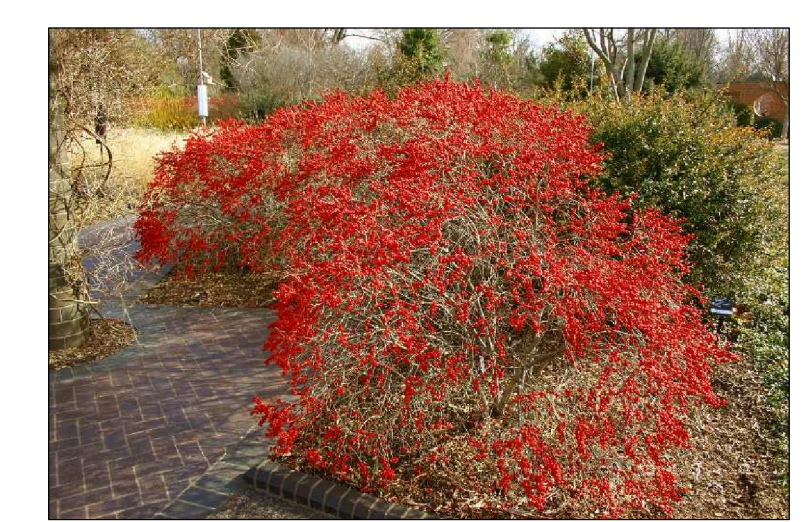
Irs - Red Sprite Holly