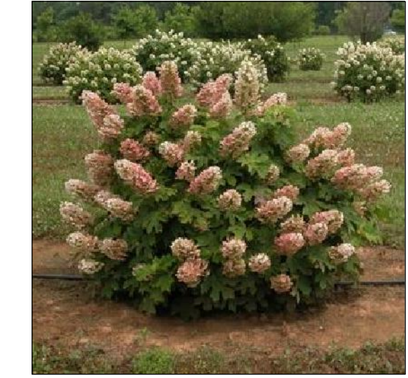
Hsd - Sikes Dwarf Hydrangea