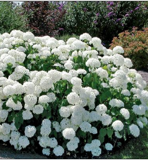
HA - Anna Belle Hydrangea