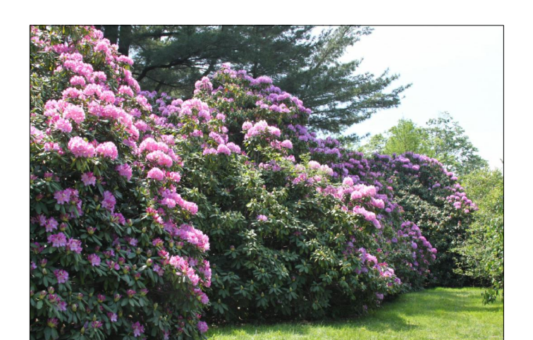
RC - English Roseum Rhodo