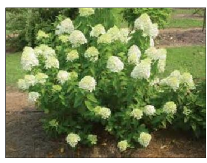
HLL - Little Lime Hydrangea