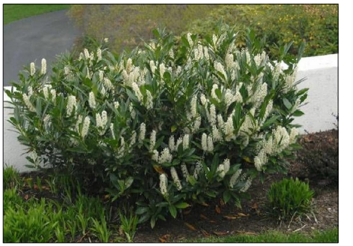
PLO - Otto Luyken Cherry Laurel