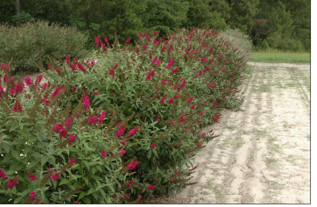
BD - Miss Molly Butterfly Bush