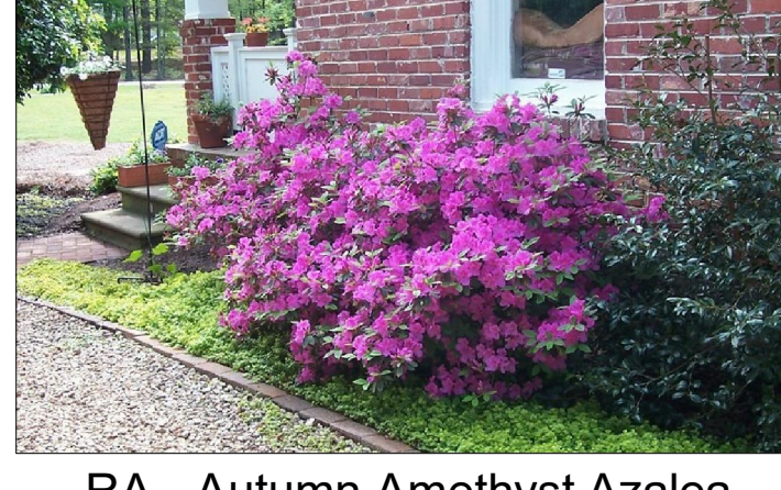
RA - Autumn Amethyst Azalea