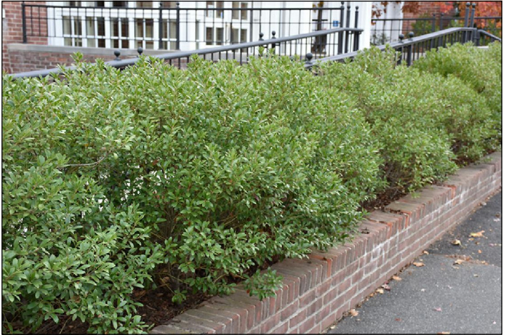
IGS - Shamrock Inkberry Holly