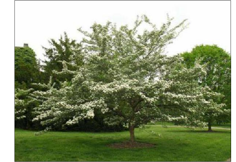
Cwk - Winter King Hawthorn