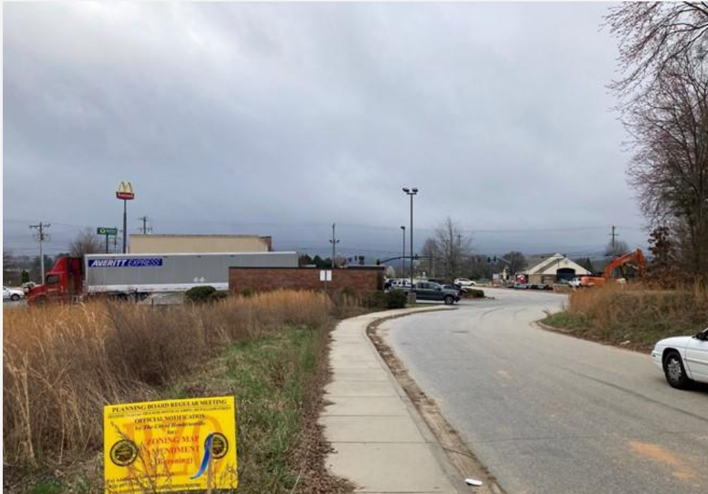
Access to the site along Upward Crossing Dr. Facing south towards Upward Rd