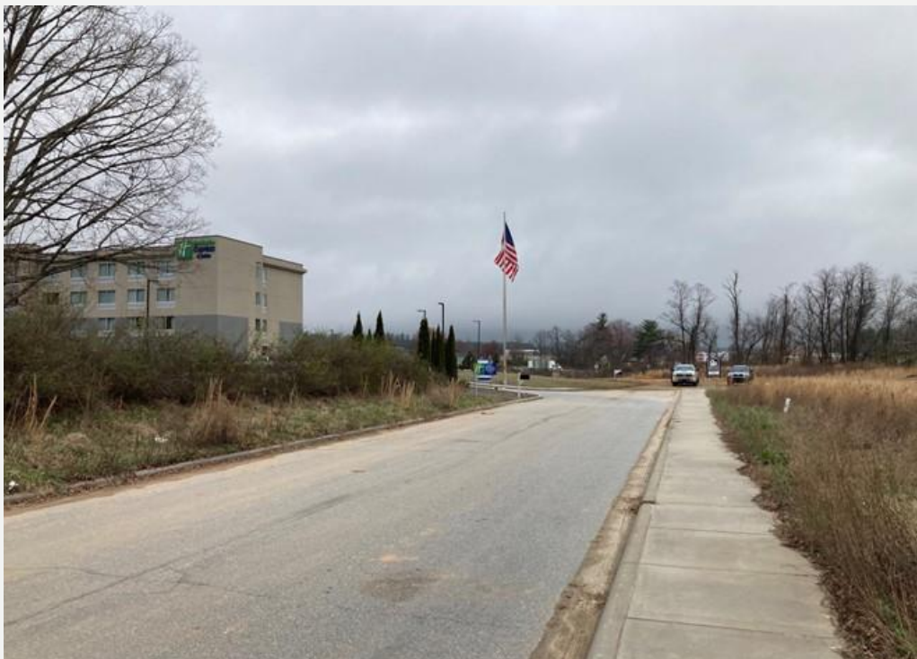
Access to the site along Upward Crossing Dr. Facing north towards future connection/access to Waterleaf Apartments