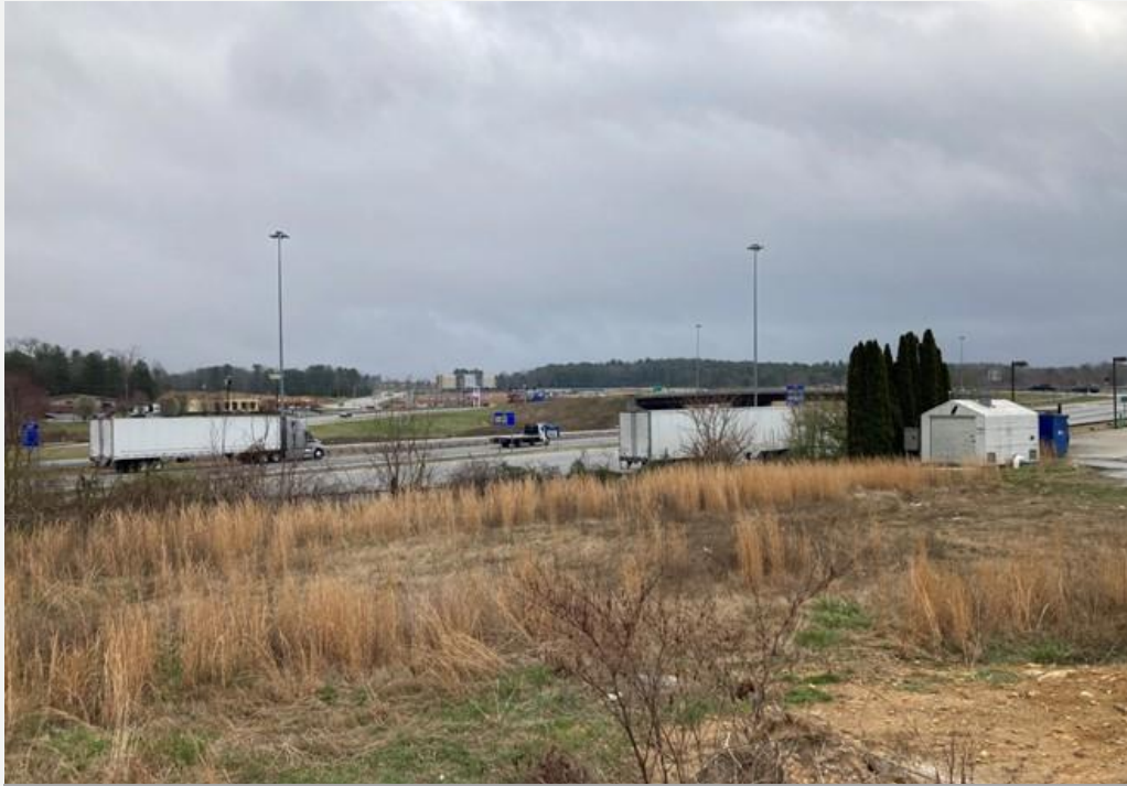
View of I-26 / Upward Rd from eastern edge of boundary