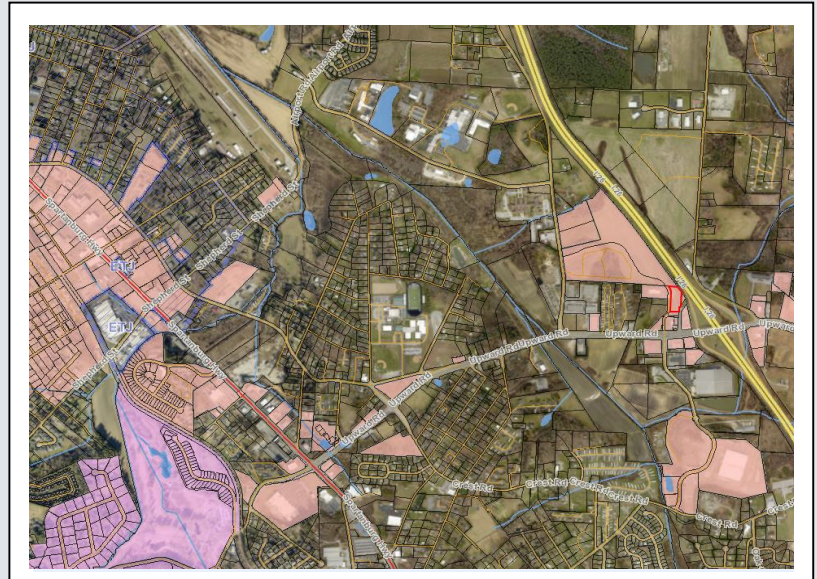
SITE VICINITY MAP

The City of Hendersonville is in receipt of an application for preliminary site plan review from Satis Patel of Upward Road Hospitality, LLC. The applicant is proposing to construct a 45,797 square foot, 95 room hotel on the subject property.