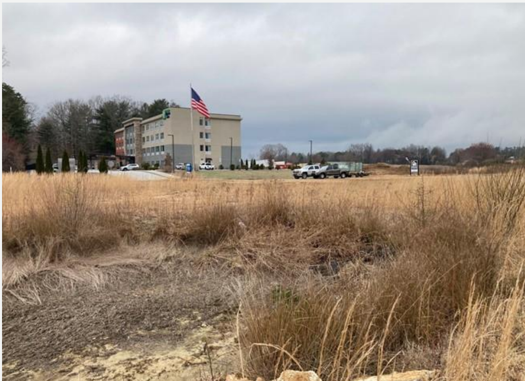
View of site facing west towards Upward Crossing. Existing Holiday Inn Express in background.