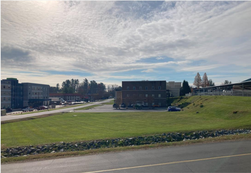
View of subject property from northern boundary facing south. Home 2 Suites and Ramada are visible on the left.