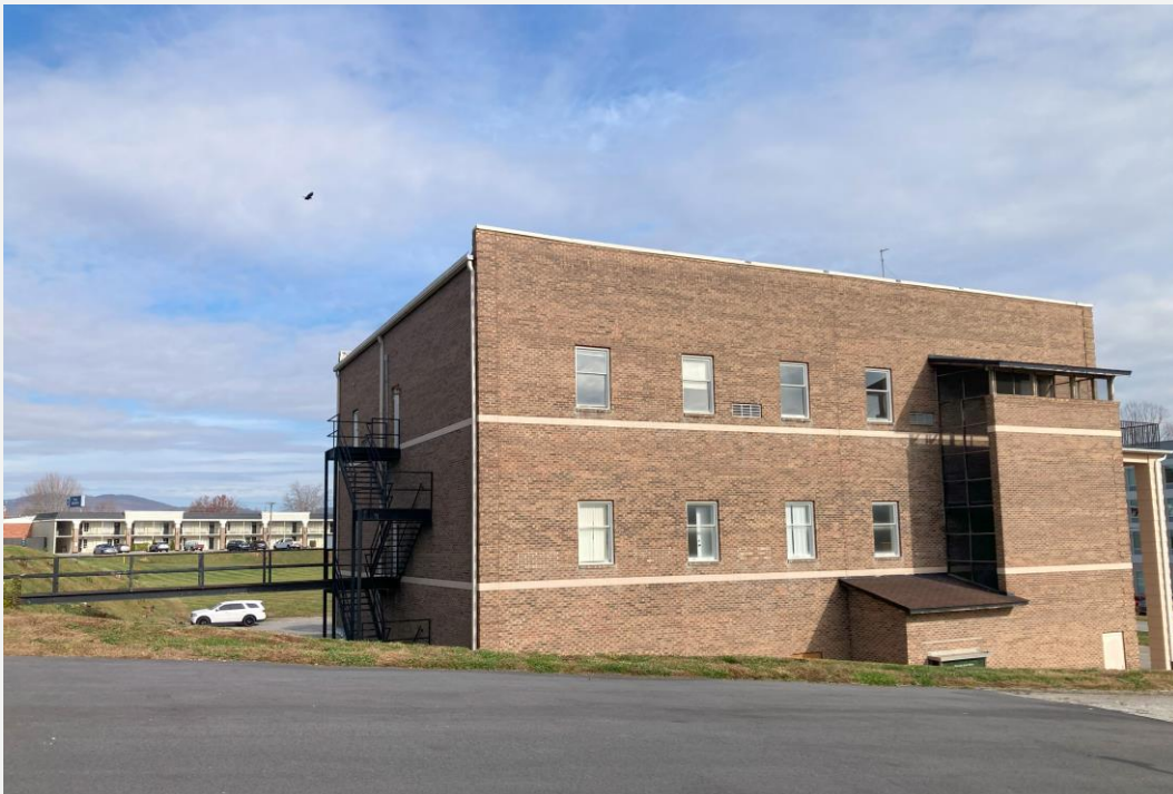
View of subject property from southern boundary facing north