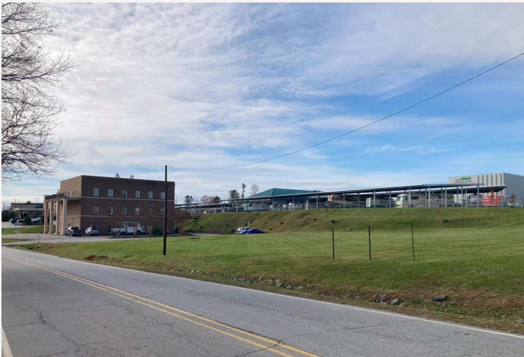
View of subject property from northeastern corner facing southwest. SafeNest RV storage is in the background.