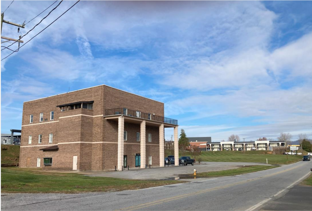
View of subject property from southeastern corner facing northeast. Best Western is in the background.