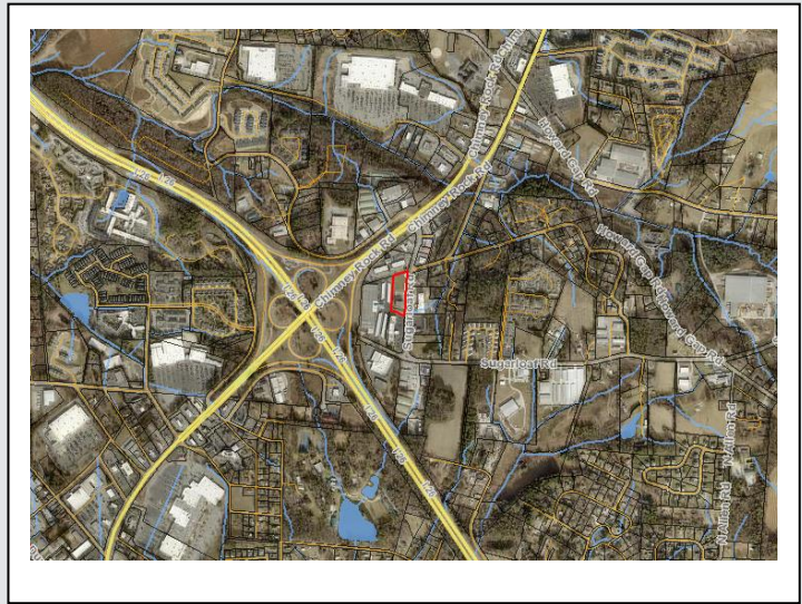
SITE VICINITY MAP

The City of Hendersonville is in receipt of a Zoning Map Amendment application from Daniel Renckens of WOC SE Storage, LLC (owners) for 135 Sugarloaf Rd (PIN: 9579-57-4046) totaling 1.96 Acres located near Chimney Rock Rd (US64) and I-26. The property is currently zoned C-3 CZD, Highway Business Conditional Zoning District. The petitioner is requesting that the property be rezoned to base zoning of CHMU, Commercial Highway Mixed Use.