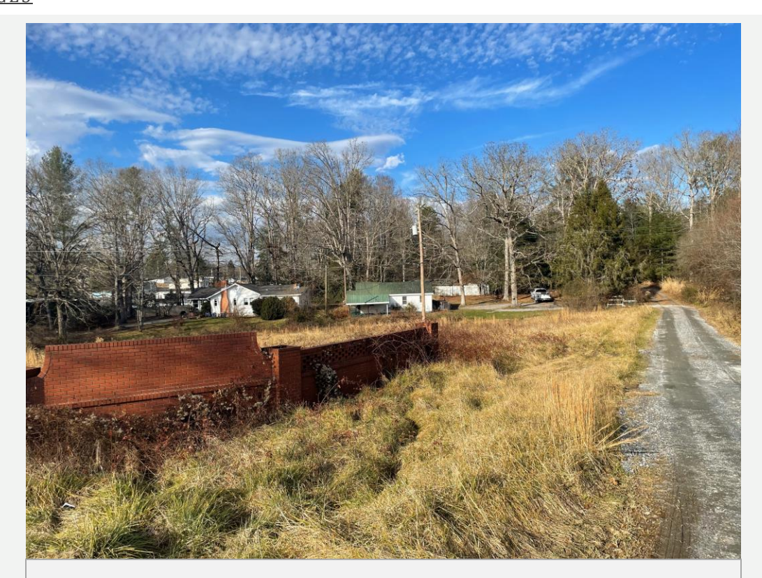
View of the subject property from Old Sunset Hill Road