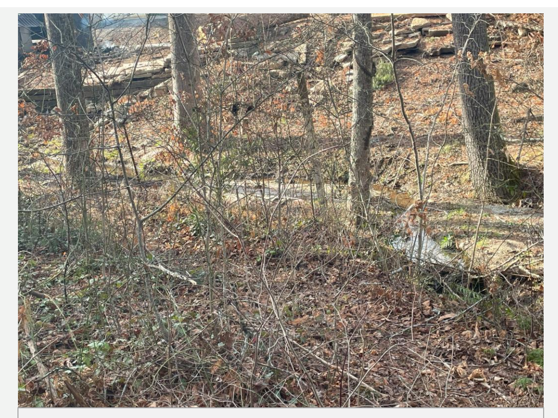
View of the stream that runs along the western portion of the property.