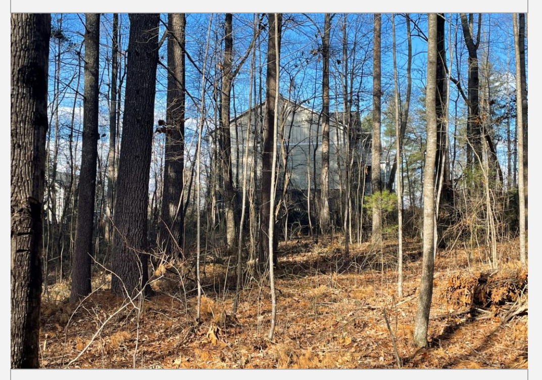
View from the subject property to the adjacent apartment development (Ballentyne Commons)