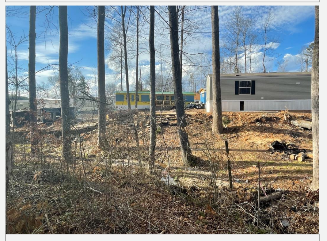
View of the adjacent mobile home park (Connor Creek).