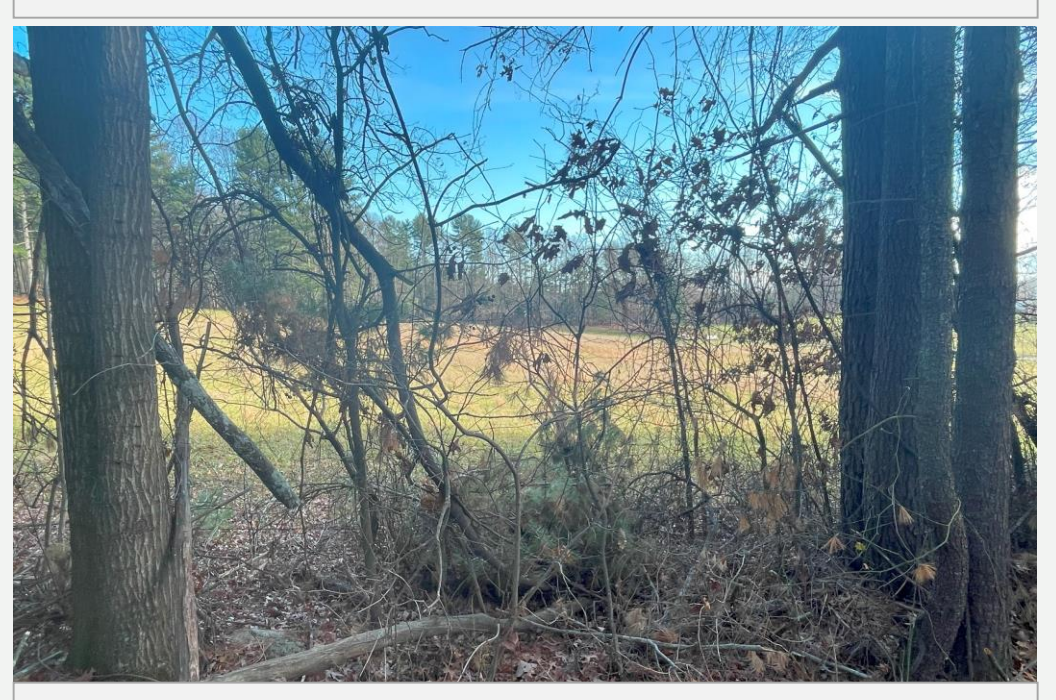
View of the largely underutilized land to the east of the subject property.