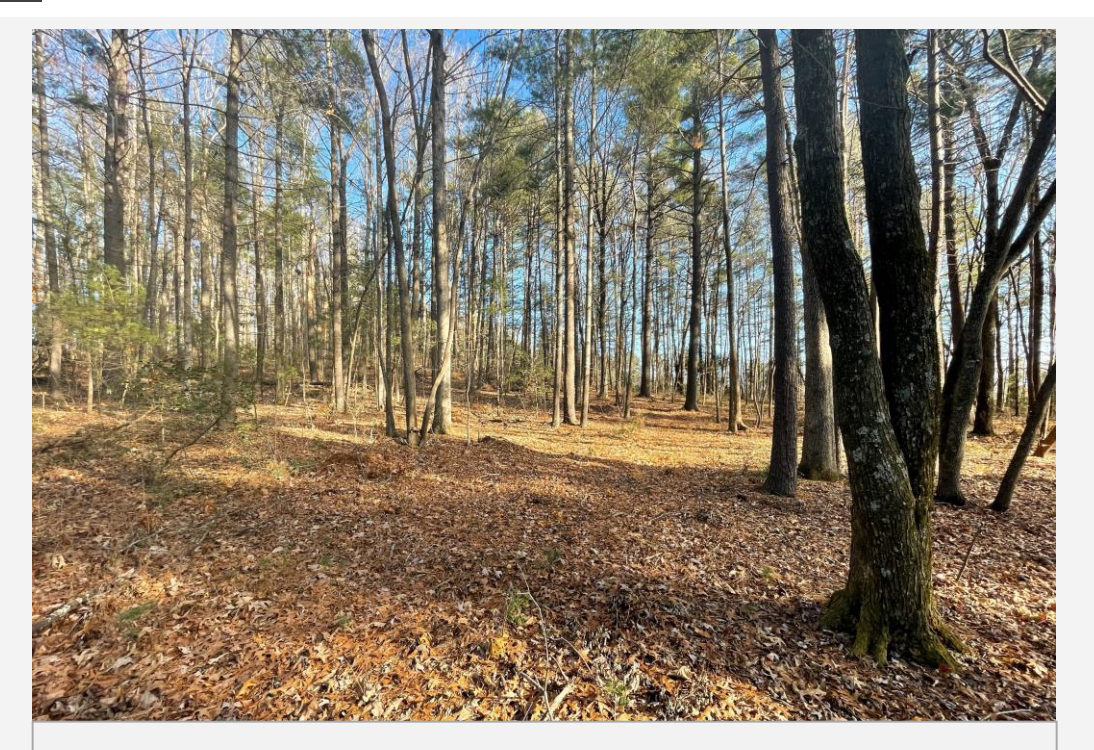
Typical view within the subject property.