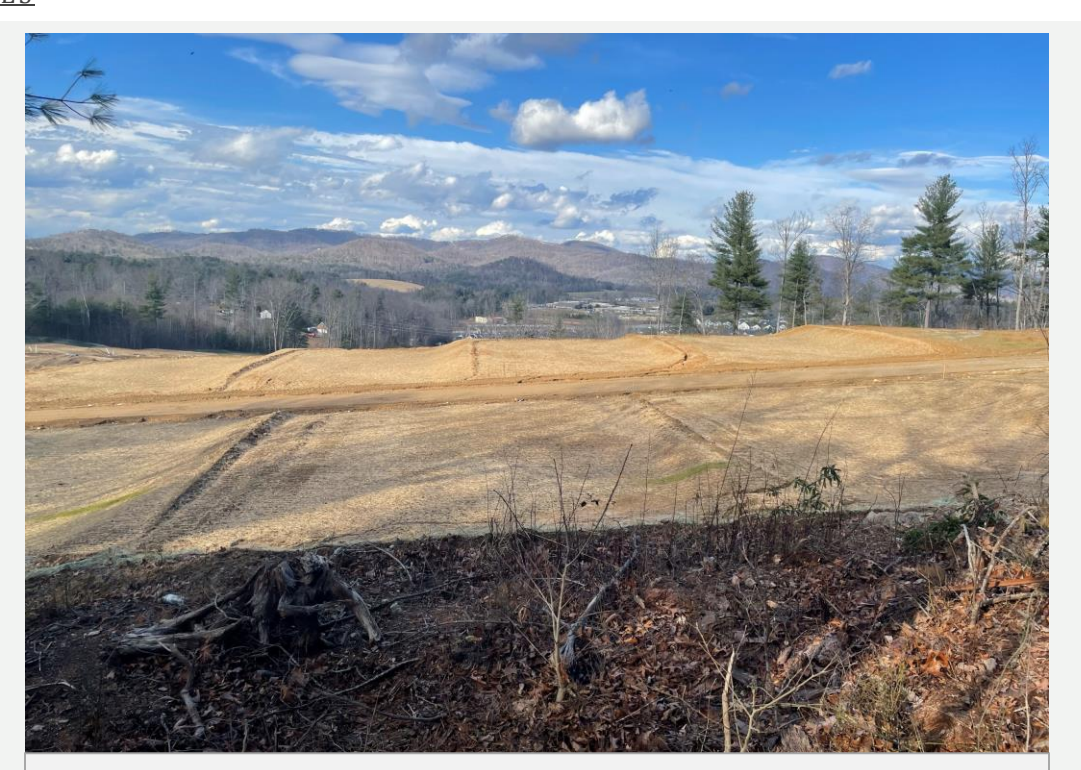
View of Half Moon Heights Phase I from the subject property.