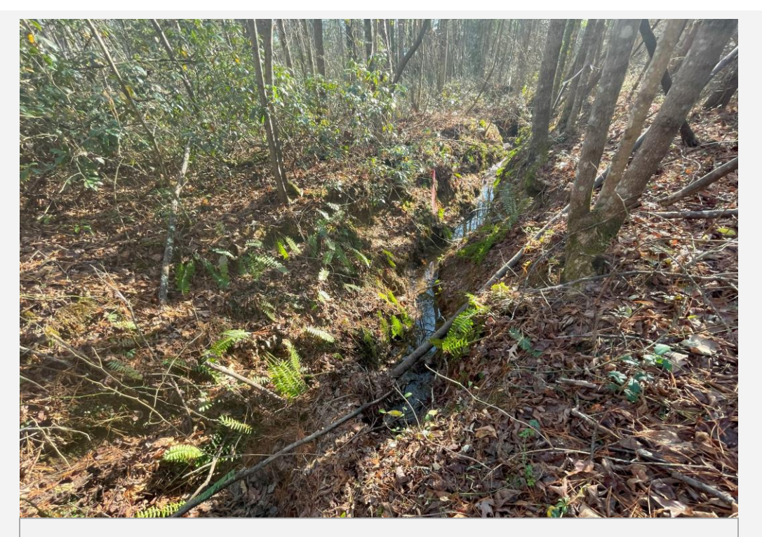
View of one of the streams that run through the subject property.