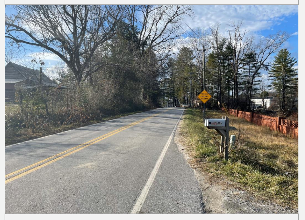
View of the subject property's Old Sunset Hill Road frontage