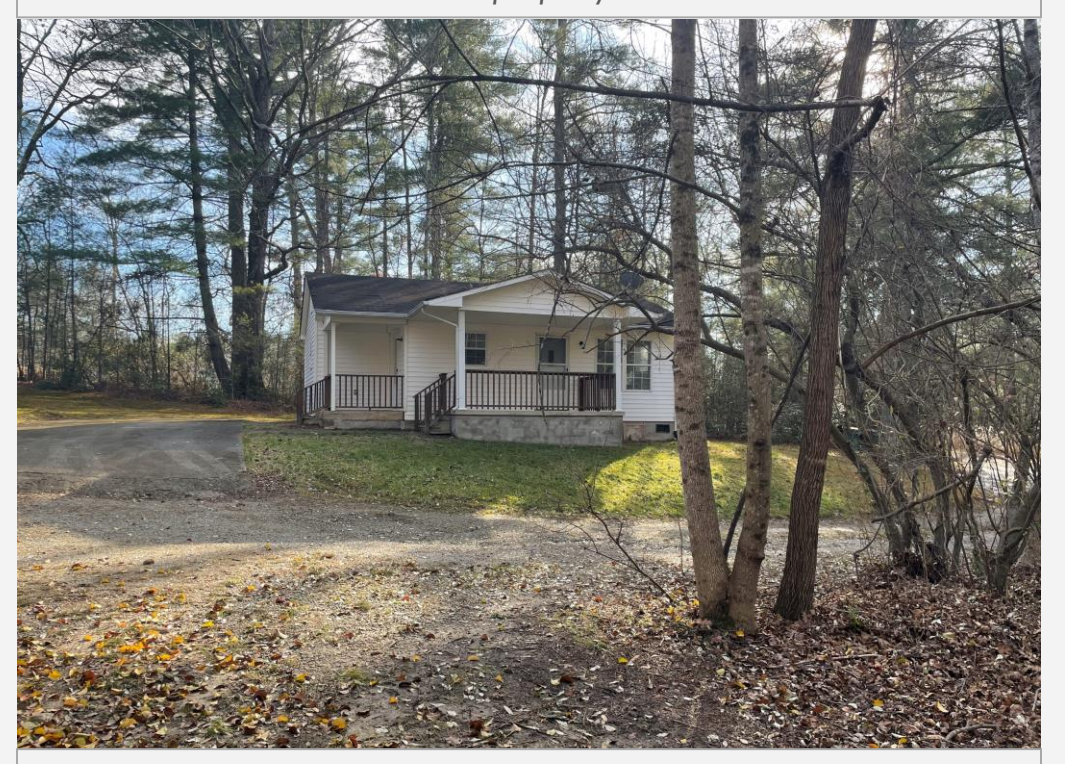
View of an existing house located on the subject property.