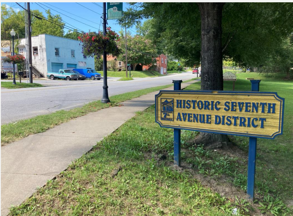
Far eastern edge of 7 th Ave MSD – two properties in background are under contract by the applicant