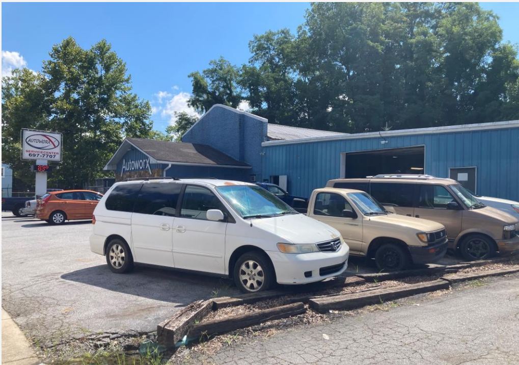
Existing Service Use in the MSD