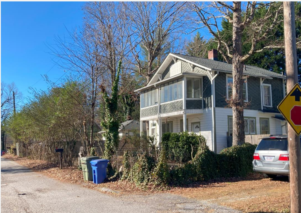
View of nearby property on Stewart St