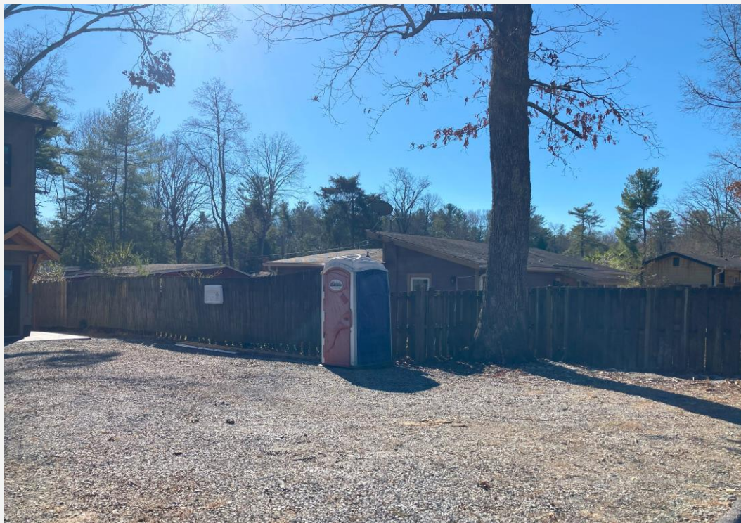
Neighboring Motel/Cottage Court to south