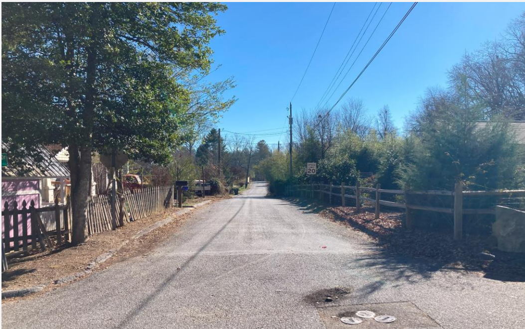
View along Southern Dr from Stewart St.