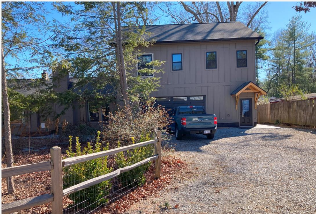
New Addition at Subject Property