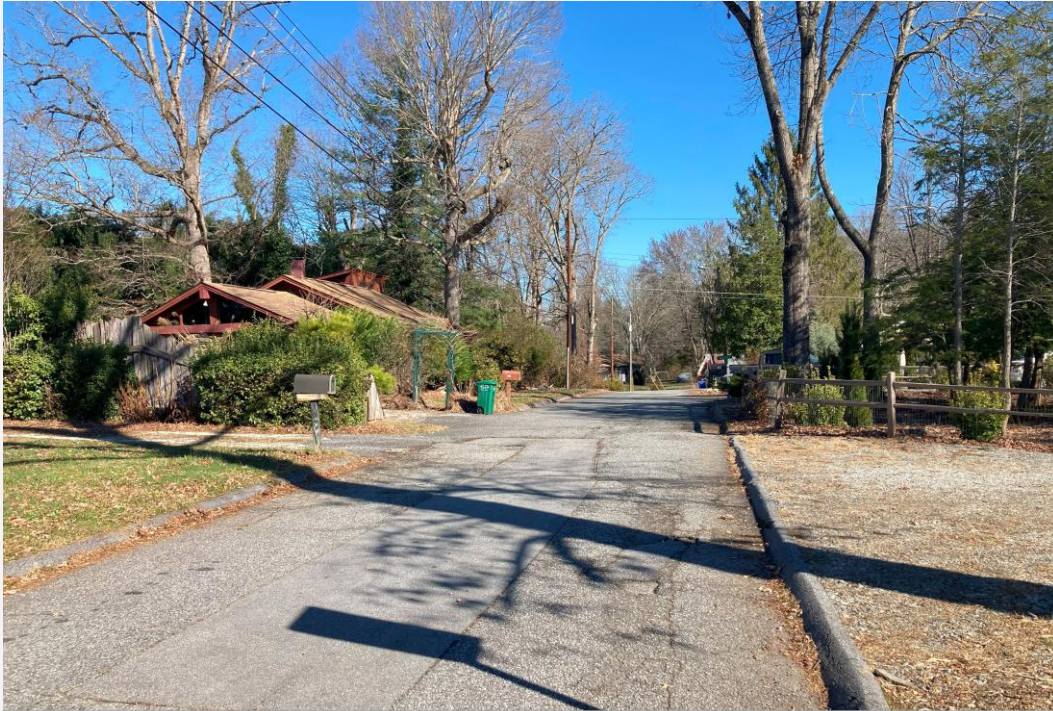
View along Stewart St towards Southern Dr