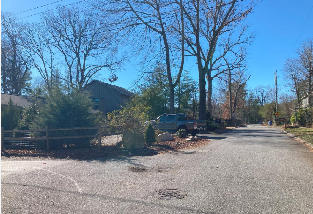
View along Stewart St from Southern Dr towards Greenville Hwy