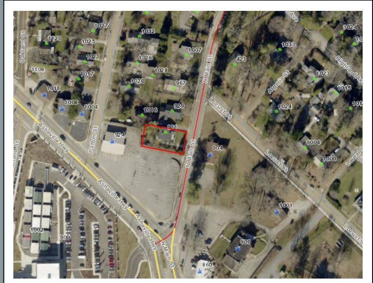
SITE VICINITY MAP

Project Type: Major Work (Replacement of Entry Door)