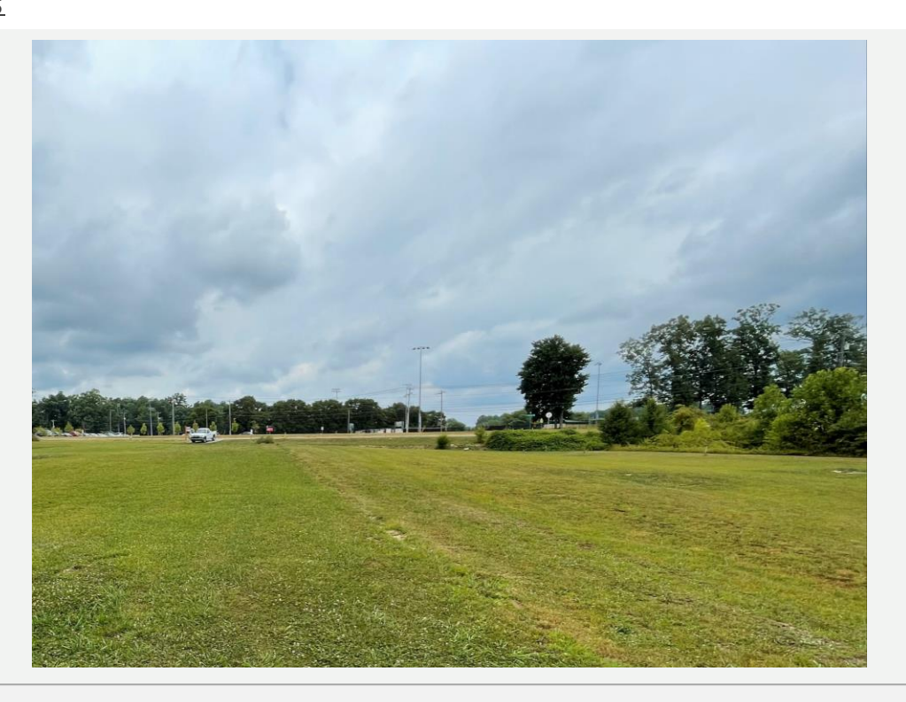
View of property looking toward Upward Road.