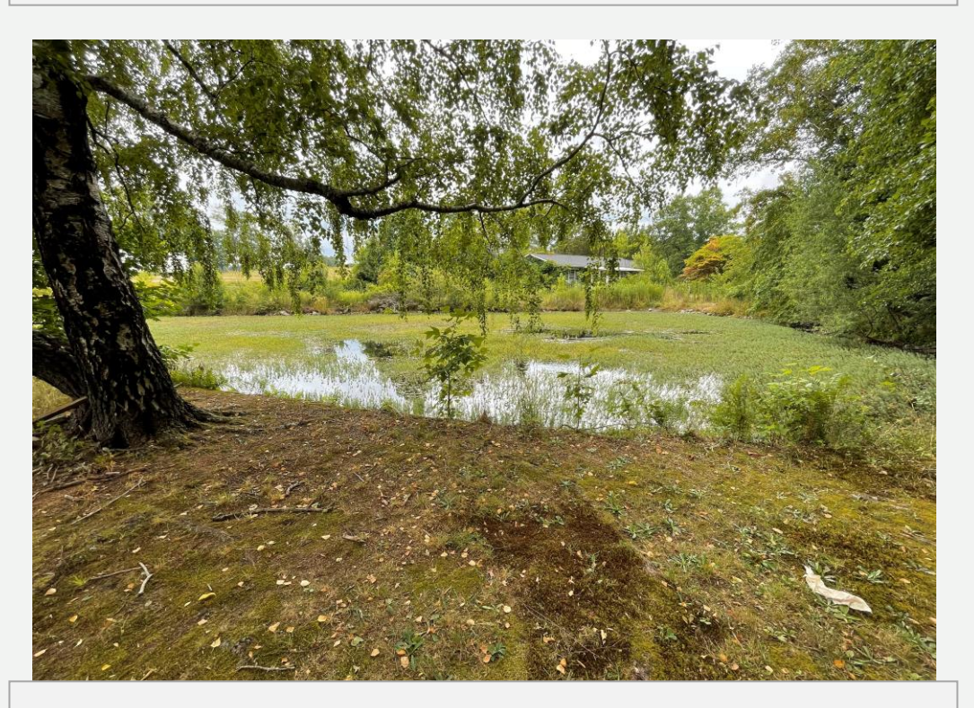
View of small pond that sits adjacent to property.