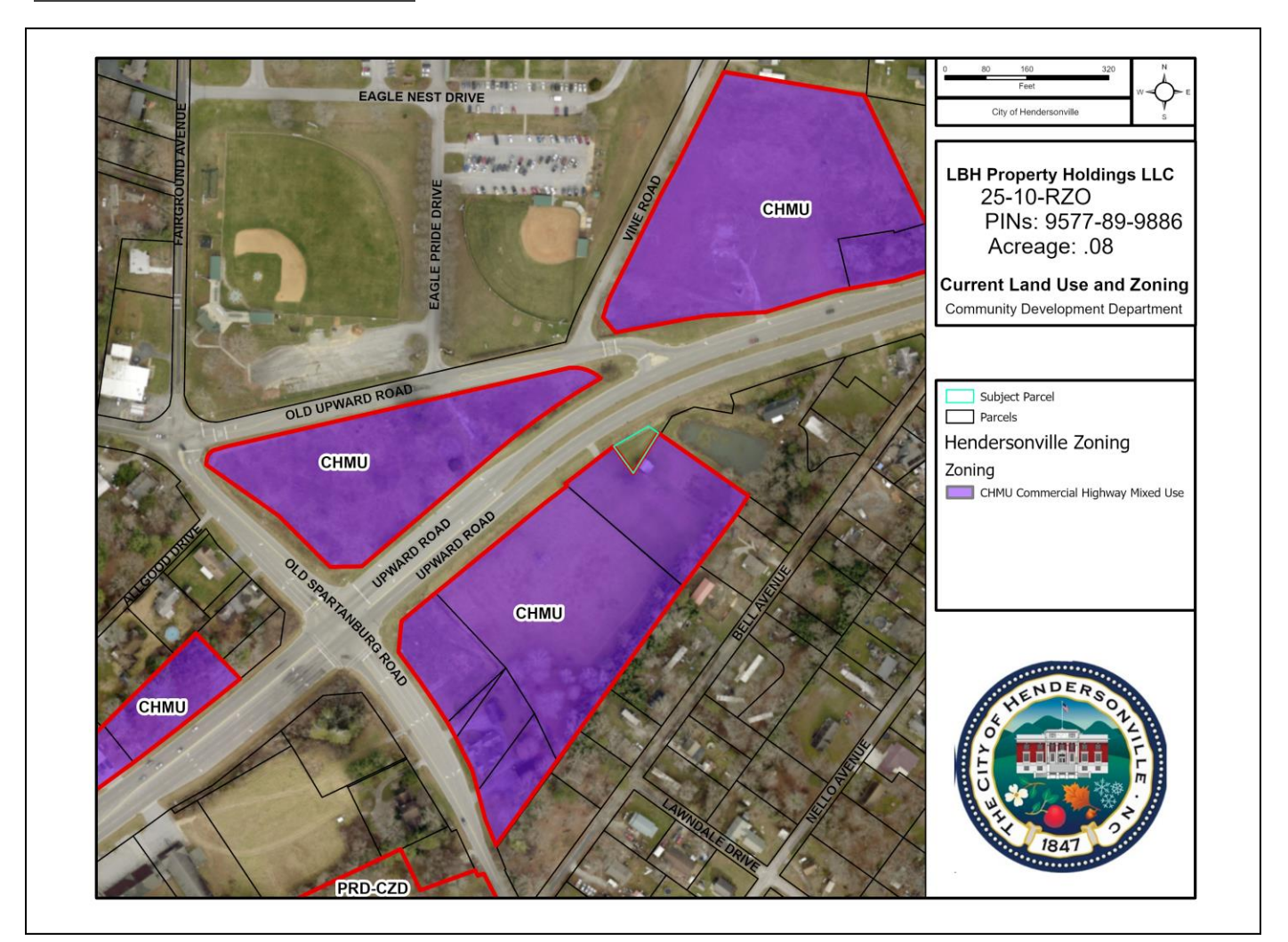
City of Hendersonville Current Zoning & Land Use Map

The subject property was recently annexed into the City. Previously the parcel was zoned Henderson County Community Commercial (CC). The adjacent parcels within city limits are all zoned Commercial Highway Mixed Use (CHMU). The City zoned uses within close proximately include a fast food restaurant, the future site of a religious institution, and the future site of a convenience store with gasoline sales.