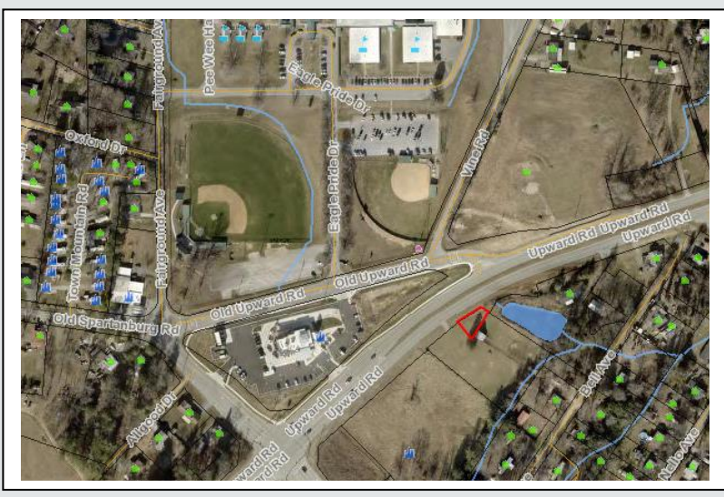
SITE VICINITY MAP

The City of Hendersonville approved an annexation petition from Lyndon Hill (property owners) for one parcel totaling .08 acres located along Upward Road. The applicant did not request zoning, therefore the City is initiating zoning. The County zoning remains in effect until municipal zoning is applied or a period of 60 days has elapsed after annexation. The City is proposing Central Highway Mixed Use as the proposed zoning district for this property. CHMU permits a range of commercial uses and residential uses (up to 12 units/acre) and includes design standards for all uses other than single-family and two-family (per State Statute). As a standard rezoning, all uses would be permitted if approved. In 2011, City planning staff brought forward a proposal for the creation of the Commercial Highway Mixed Use District. Additionally, City Council created the Upward Road Planning District in line with the City's sewer extension policy. A map of the Upward Road Planning District is attached in your packet.