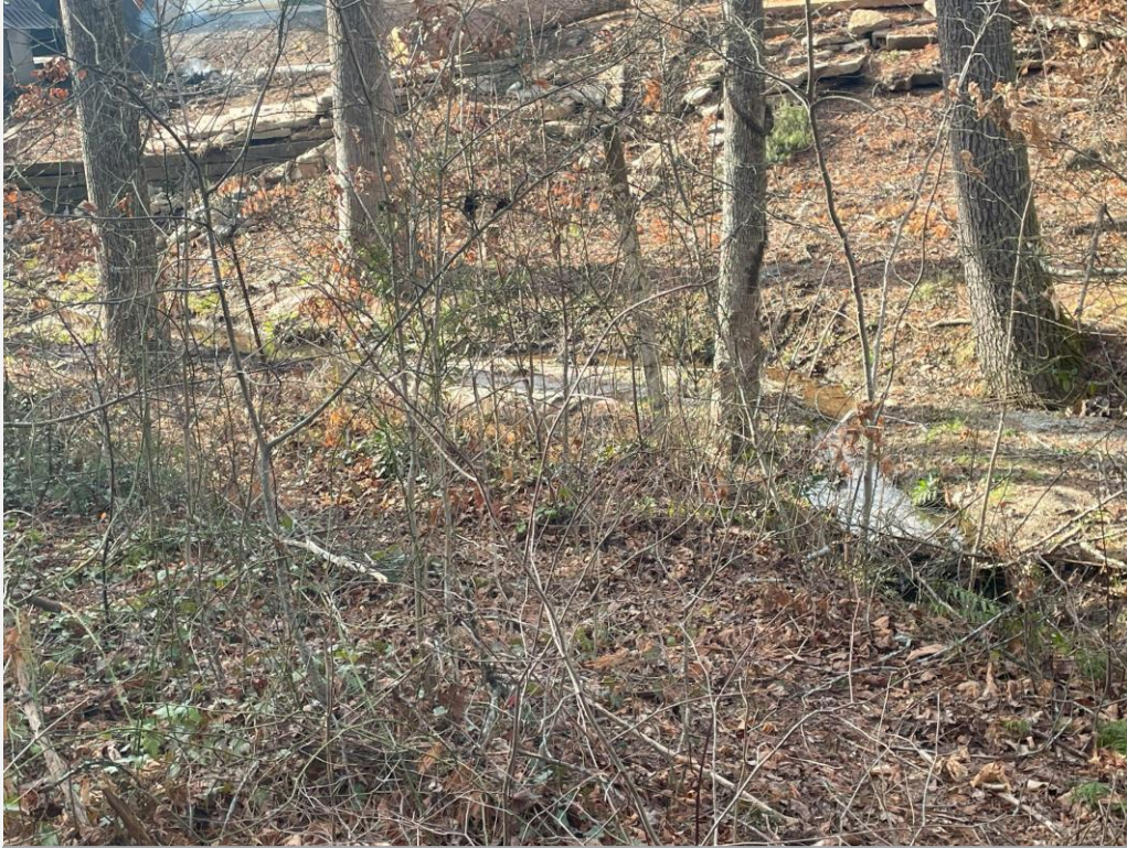
View of the stream that runs along the western portion of the property.