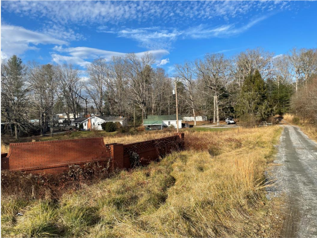
View of the subject property from Old Sunset Hill Road