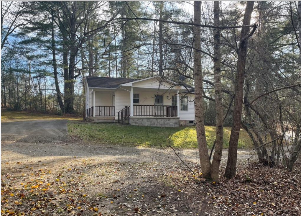
View of an existing house located on the subject property.