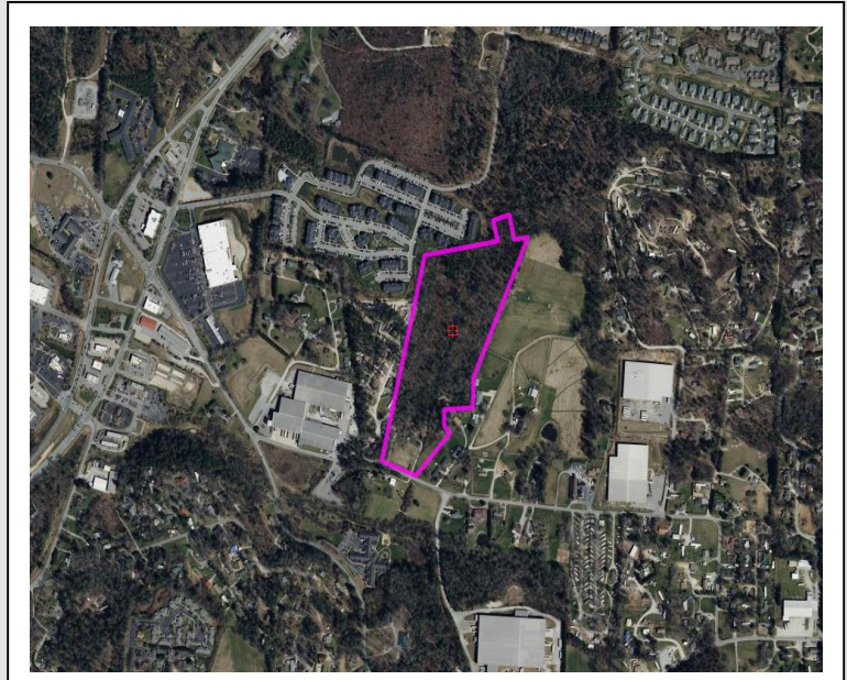
SITE VICINITY MAP