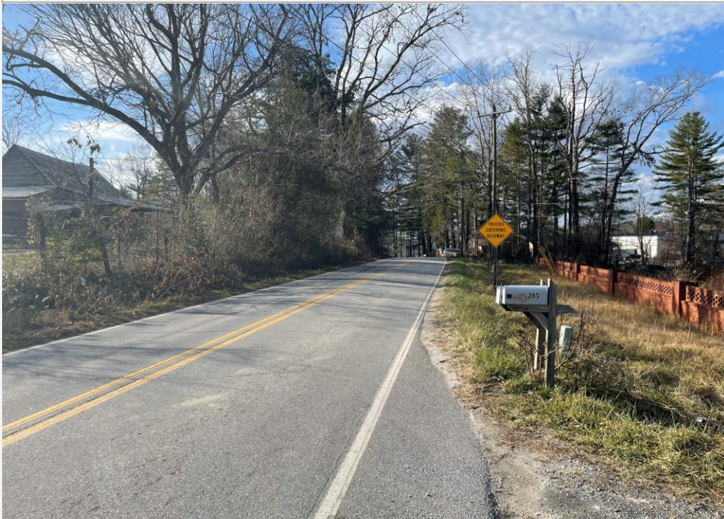
View of the subject property's Old Sunset Hill Road frontage