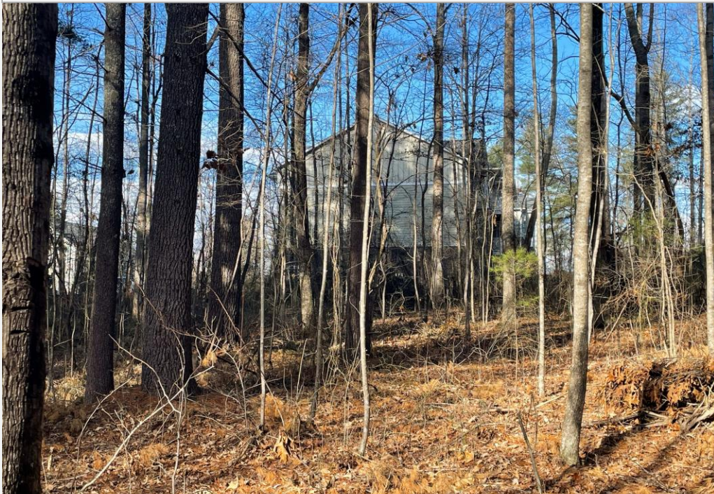
View from the subject property to the adjacent apartment development (Ballentyne Commons)