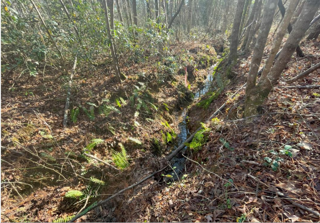
View of one of the streams that run through the subject property.