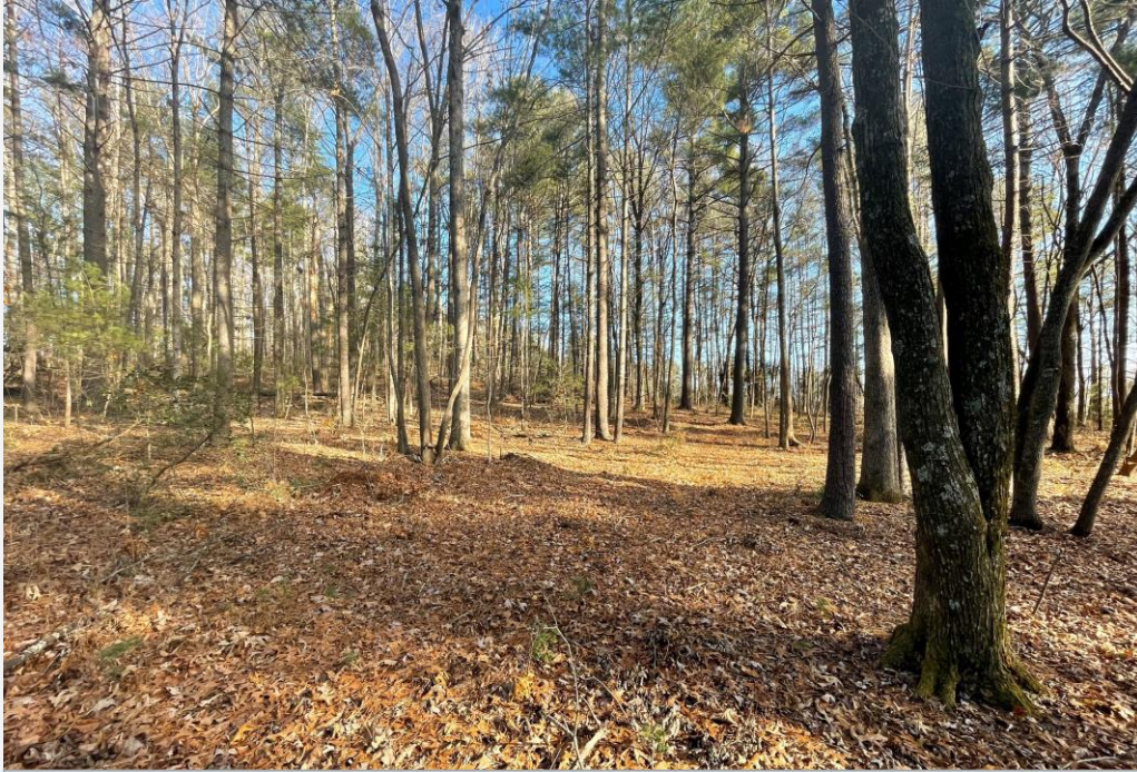
Typical view within the subject property.