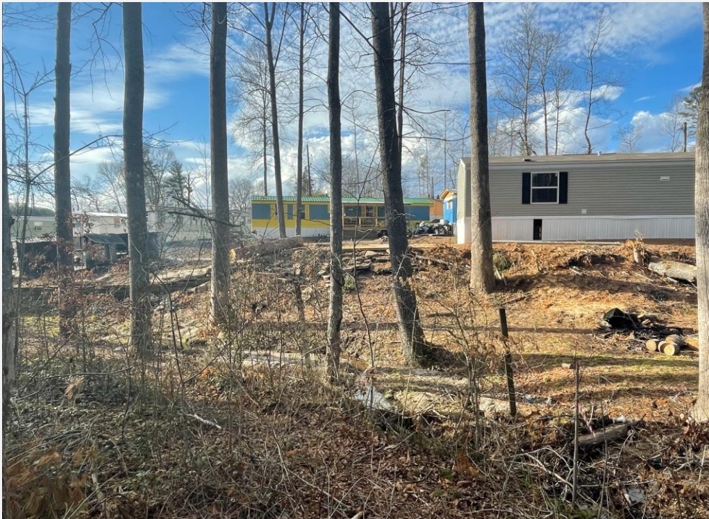
View of the adjacent mobile home park (Connor Creek).