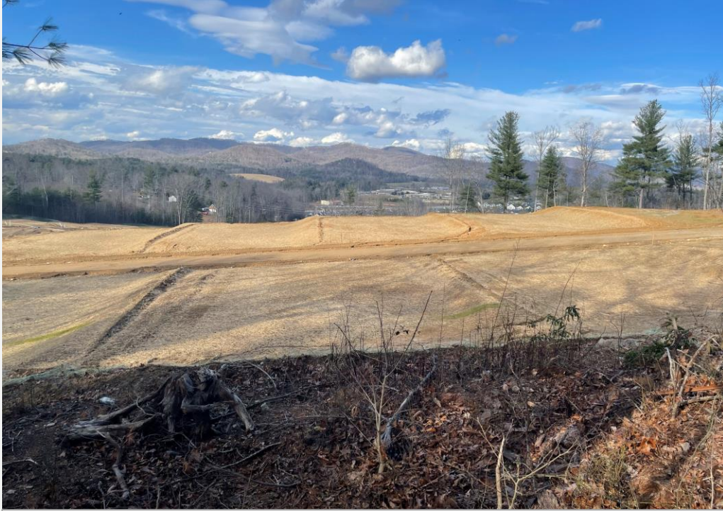
View of Half Moon Heights Phase I from the subject property.