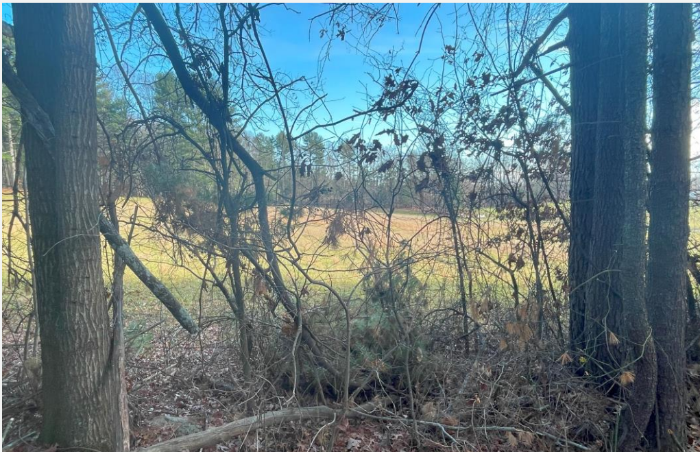
View of the largely underutilized land to the east of the subject property.