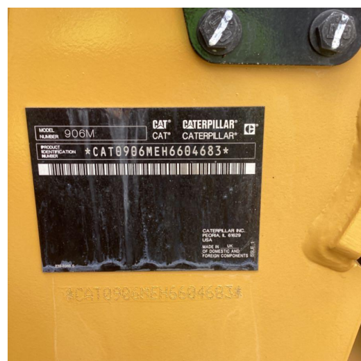
Serial Plate 1 of 1 06/14/2022 03:50:29 PM