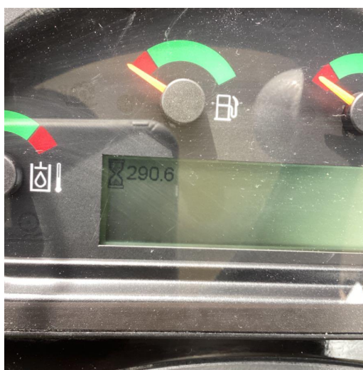
Hour Meter 1 of 1 06/14/2022 03:50:10 PM