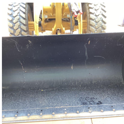
Attachments 1 of 1 06/14/2022 03:49:43 PM