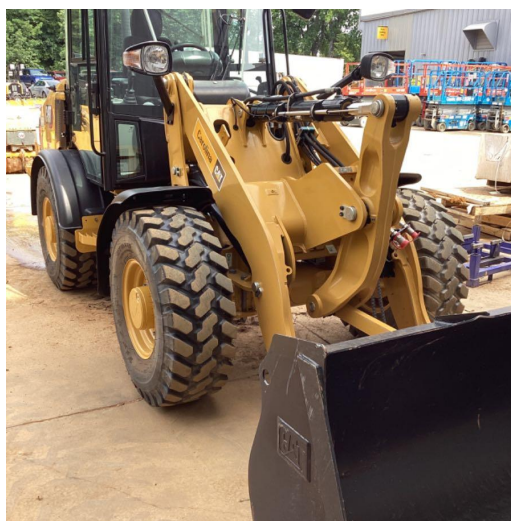
Front Right 1 of 1 06/14/2022 03:48:15 PM