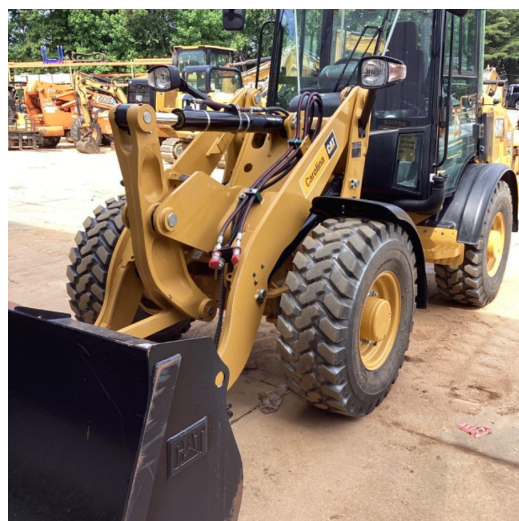
Front Left 1 of 1 06/14/2022 03:48:06 PM