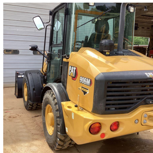
Back Left 1 of 1 06/14/2022 03:48:37 PM