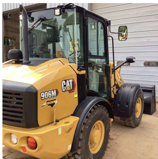
Back Right 1 of 1 06/14/2022 03:48:28 PM