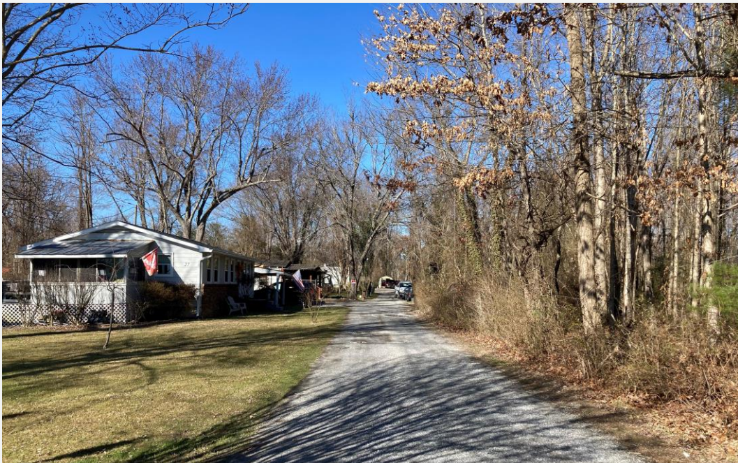
View of Amazing Grace Ln (private drive)