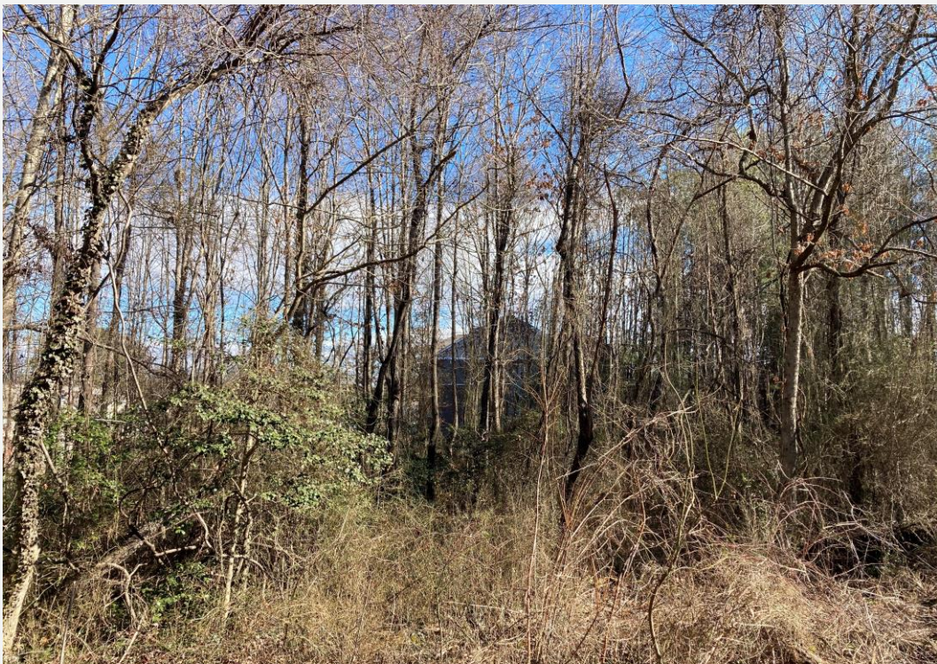
View of Signal Ridge Apts from Amazing Grace Ln.