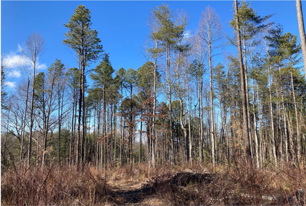
Typical view of existing conditions