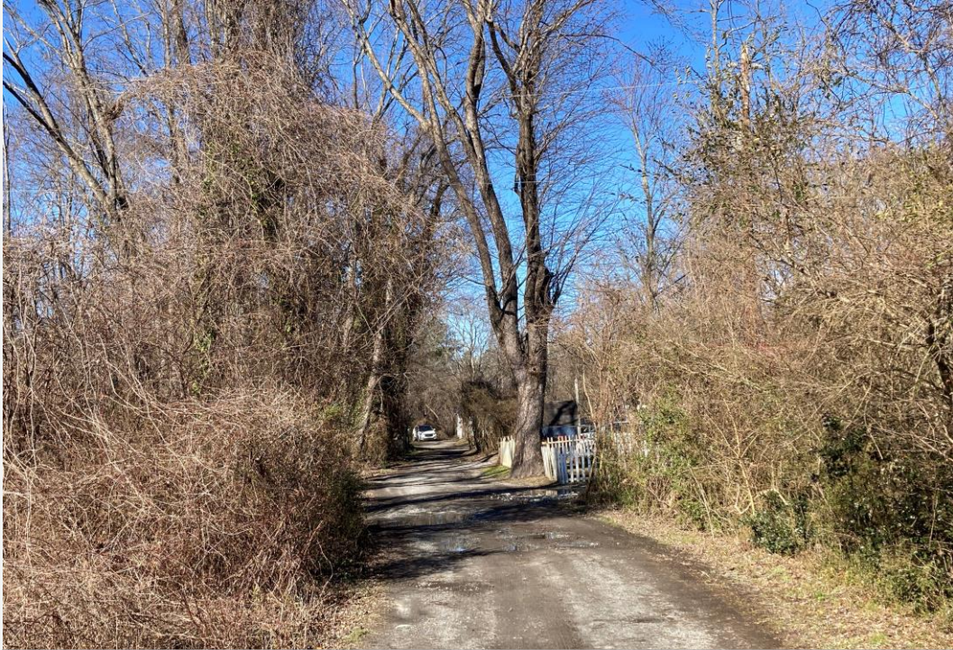
View of Lafolette St (private drive)