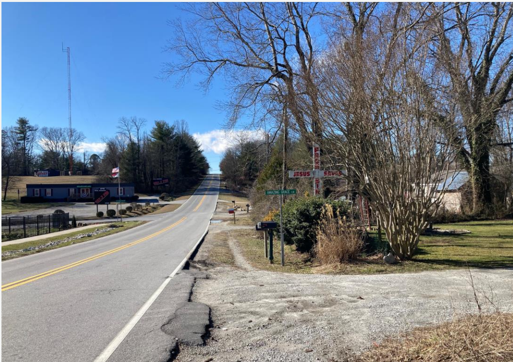
View of Signal Hill Rd facing west