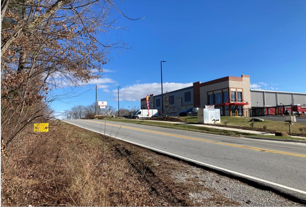
View along Signal Hill Rd facing east