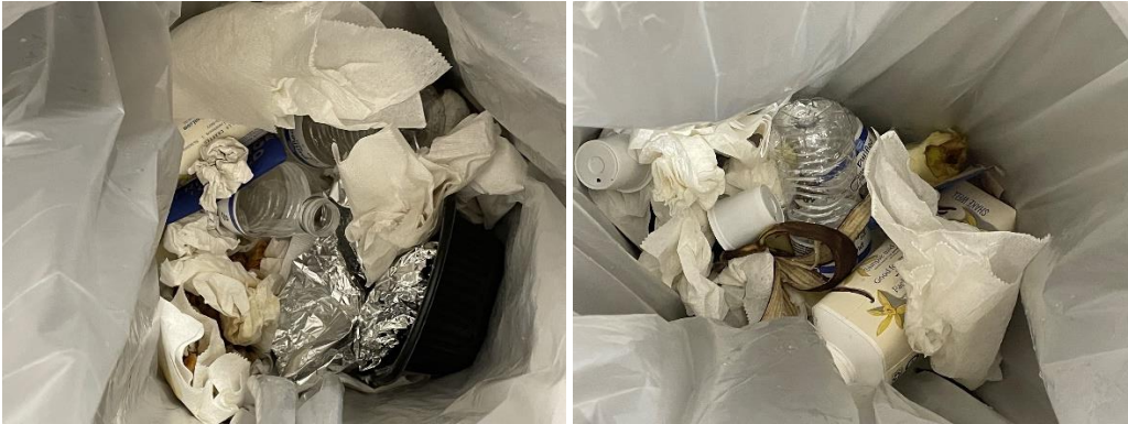
Kitchen breakroom (banana peel, to-go container, kcups, beverage containers, and napkins)

1 kitchen breakroom with multiple restrooms and individual trash and recycling bins.