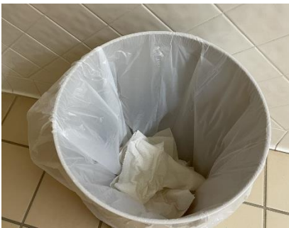
Restroom trash bin – usually chockfull of paper towels. This could easily be addressed by adding hand dryers in all the restrooms in City Ops. and City Hall