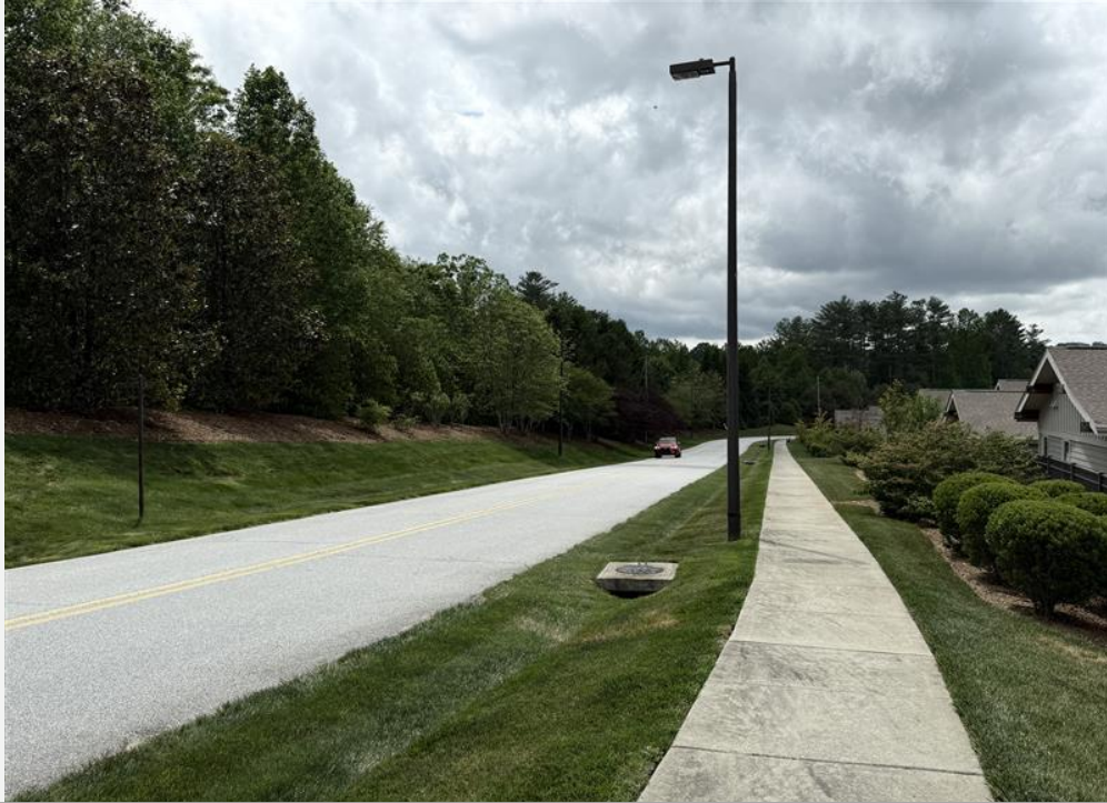
View west along Carolina Village Road. Subject property is located behind the trees to the left.