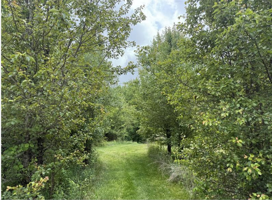
View of interior of subject property.