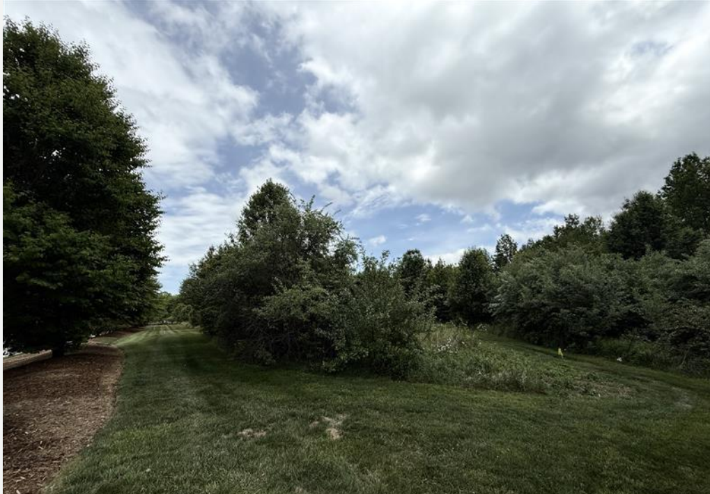
View of interior of subject property.