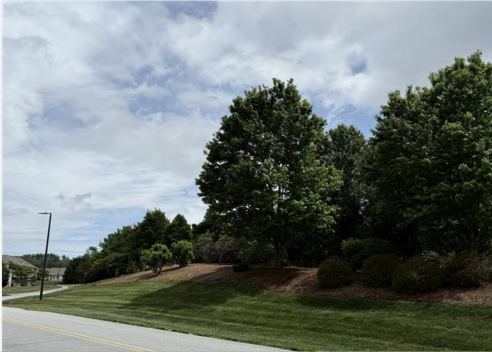
View of Subject property looking south across Carolina Village Road.