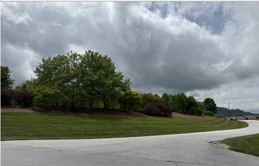
View of subject property looking south across Carolina Village Road.