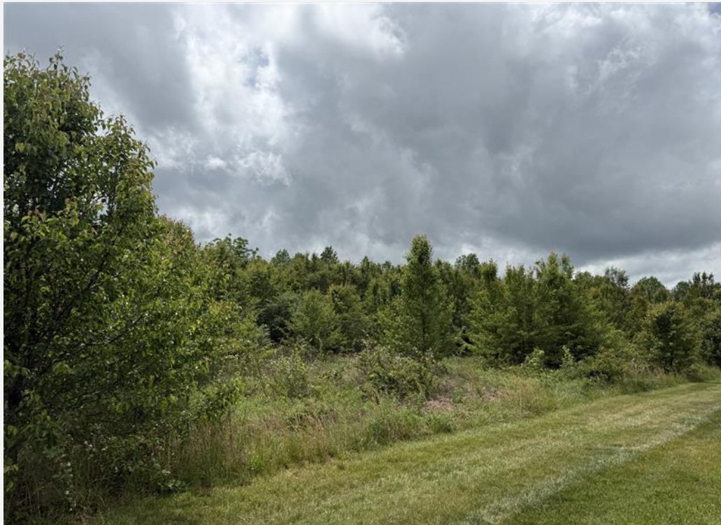
View of wooded portion of subject property.