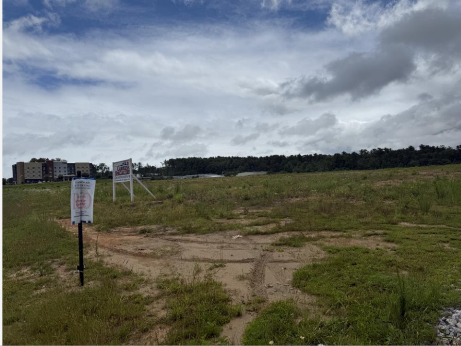
View of property looking east from Upward Road.