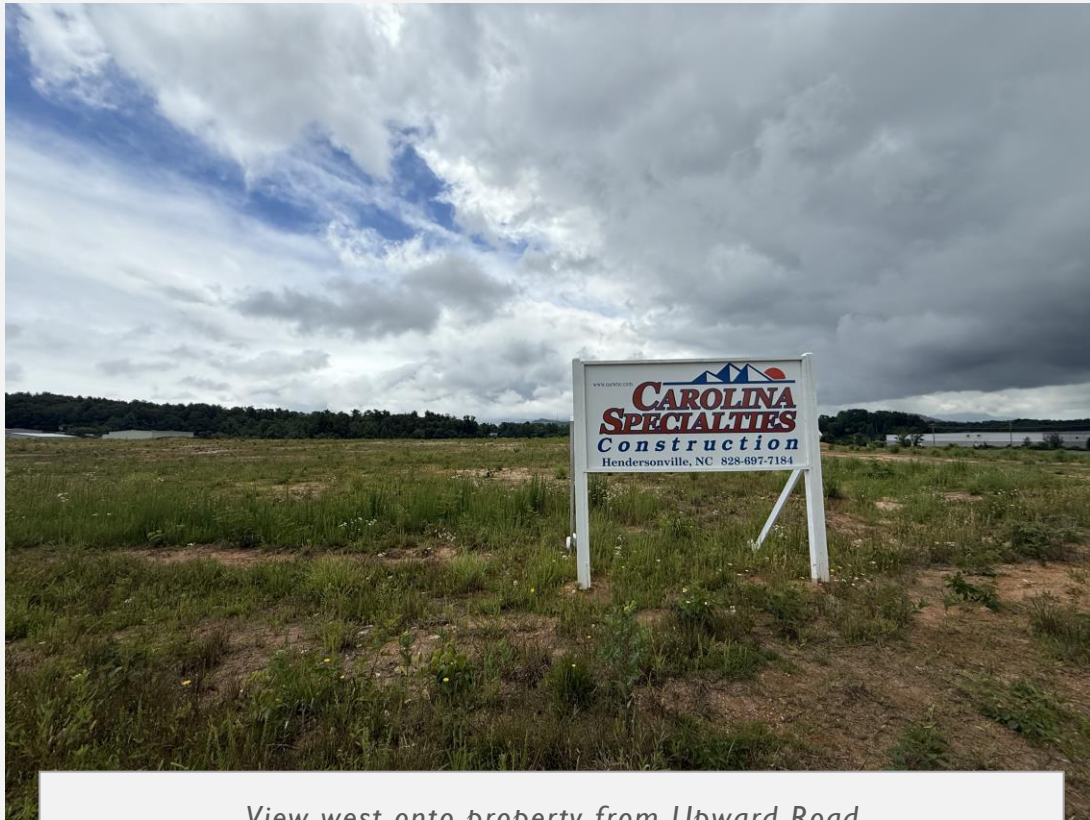
View west onto property from Upward Road.