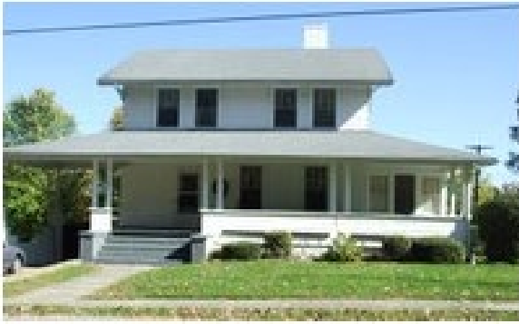
1304 Hyman Ave « Roy C. Bennett House »

Contributing, Colonial Revival style two-story house constructed ca. 1922. The house has a wraparound porch which has been partiall enclosed. The north side extends over the drive to create a carport. This does not show on the 1926 Sandborn map, but appears to be original. Wing added to rear. Side gable roof supported by knee braces. Walls are asbestos shingle, with aluminum siding in the soffits. Portions of brick foundation are stuccoed.