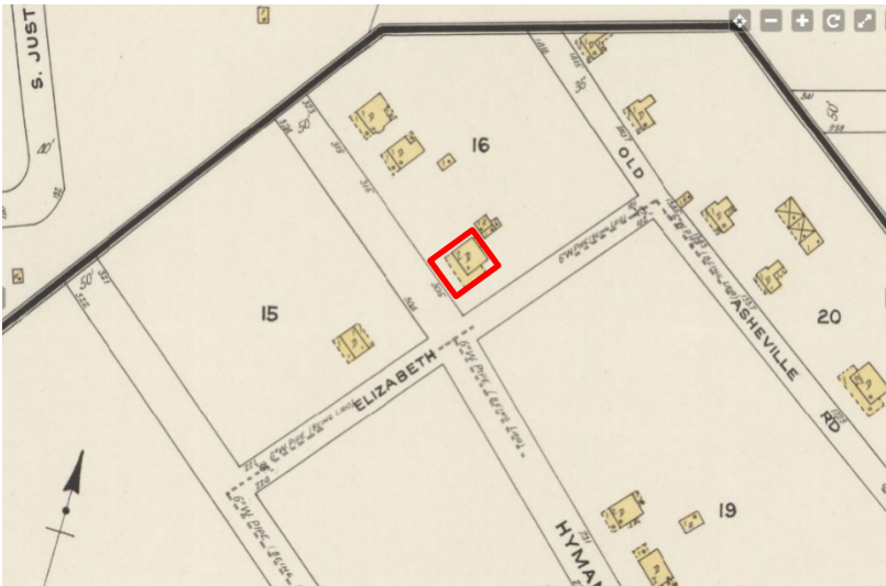
(1922 Sanborn Map)