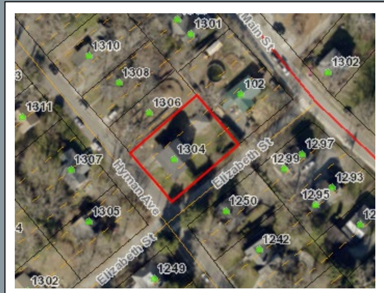
SITE VICINITY MAP

Project Type: Major Work (Replacement of Existing Windows)