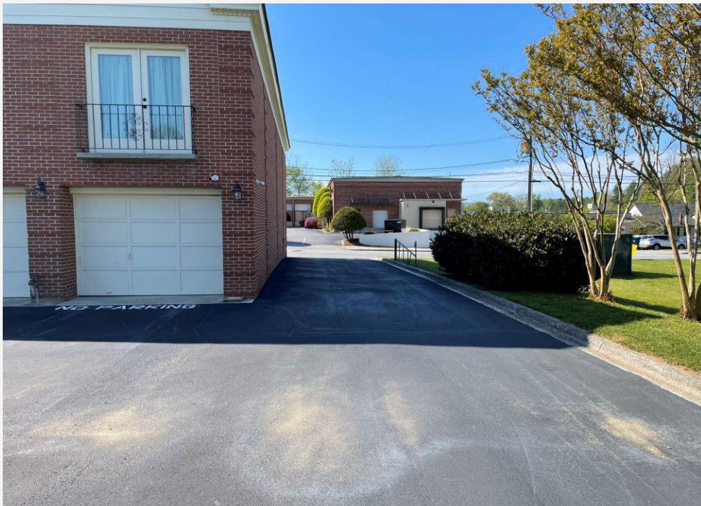
View of the existing rear access from W. Allen where the new parking lot will tie into.