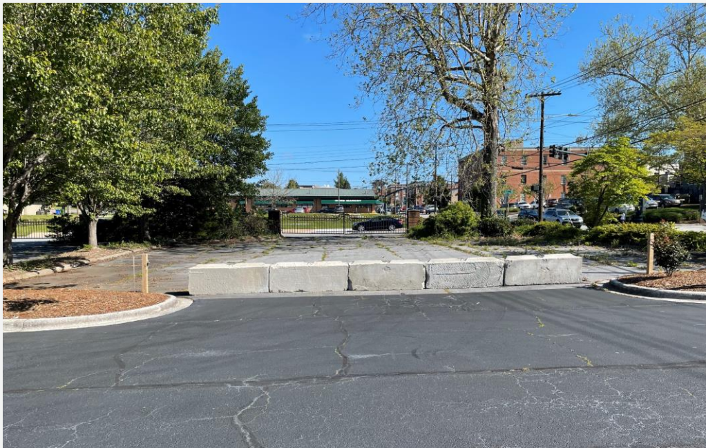
View of a vacant parking lot adjacent to the subject property. The two adjacent vacant parking lots are on separate parcels and are owned by a different individual. The current owner of these lots will not allow the funeral home to use these existing lots for funeral home parking.