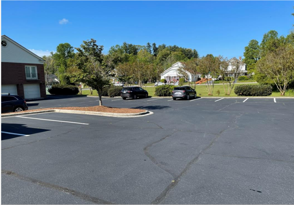
View of the existing parking area.