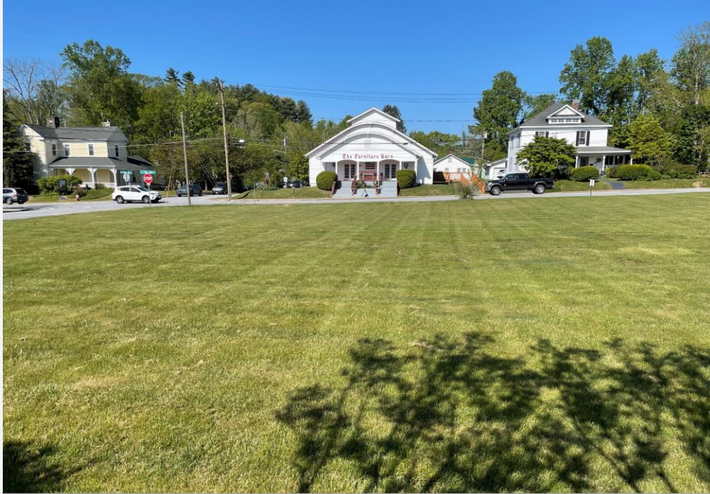
View of the vacant lot where the funeral home proposes to build their additional parking area.