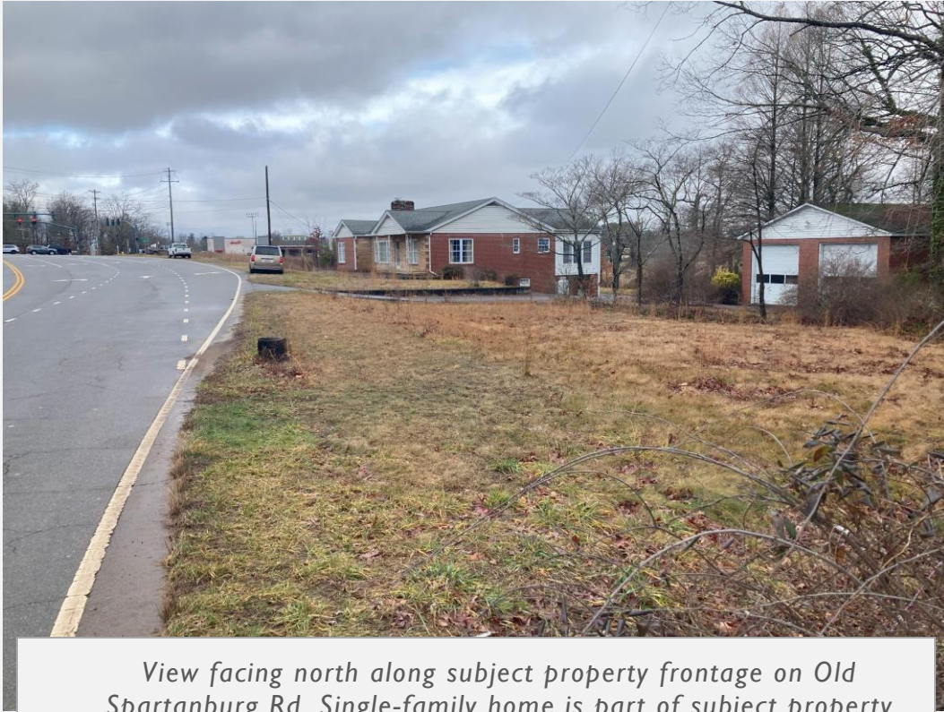
View facing north along subject property frontage on Old Spartanburg Rd. Single-family home is part of subject property