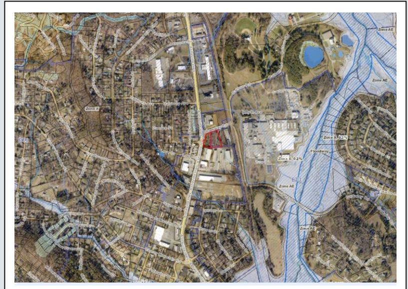
SITE VICINITY MAP

The City of Hendersonville is in receipt of an application for preliminary site plan review from Norman Hamilton of Site Design, Inc. [applicant] on behalf of Mitch Riese of The Spinx Company, LLC. [owner]. The applicant is proposing to construct a 6,470 sq ft convenience store building along with a 6,160 sq ft gas service canopy featuring 8 pumps (16 service stations). The site will accommodate 60 parking spaces.