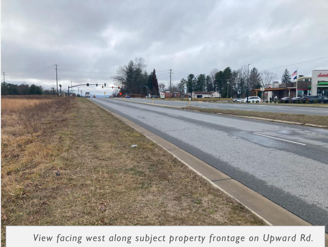
View facing west along subject property frontage on Upward Rd.