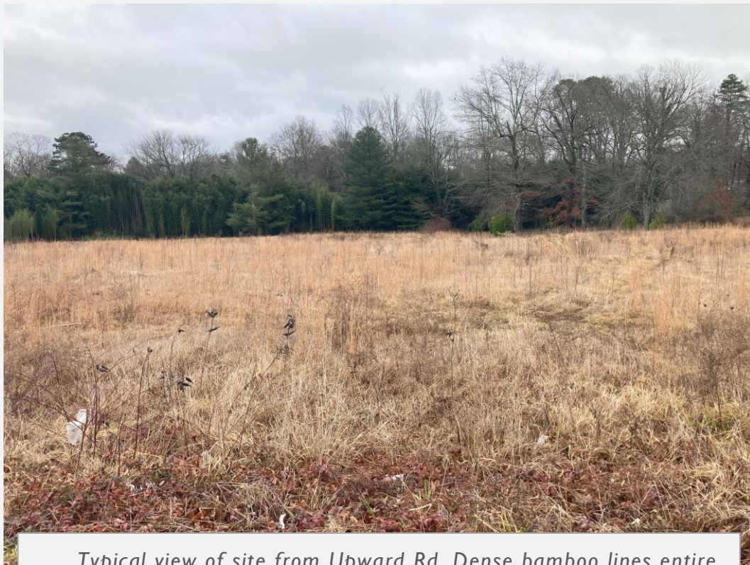
Typical view of site from Upward Rd. Dense bamboo lines entire rear boundary of site. Portion of tree grove on right side of photo to be preserved.