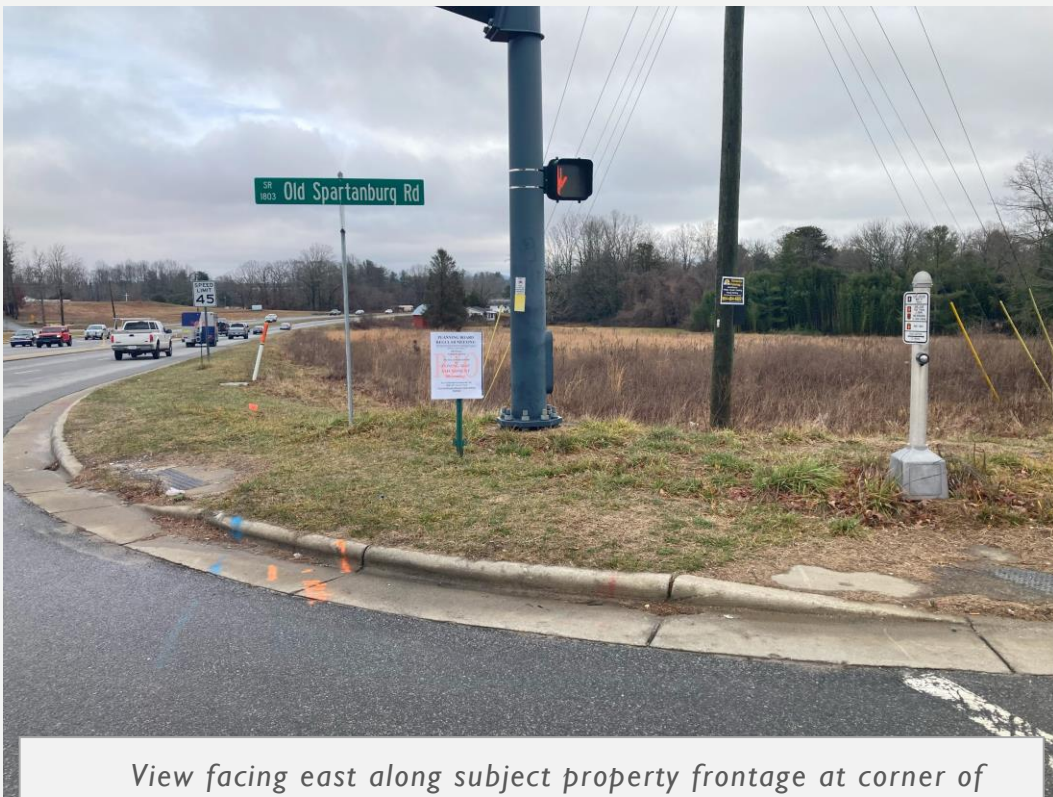
View facing east along subject property frontage at corner of Upward Rd. & Old Spartanburg Rd