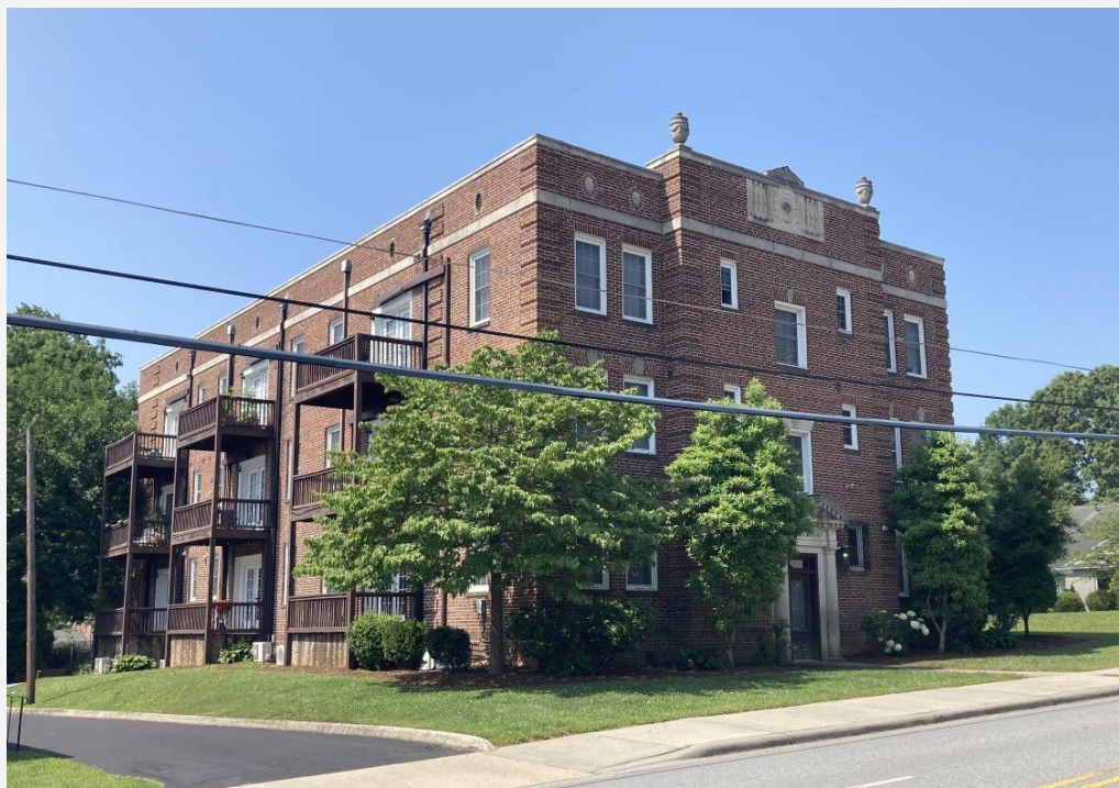
Traditional multi-family with 15' setback in the MIC