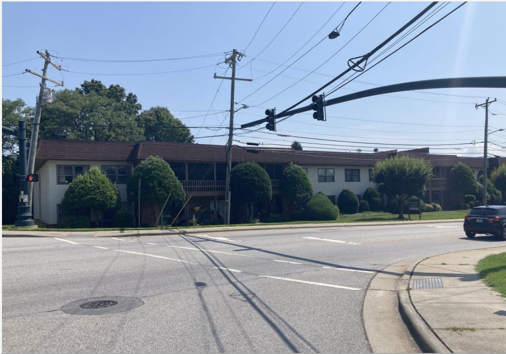
Multi-family on US 64 in the MIC