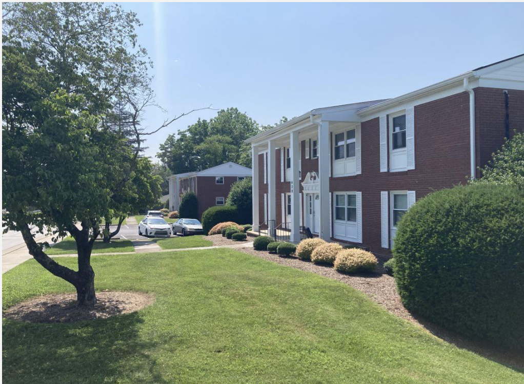
Multi-family on US 64 adjacent to MIC