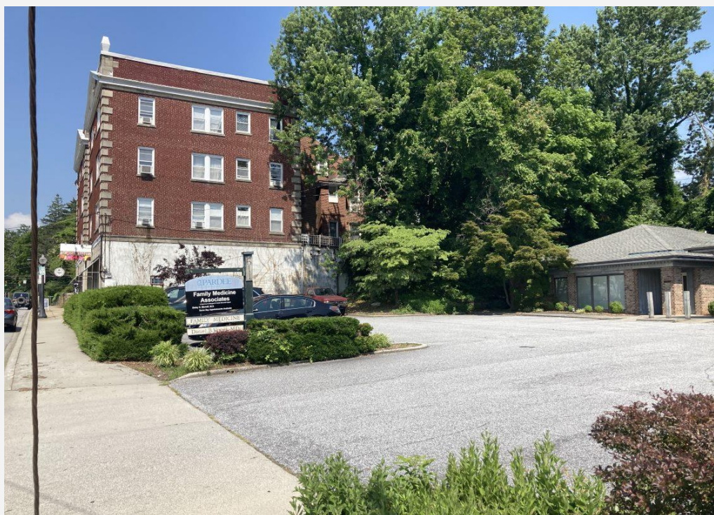
Contrast of setbacks: Mixed-use with multi-family apartments on upper floors and 0' setback (far) adjacent to medical office with parking in front and 65' front setback (near)