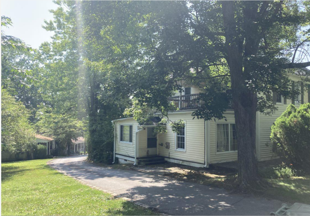
Multi-family in the MIC