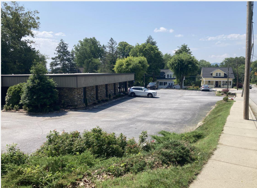
Conventional Suburban Development in MIC with parking in front and 50+' setback at Fleming St and 30' setback on 5 th Ave