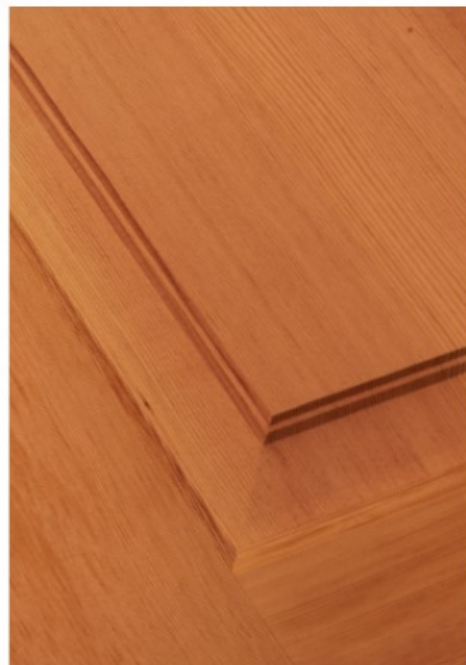
1-7/16" Double Hip Raised Panel - Interior Side