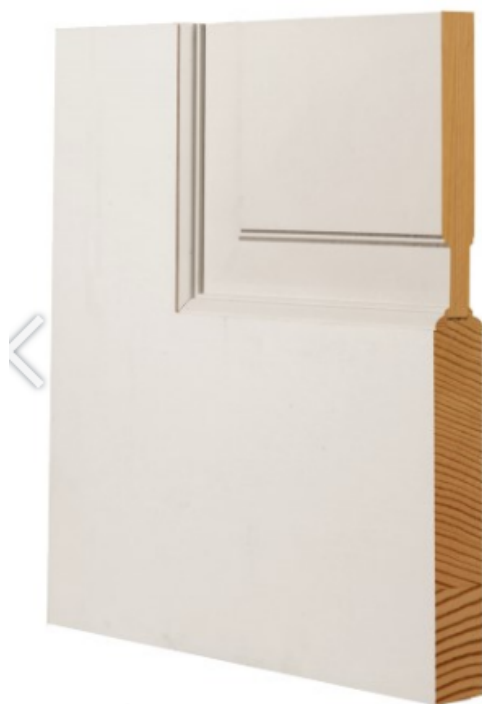
WaterBarrier® Door Corner