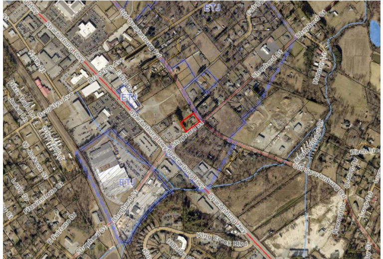
SITE VICINITY MAP

The City is in receipt of a Zoning Map Amendment (Standard Rezoning) application from Diane Ward (owner). The applicant is requesting to rezone the subject property from R-15 (Medium Density Residential) to C-3 (Highway Business). The subject parcel (PIN 9578-41-9518) is located at the intersection of Shepherd St. and Old Spartanburg Rd and is approximately 0.56 acres in total. The parcel contains an existing structure originally built as a single-family residence.