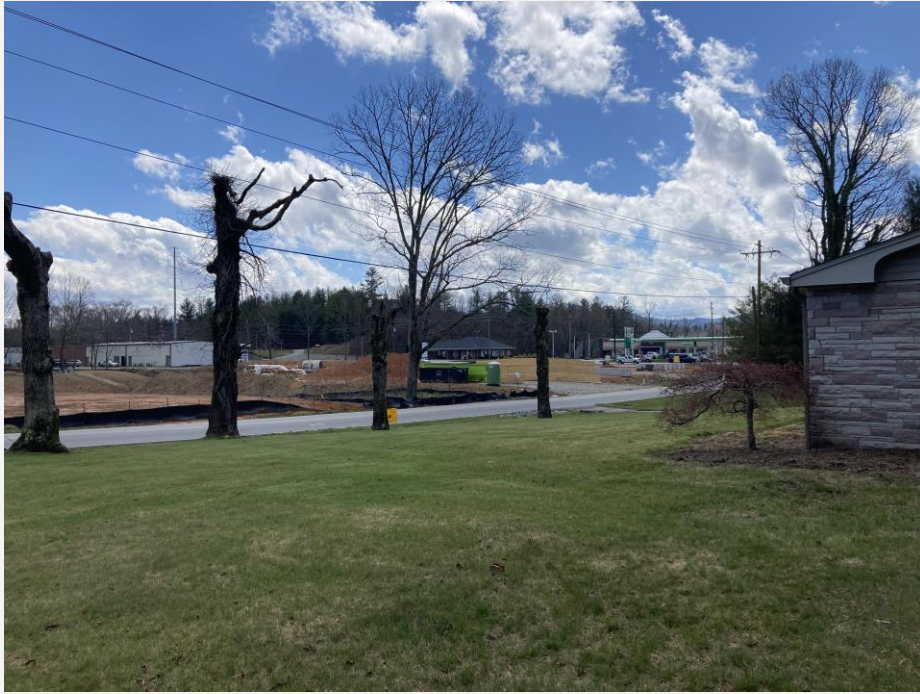
View from subject property from Old Spartanburg Rd facing southwest towards the BP service station at the intersection of Old Spartanburg Rd and Spartanburg Hwy