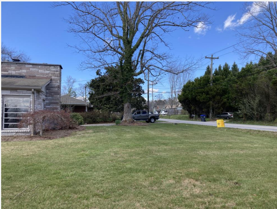
View of subject property from Shepherd St facing north towards Old Spartanburg Rd