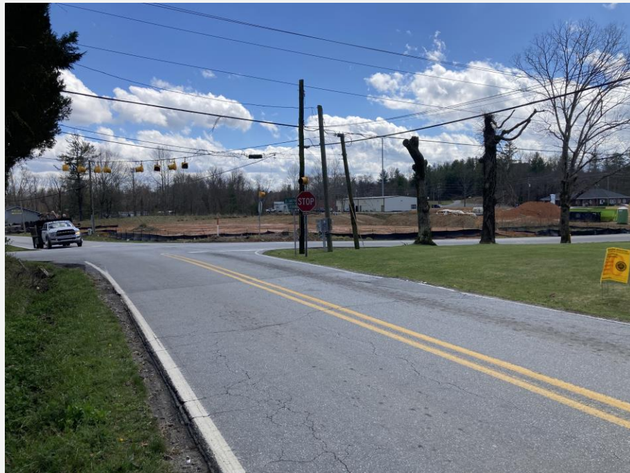
View from subject property facing east across the intersection of Old Spartanburg Rd and Shepherd St.