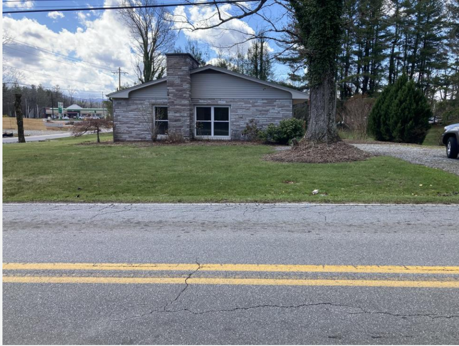
View of subject property from Old Spartanburg Rd facing west