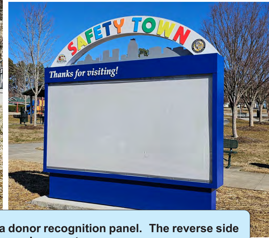
The Safety Town monument sign front has dimensional cut-out letters and a donor recognition panel. The reverse side features a blank panel for custom printed banners and announcements for upcoming events.

DESIGN & ENGINEERING | PROJECT MANAGEMENT IN-HOUSE MANUFACTURING | PERMITTING & CODE CHECKS SURVEYING & INSTALLATION