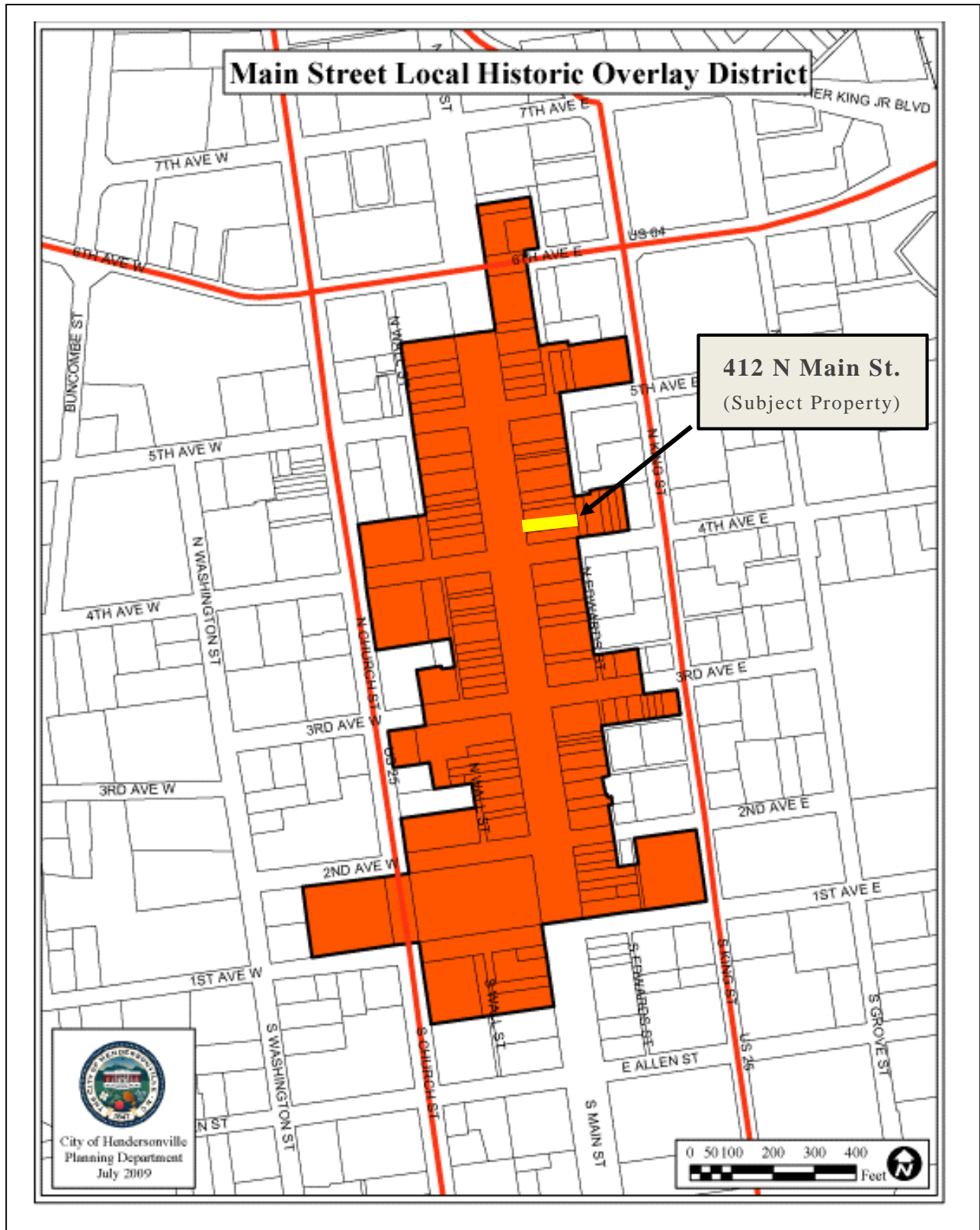
CITY OF HENDERSONVILLE - MAIN STREET LOCAL HISTORIC OVERLAY MAP