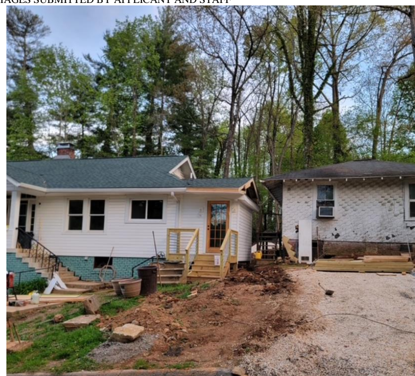
Before image of subject property.