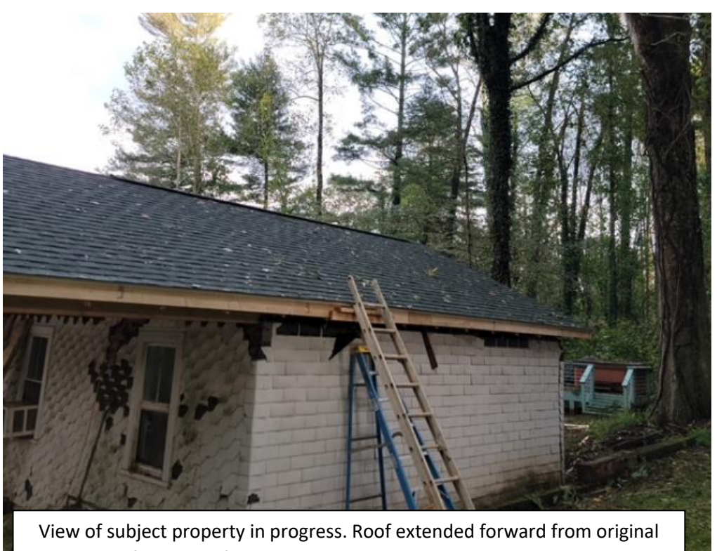
footprint of subject property.