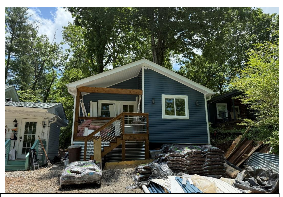
Front view of subject property. The right side of the structure is encroaching into the setback by two feet.