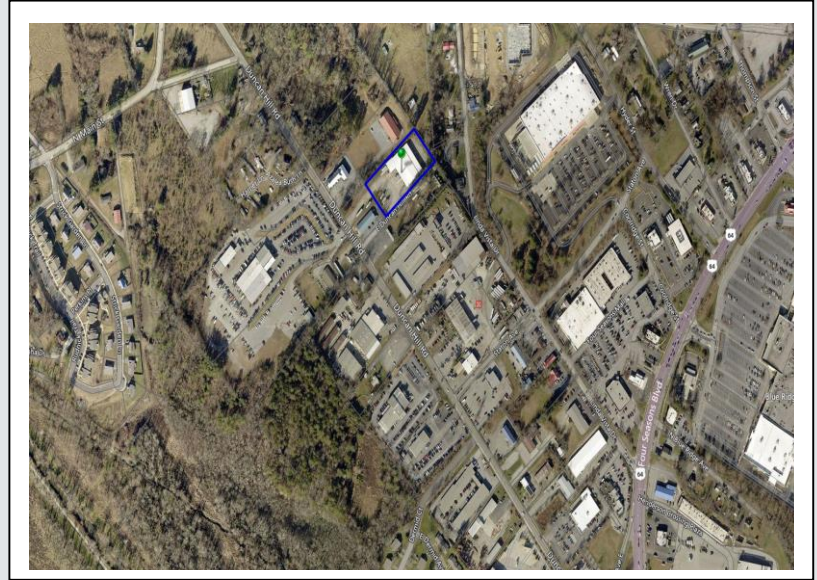
SITE VICINITY MAP

The City of Hendersonville is in receipt of an application for preliminary site plan review from Salvador Estrada of Estrada & Sons LLC. The applicant is proposing to construct a 4,000 square foot addition onto the existing 20,473 square foot business.