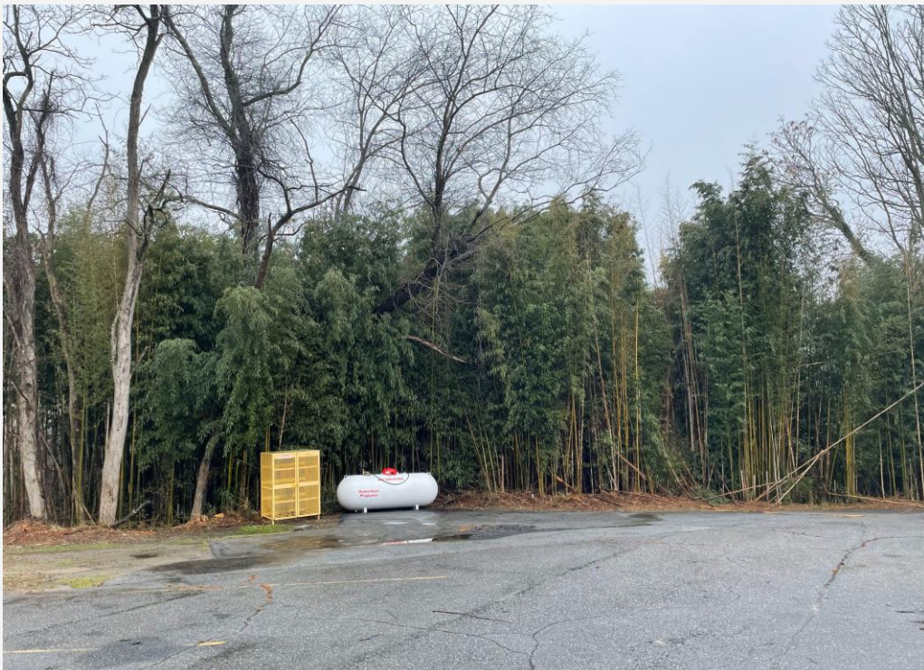
View of existing mature buffer on the rear of the property.