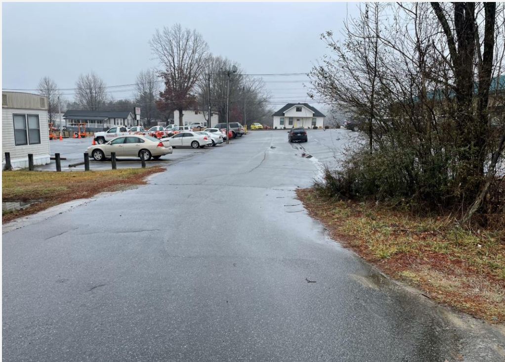
View of the sites access (E. Duncan Hill Road)