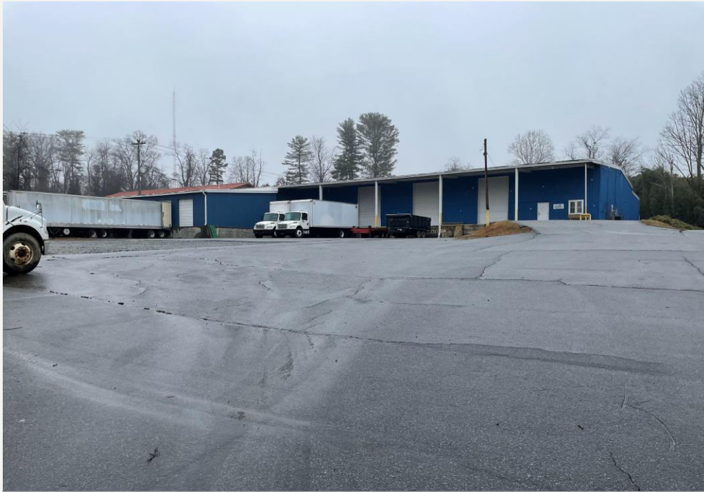
View of the front of the Estrada and Son's existing building.