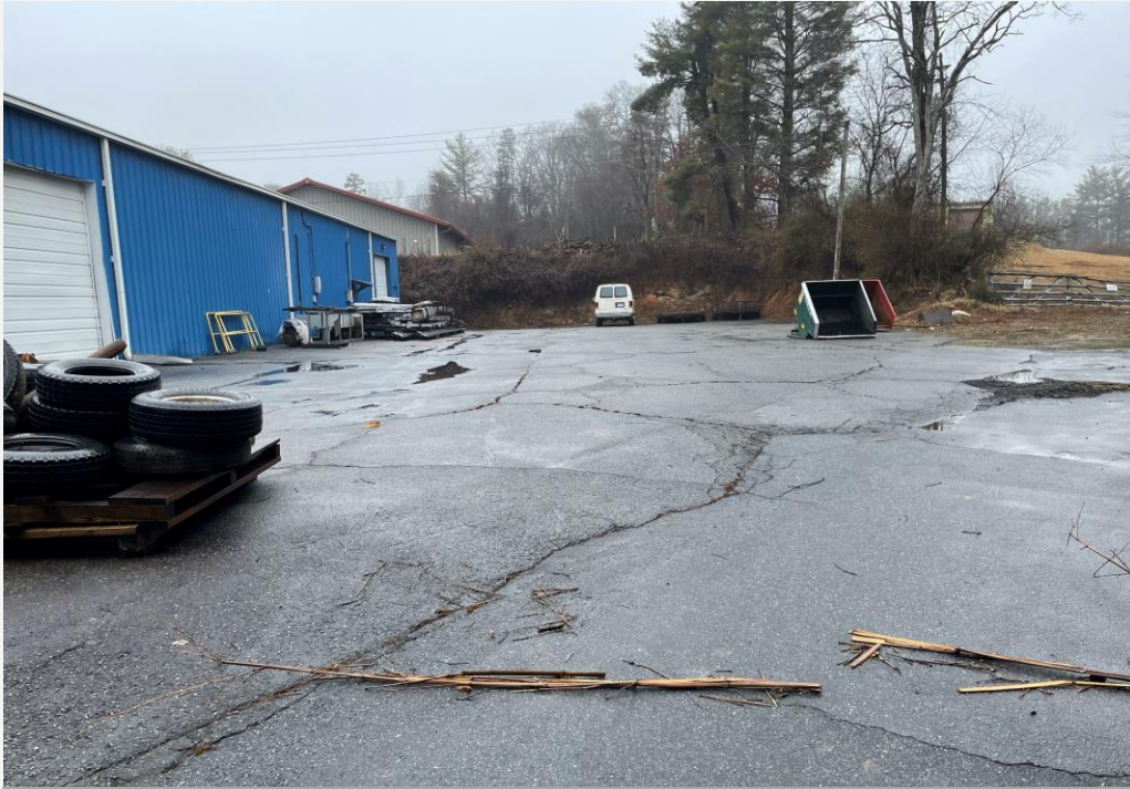
View of the rear of the building where the addition is proposed.