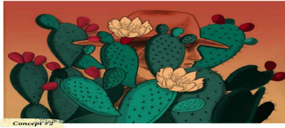
Wall B, Event Center West