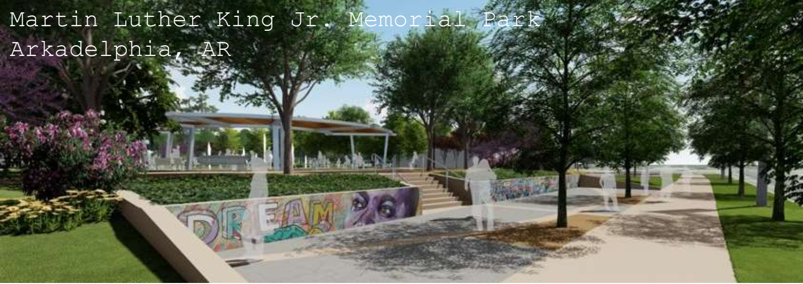
Martin Luther King Jr. Memorial Park Arkadelphia, AR