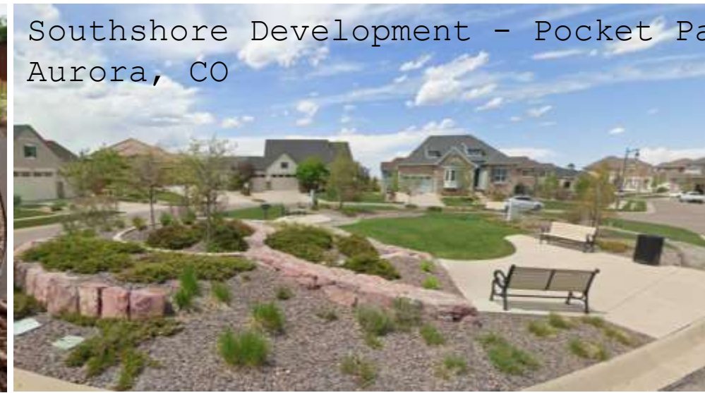
Southshore Development - Pocket Park Aurora, CO