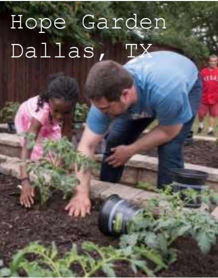
Hope Garden Dallas, TX