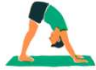
Downward Dog Pose