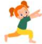
Warrior 1 Pose