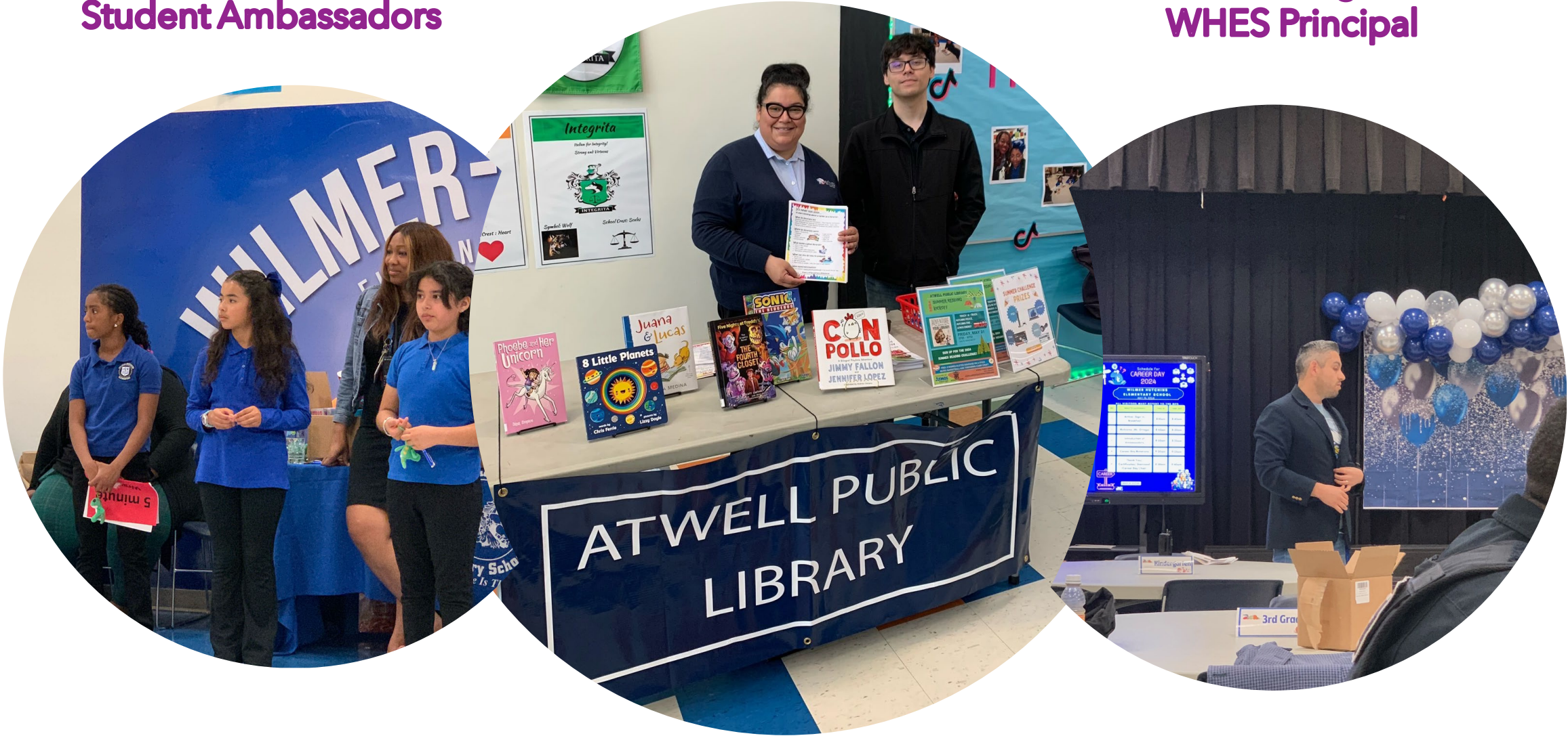
Presentations for 10 Classes – grades Pre-K through 1 st Grade