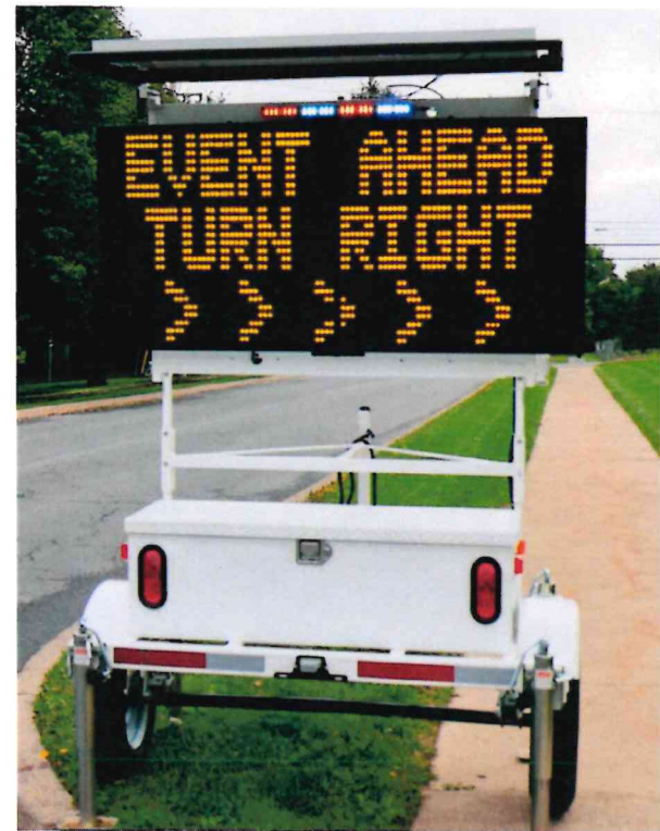
Flock-ready trailer with SpeedAlert 24 radar message sign and Flex LPR camera

Trailers are compatible with our InstAlert variable message signs and SpeedAlert radar message signs so you can share messages, reduce speeding, or collect traffic data while covertly capturing license plates.