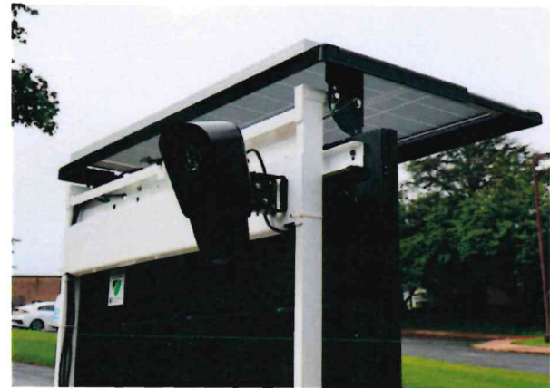
Cameras attached to rear mounting plate