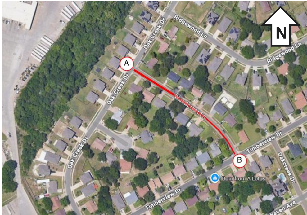
Figure 1 – Woodcrest Ln.