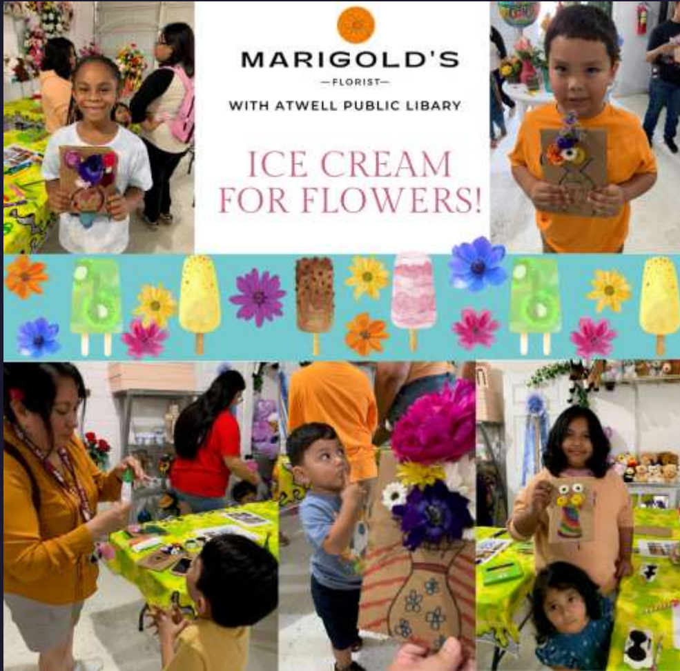
2024 "Ice Cream For Flowers!"