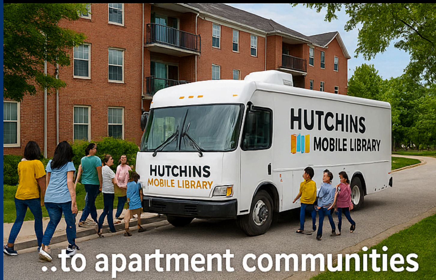
..to apartment communities