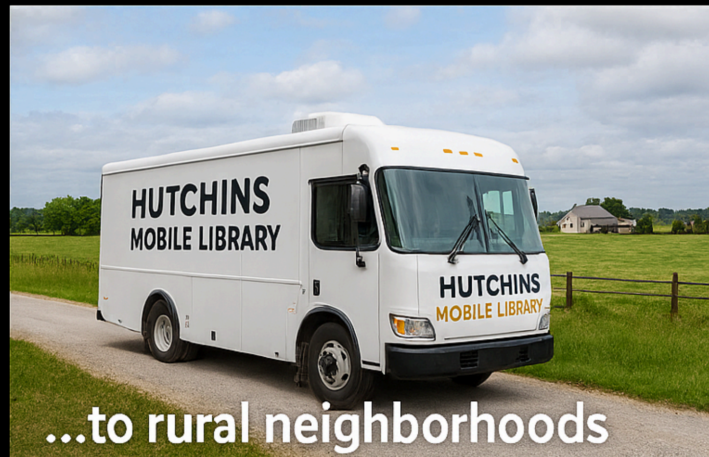
...to rural neighborhoods