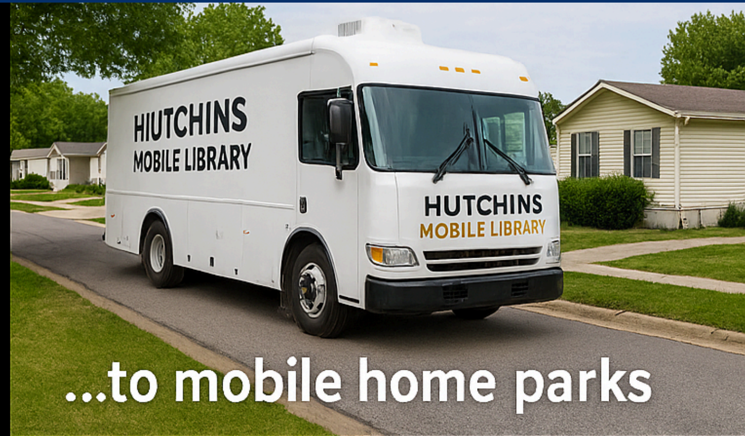
...to mobile home parks