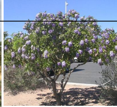
TEXAS MOUNTAIN LAUREL