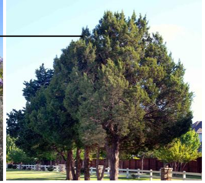
EASTER RED CEDAR