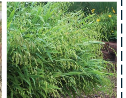
ISLAND SEA OATS