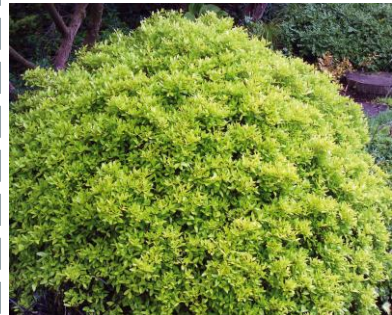
DWARF YAUPON HOLLY