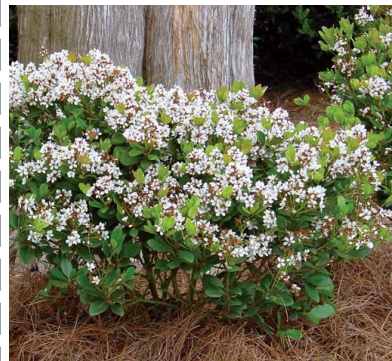
DWARF INDIAN HAWTHORN