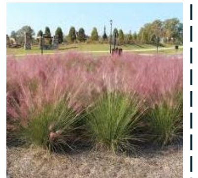
PINK MUHLY GRASS