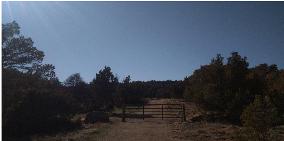
Figure 1: From front gate, dyke is visible in the background.

There is a dyke running NE/SW across the property that creates a visual separation between the facility and neighbors to the south and east (see dashed white line on vicinity map). The dyke running across the property blocks the view of the facility from adjacent properties. Below is a photo taken from the entrance to the property from CR 504: the facility is on the other side of the dyke, which appears as a ridge in the photo below, and which is marked with a white dashed line in the vicinity map below (Figure 2).