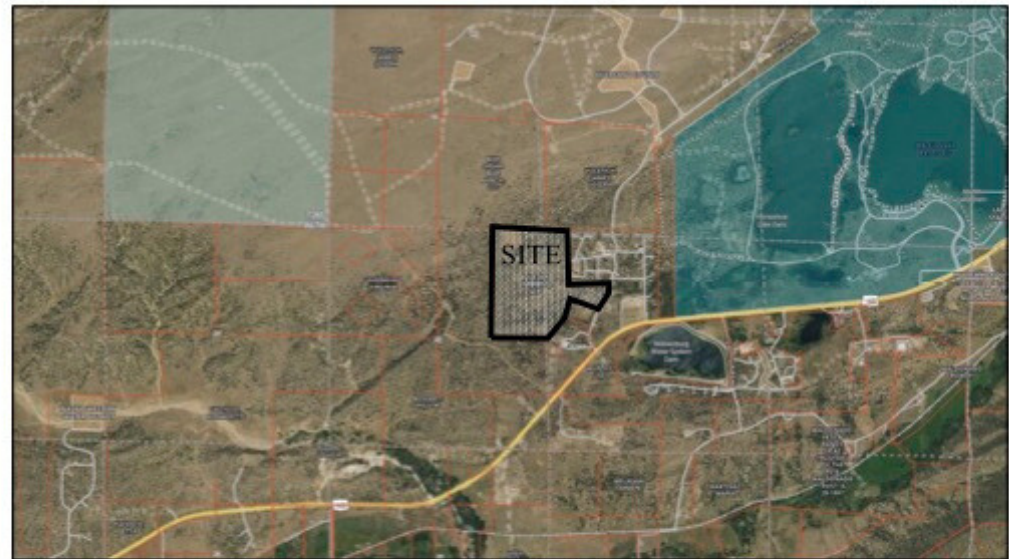
VICINITY MAP (not to scale)