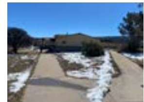
Youth Camp Tier 2