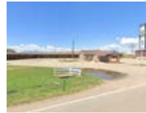
Former Motel Tier 2