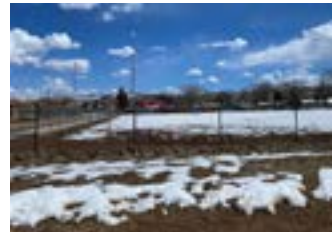
Ballfields Tier 2