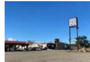
Black Knight Inn Tier 3