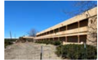
Rio Cucharas Inn Tier 2