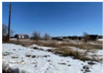
Hoobler Property Tier 3