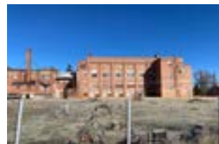
St. Mary's School Tier 3