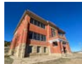
Polk Ave School Tier 2