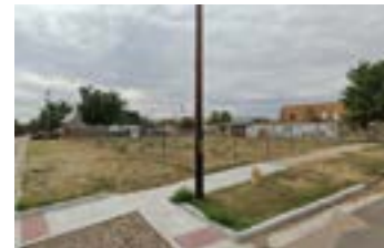
Washington School Tier 2