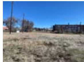
Former Football Field Tier 2