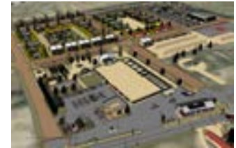
Gardner PUD Site Tier 1