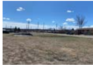
Spruce and Sproul Tier 1