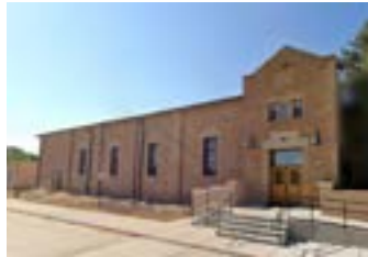
School Campus Tier 1