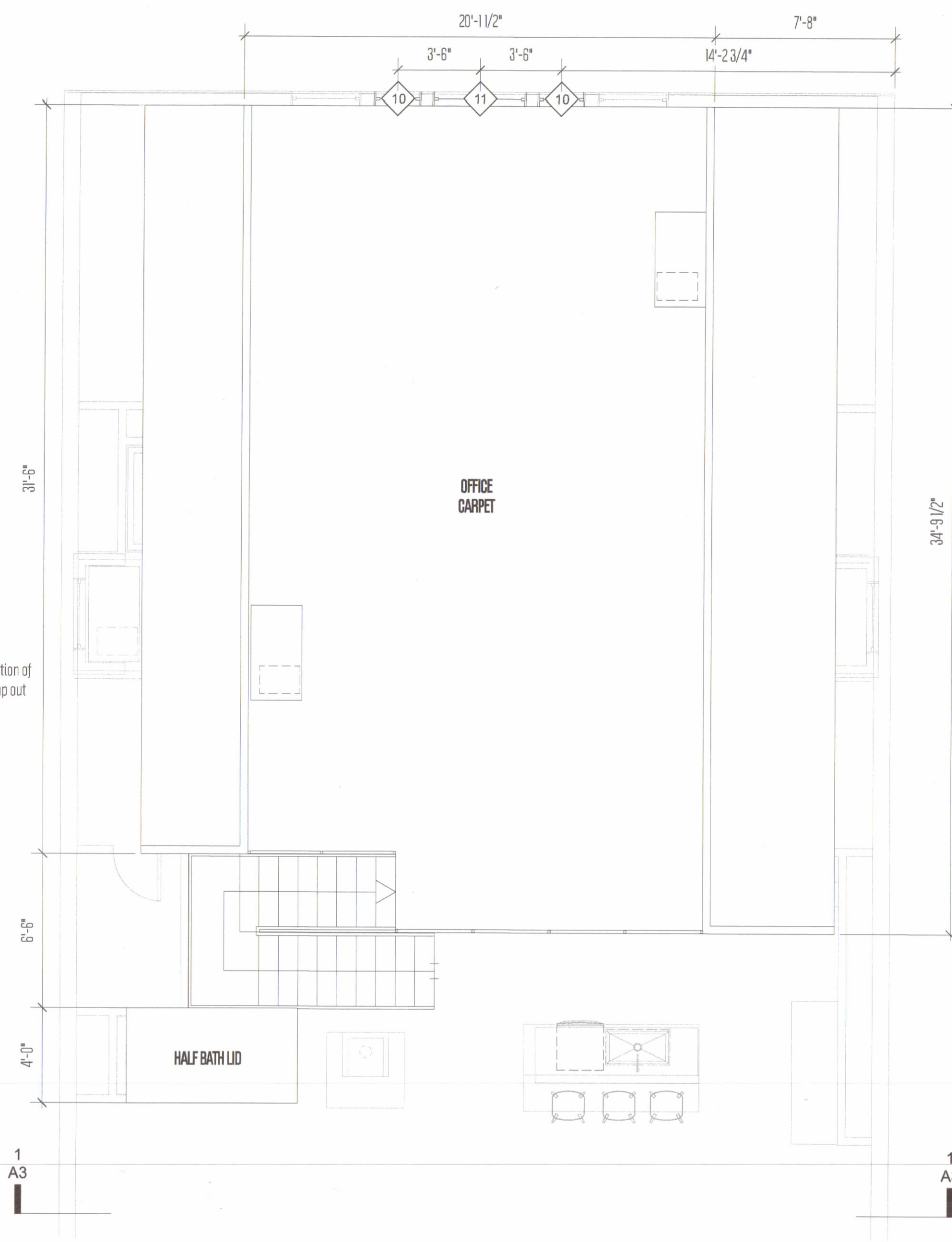
Upper Level Floor Plan Scale: 1/4" = 1'-0"