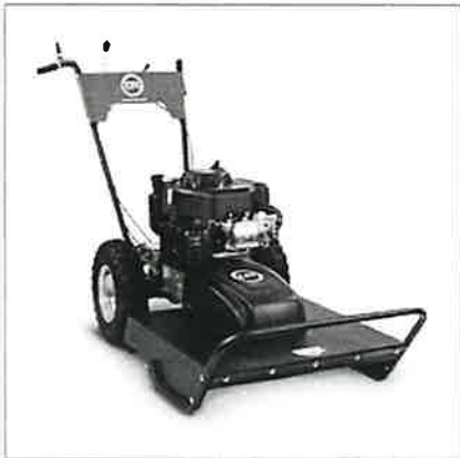
DR Premier 26" Field and Brush Mower - 10.3 HP - Manual-Start - Walk-Behind

070-49100-51220/GPID 601-40600-51382/public works 001-50100-51380/park & Rec 001-40400-51380/AT Post 002. 43040. 52000 $1,000 out of each line item.