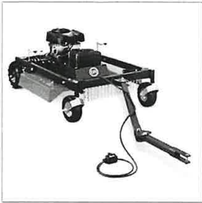
DR PRO 44" Field and Brush Mower - 17.5 HP - Electric-Start - Tow-Behind