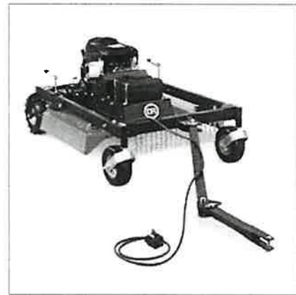
DR PRO XL 44" Field and Brush Mower - 20 HP - Electric-Start - Tow-Behind