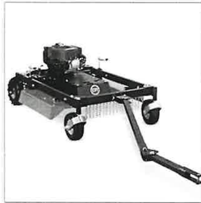
DR Premier 44" Field and Brush Mower - 10.3 HP - Electric-Start - Tow-Behind