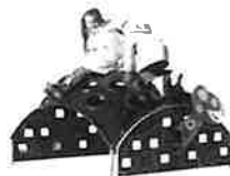
SportsPlay Equipment Inc Turtle Climber