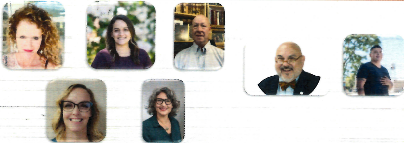
Our Leadership Team!